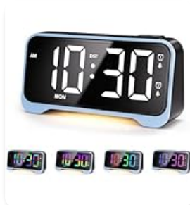
Image: The Mesqool Digital Alarm Clock, power adapter, USB cable, and user manual are neatly arranged, illustrating the complete