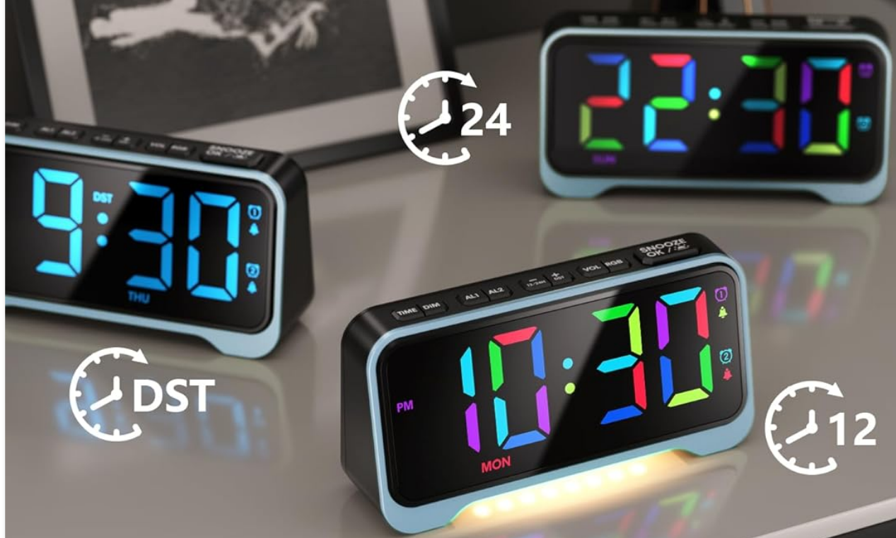
Image: The alarm clock's display shows examples of 12-hour and 24-hour time formats, along with the DST indicator, demonstrating time customization options.