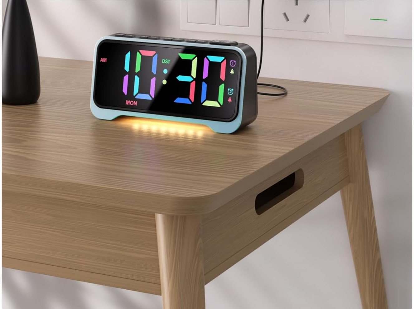
Image: The alarm clock is shown connected to a power outlet, indicating it is ready for use. The display is active.