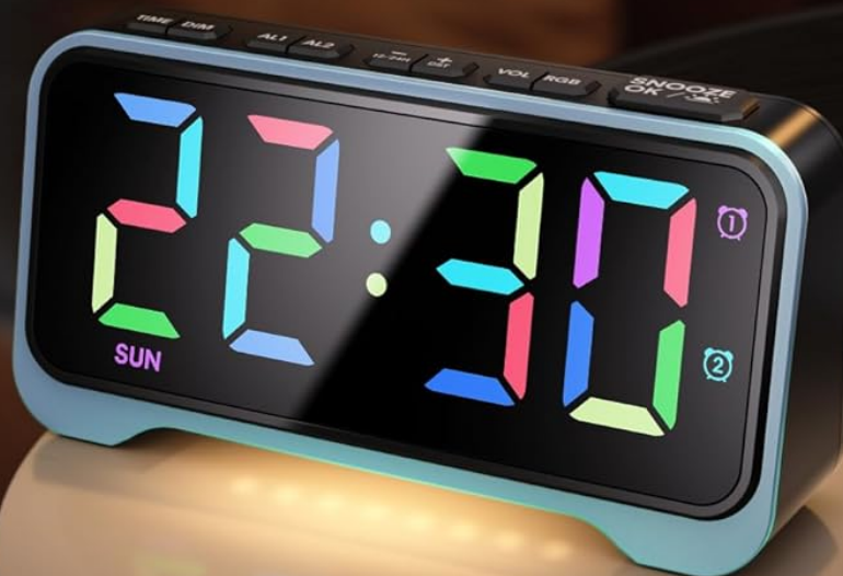
Image: The alarm clock with its integrated night light illuminated, demonstrating the three adjustable brightness levels for ambient lighting.