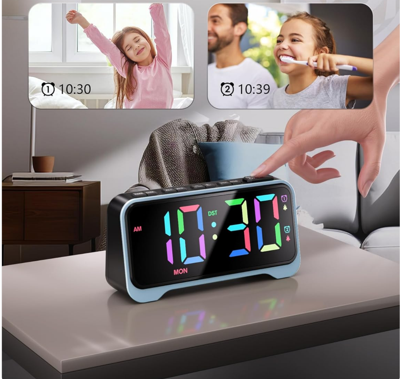
Image: The alarm clock displays two different alarm times, illustrating the dual alarm functionality and the prominent snooze button