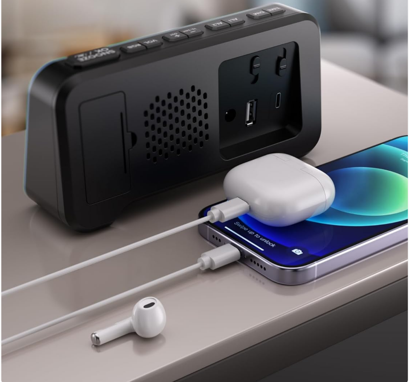
Image: The rear of the alarm clock shows a smartphone and wireless earbuds connected to its USB-A and Type-C charging ports, demonstrating its device charging capability.