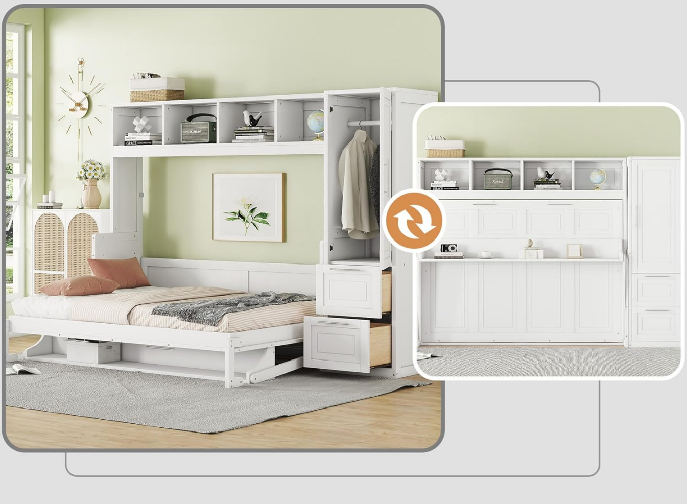
Image: Visual representation of the convertible Murphy bed, demonstrating its transformation from a bed to a compact cabinet.

This Murphy bed features an innovative foldable design that effortlessly tucks into your wall, maximizing floor space..