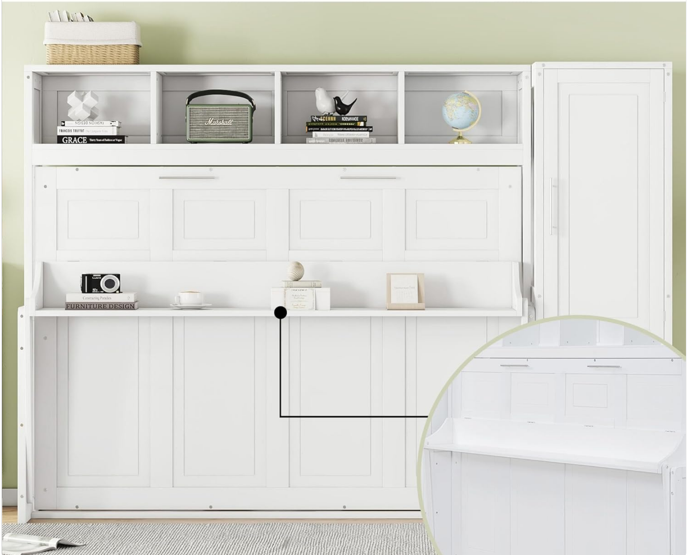
Image: The Murphy bed in its cabinet form, featuring the convenient drop-down desk for a temporary workspace.

The Murphy bed includes a sturdy drop-down desk on the side, transforming into a temporary workspace for remote work or study.