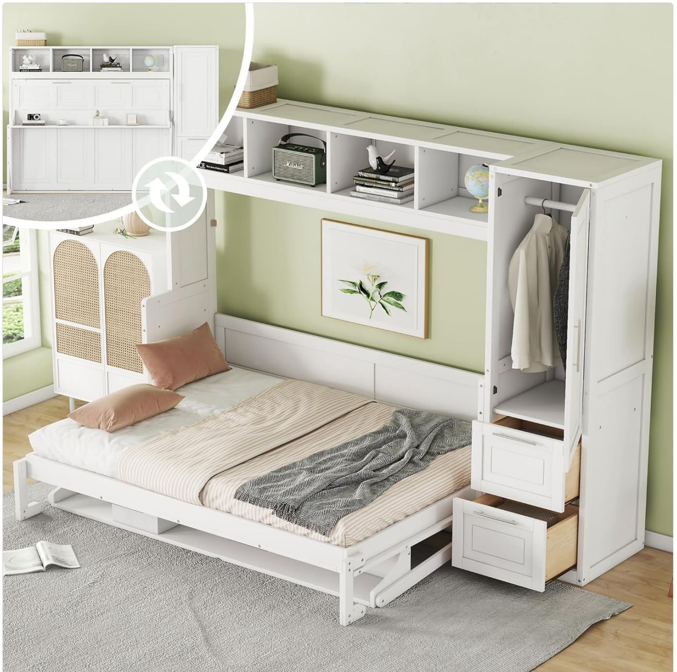
Image: The Linique Full Size Murphy Cabinet Storage Wall Bed in its open bed configuration, showcasing the integrated top shelf, side wardrobe, and two storage drawers.