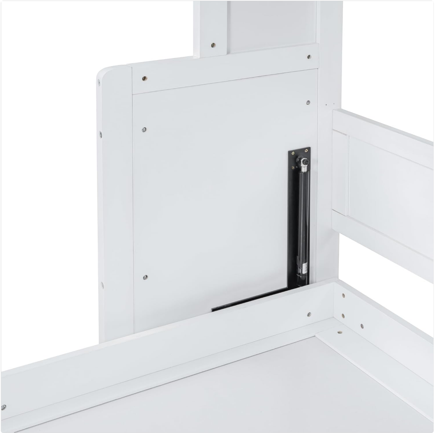
Image: A detailed view of the internal mechanism that facilitates the folding and unfolding of the Murphy bed.

7. Test the folding mechanism to ensure smooth operation.