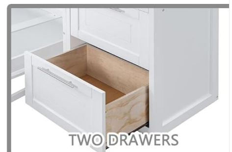
Image: Detailed view of the integrated storage components, including the top shelf, side wardrobe, and pull-out drawers.