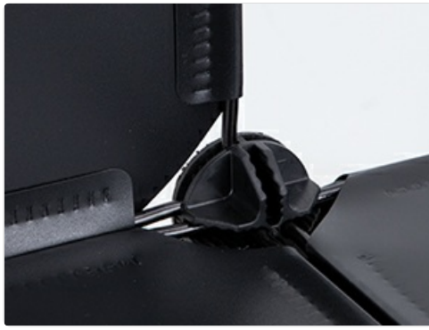
Figure 4: Detail of a reinforced connector ensuring panel stability.