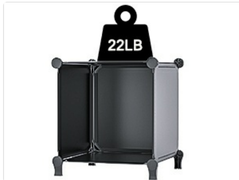
Figure 5: Each cube supports up to 22 pounds.