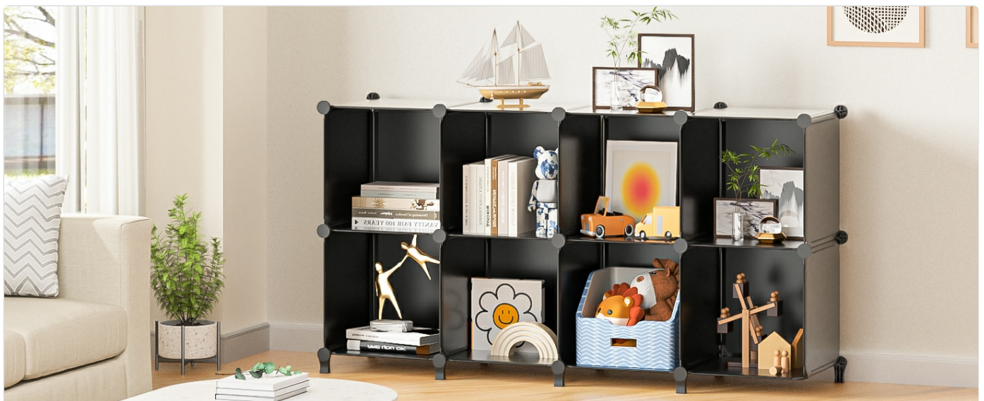
Figure 6: Versatile usage examples in different room settings.