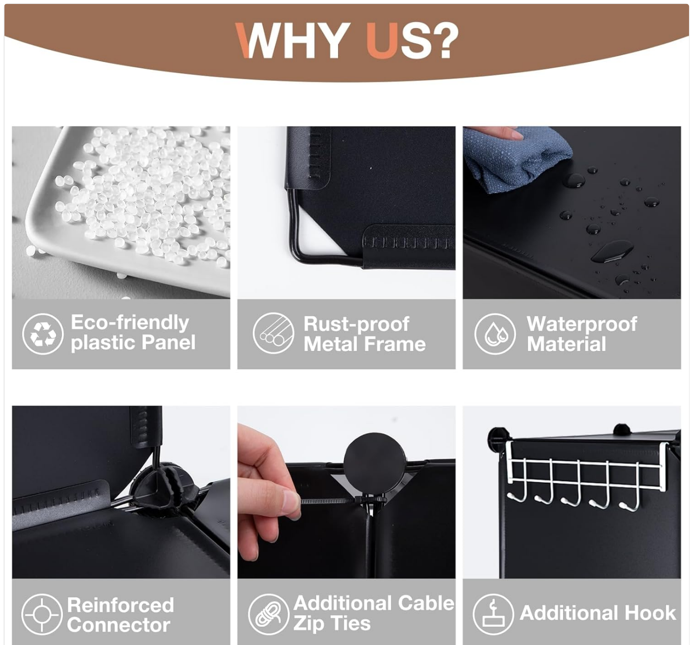
Figure 2: Key components and features of the Neprock 9-Cube Closet Organizer.