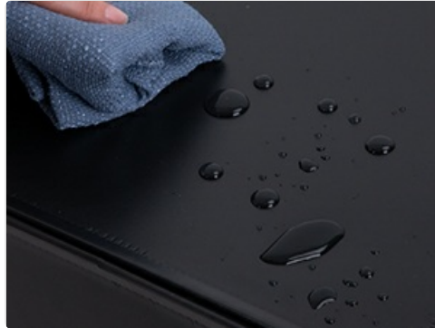
Figure 7: The panels are waterproof and easy to clean.