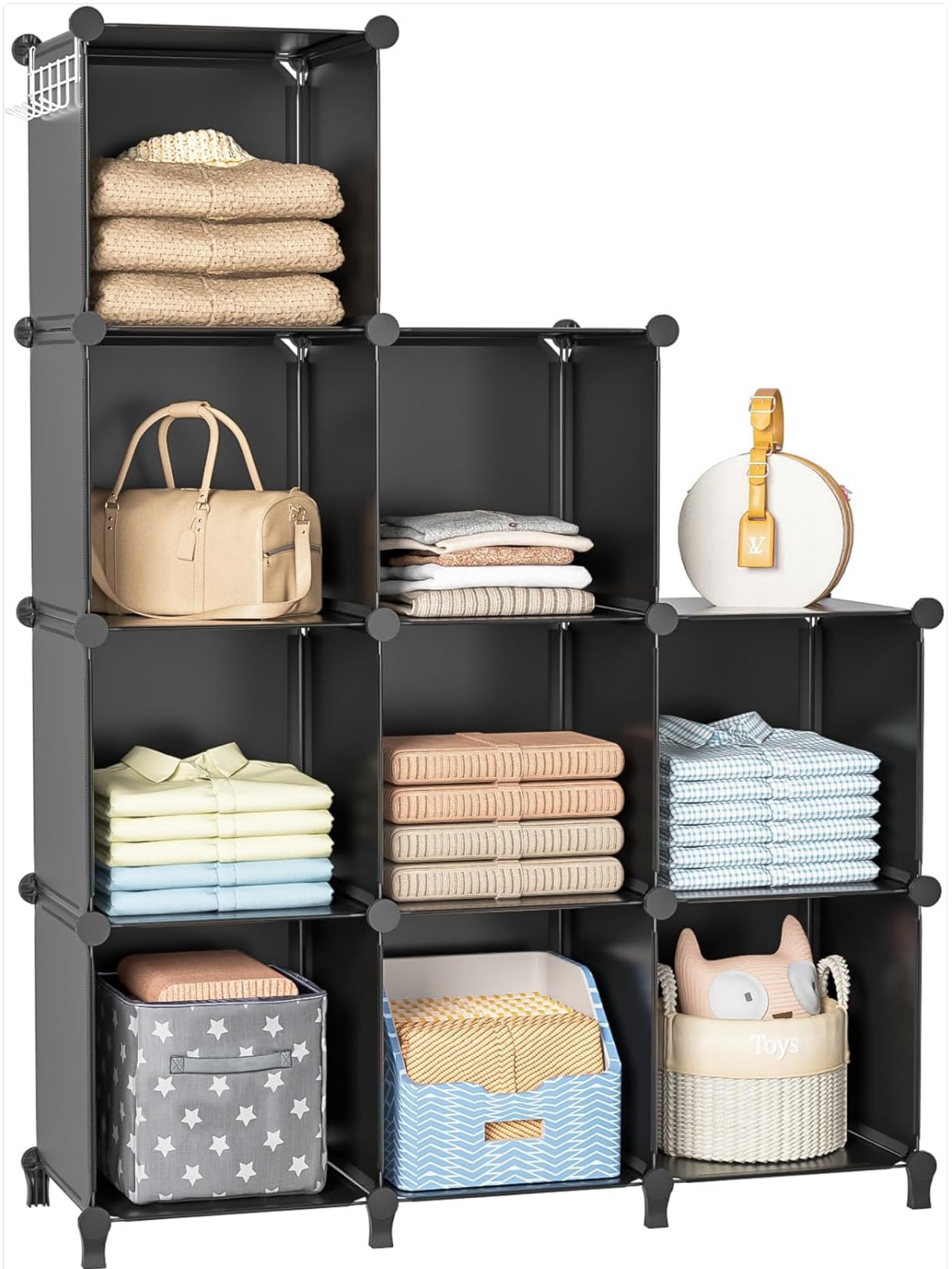
Figure 1: Fully assembled Neprock 9-Cube Closet Organizer, showcasing its capacity for various items.