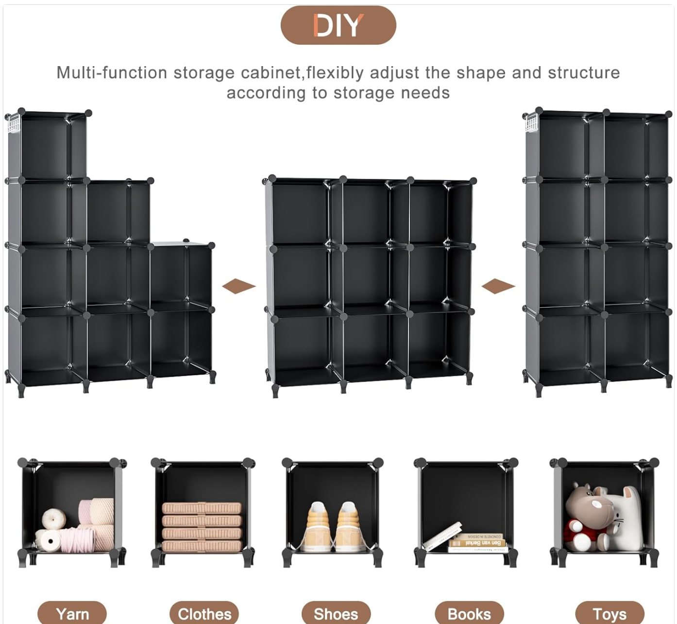
Figure 3: Examples of customizable configurations for the 9-Cube Organizer.

8. Final Check: Once fully assembled, gently push on the structure to ensure all connections are firm and the organizer is stable.