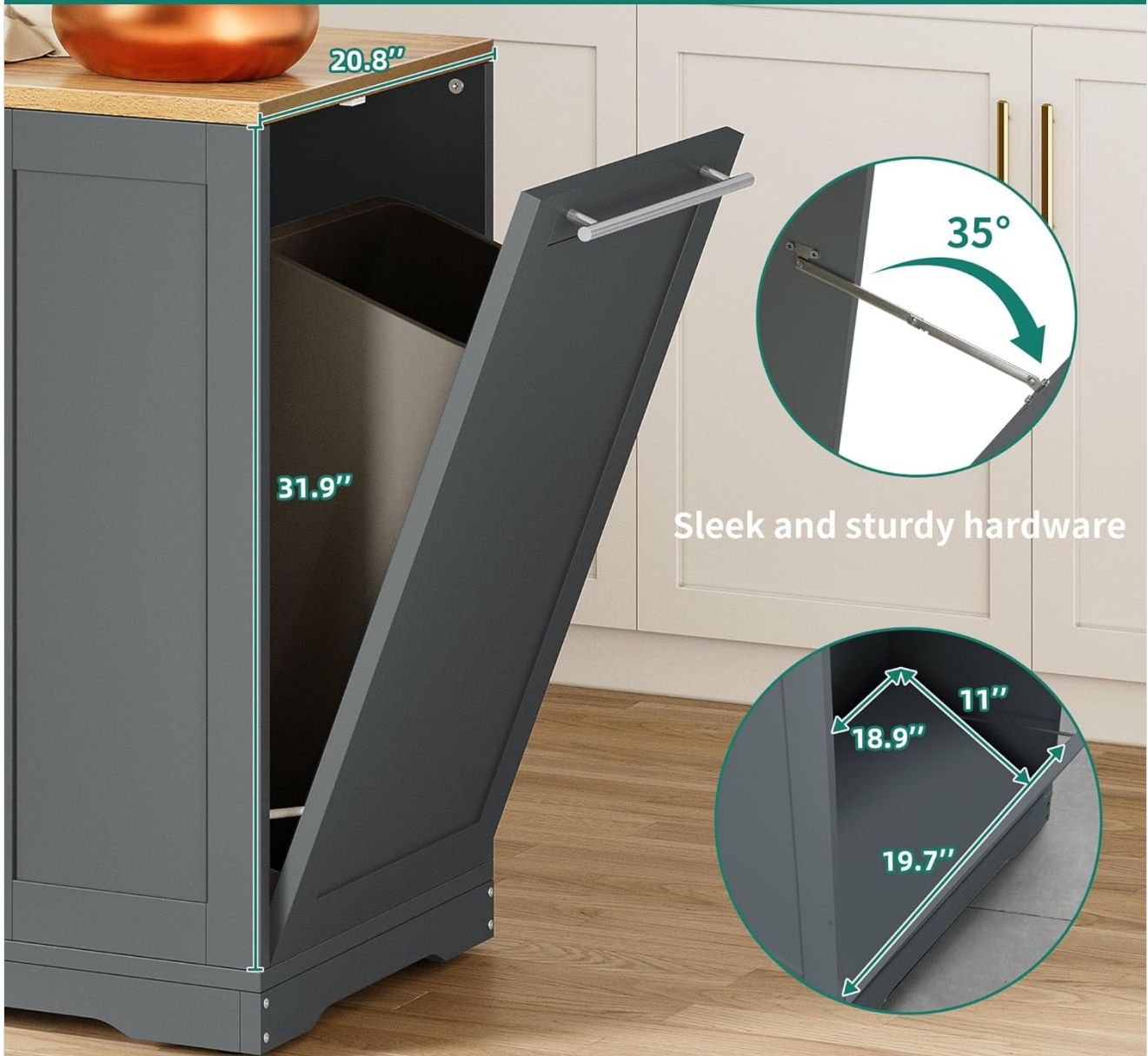
Image 4.1.1: The tilt-out mechanism of the trash can cabinet, showing a trash bin housed within. The door opens at a 35-degree angle for easy access.