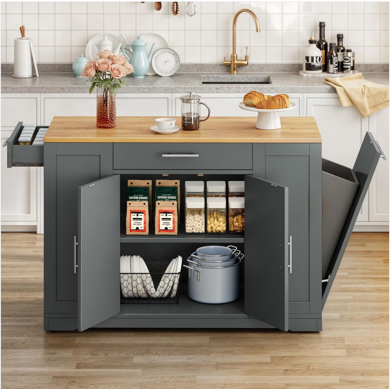
Image 4.2.2: The central cabinet doors are open, displaying the adjustable shelf and various kitchen items stored within, including bowls and a pot.