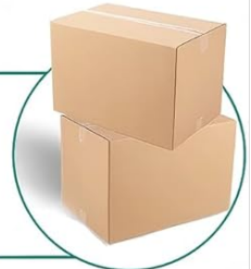
Image 2.1: Product dimensions and illustration of two shipping packages. The item is delivered in two boxes, which may arrive separately.

The item comes in two boxes and may not arrive at the same time