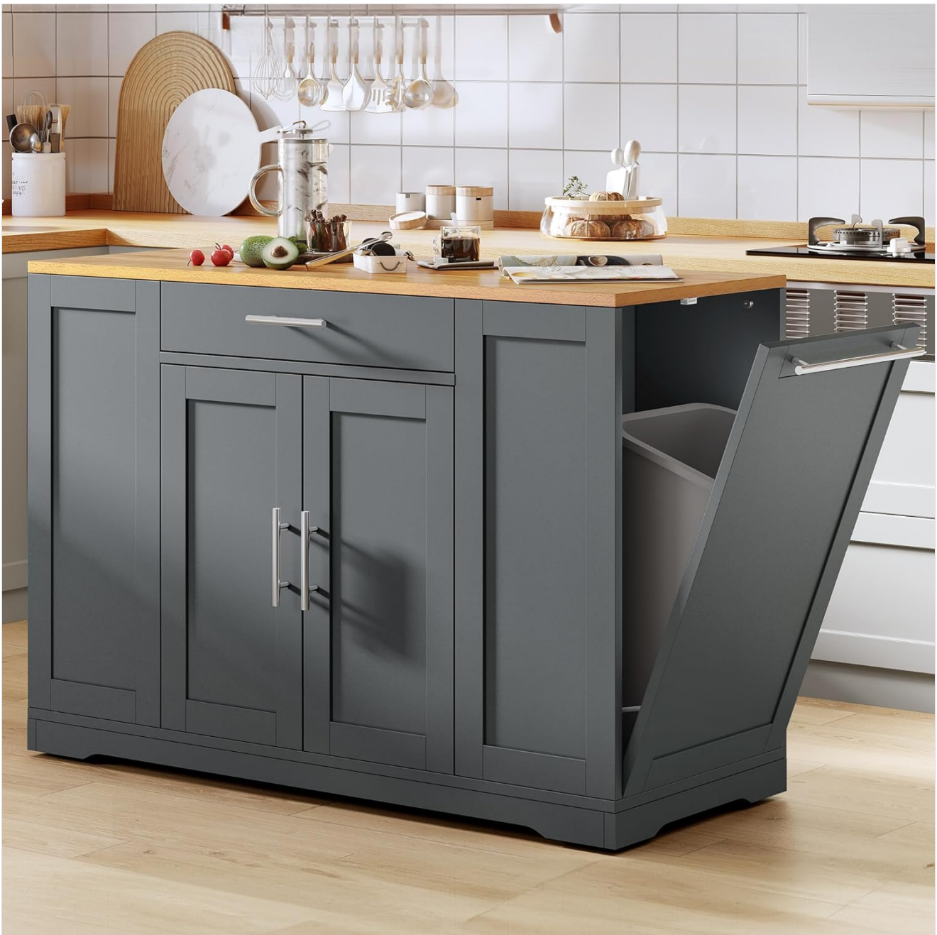
Image 3.1: The fully assembled YITAHOME Rolling Kitchen Island, showcasing its design and functionality in a kitchen environment.