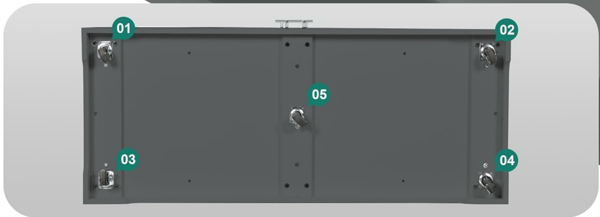
Image 4.3.1: A detailed view of one of the smooth-rolling, 360-degree swivel casters, highlighting the lockable mechanism for stability.