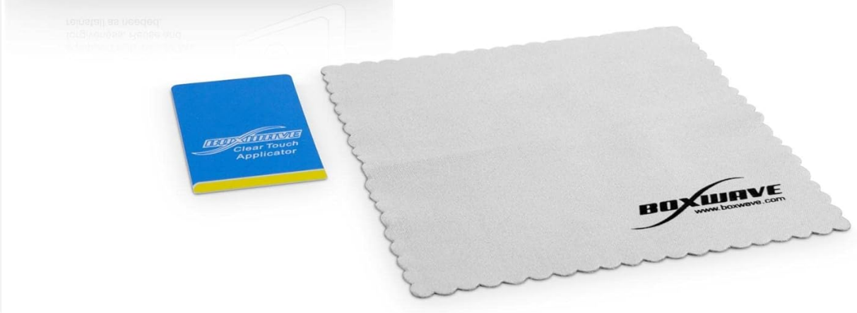
Image 1.1: Contents of the BoxWave ClearTouch Crystal Screen Protector package.