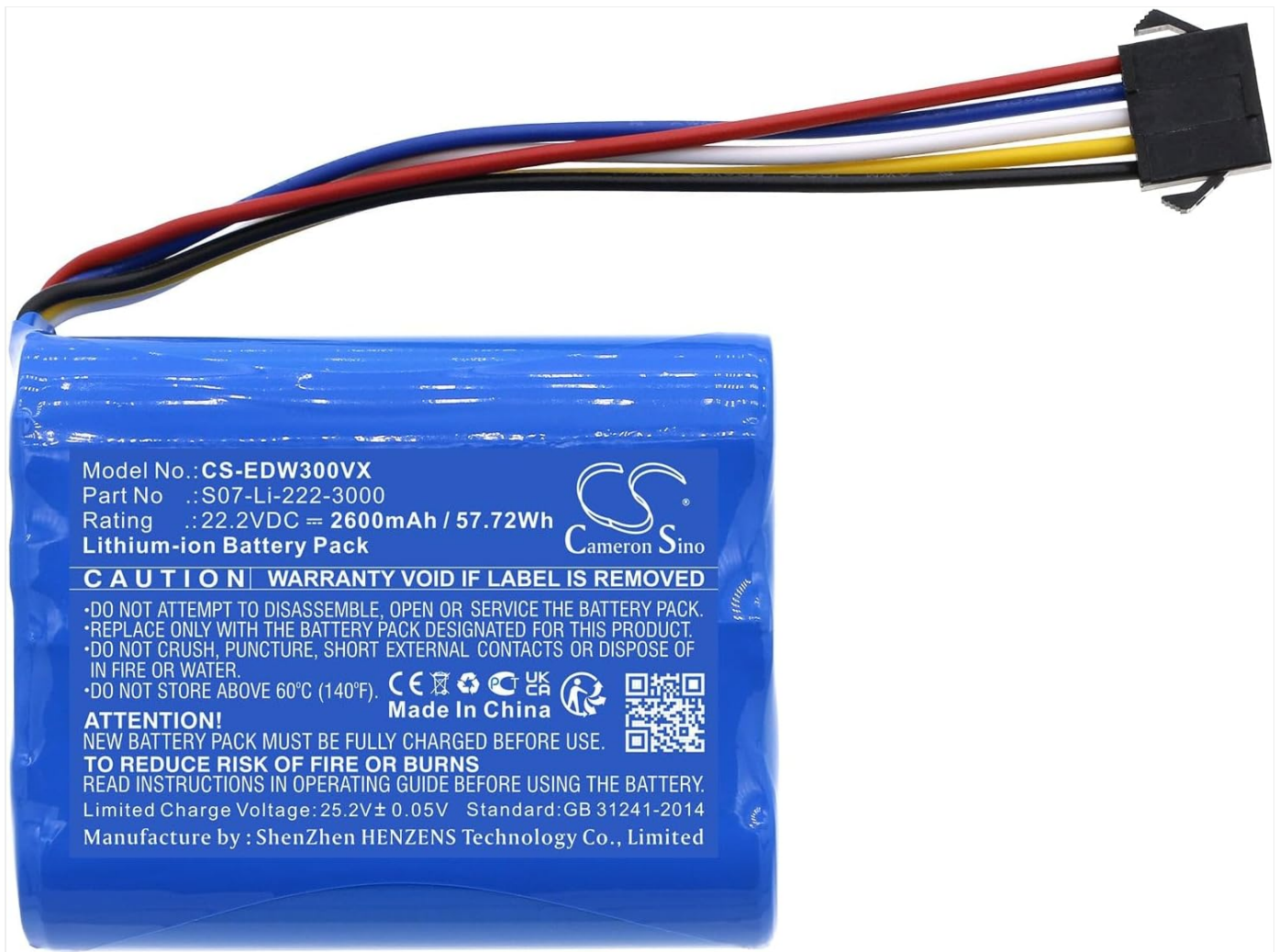
Image 2: The battery label displaying important safety warnings and specifications.