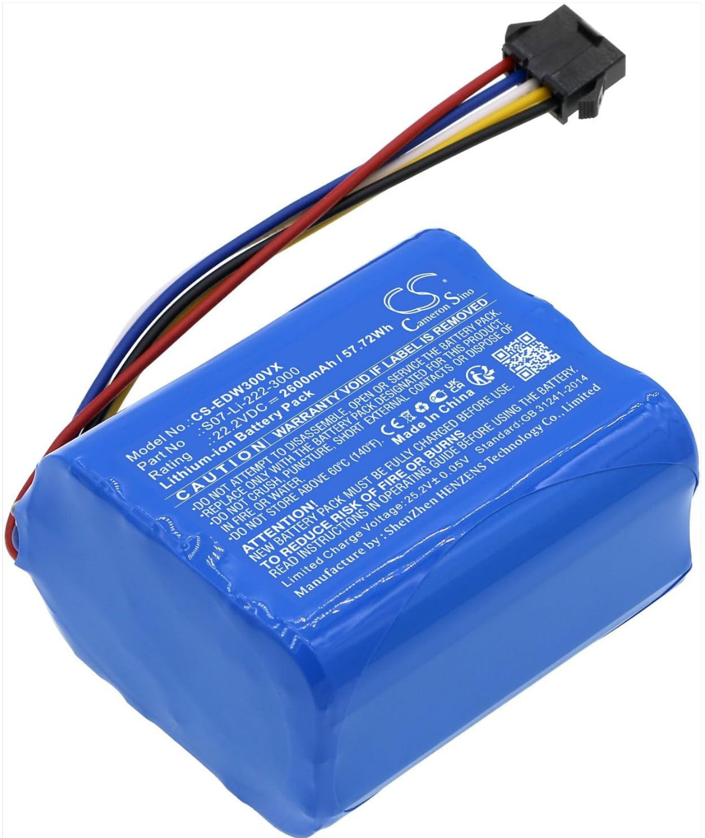
Image 1: The VI VINTRONS replacement battery, showing its compact design and connector.