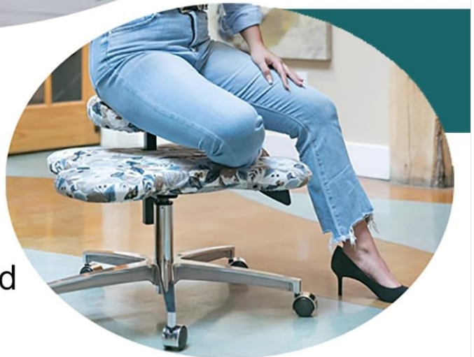
Figure 4: The chair's base with its multidirectional casters, designed for effortless movement.

It helps you move freely around your home or office.