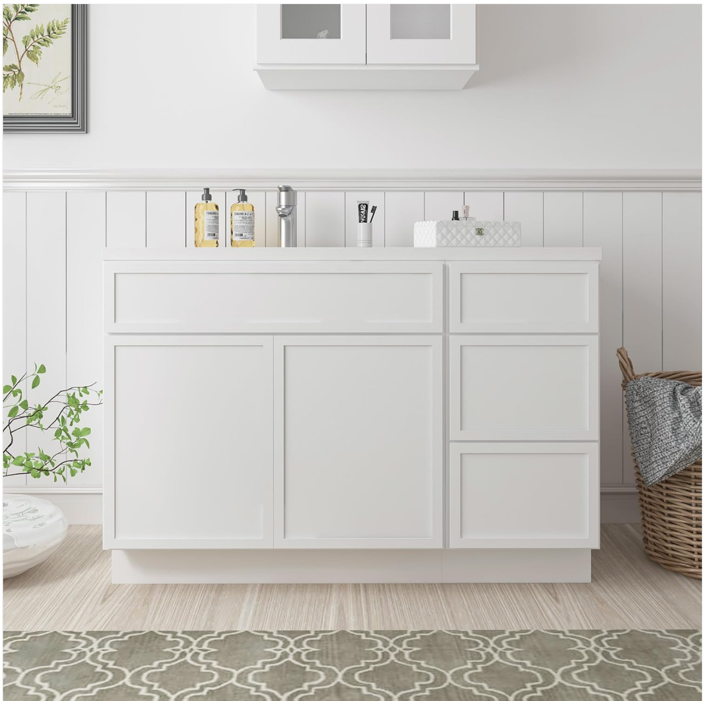
Image 1.1: Front view of the Vanity Art 48 Inch Unassembled Bathroom Vanity.