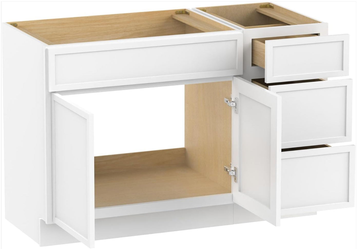
Image 4.2: Interior view of the vanity during assembly, showing open doors and drawers.