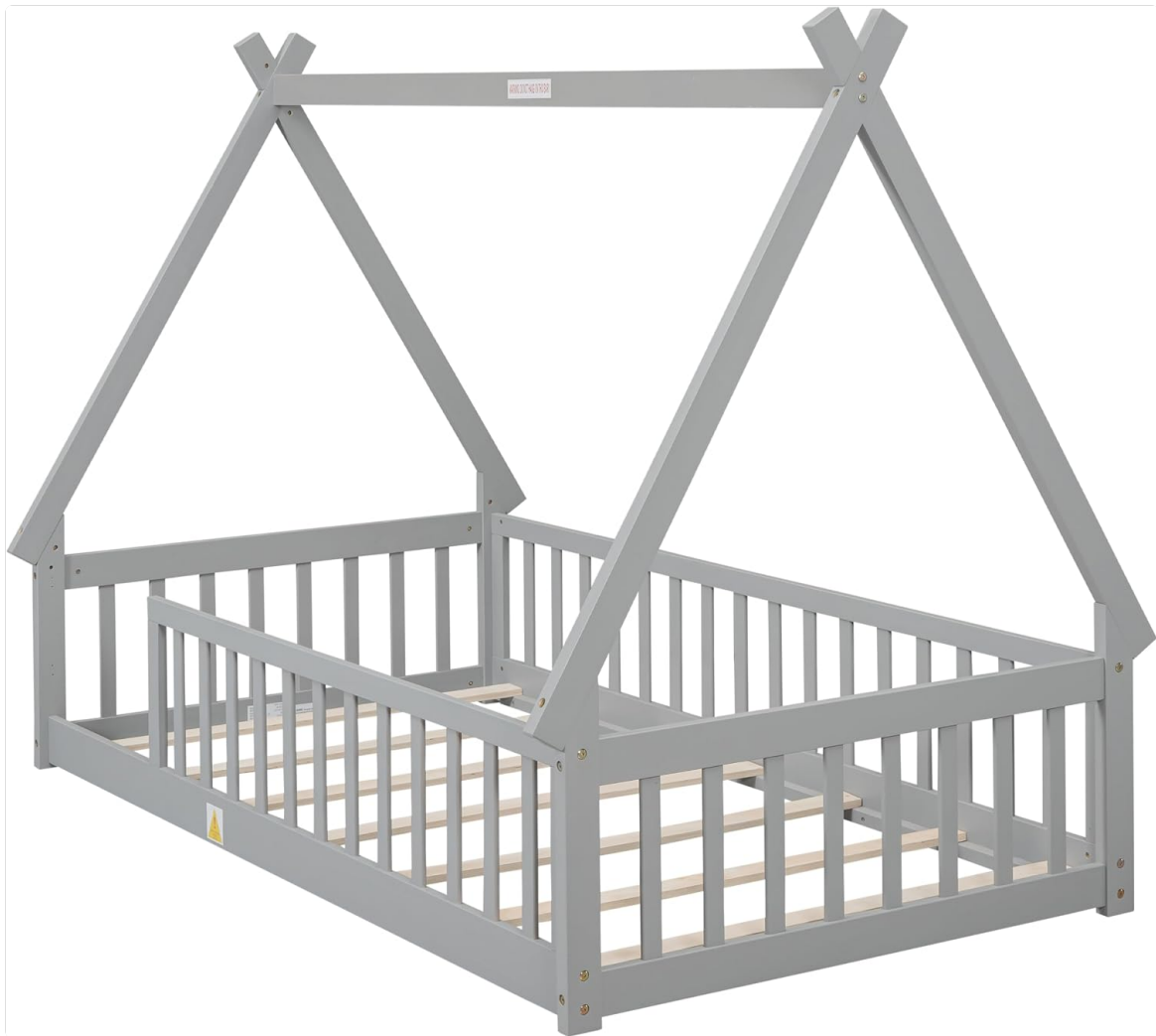
Figure 3.2: Low Height to Ground. This image illustrates how the bed's low profile allows children easy and safe access, promoting independence.