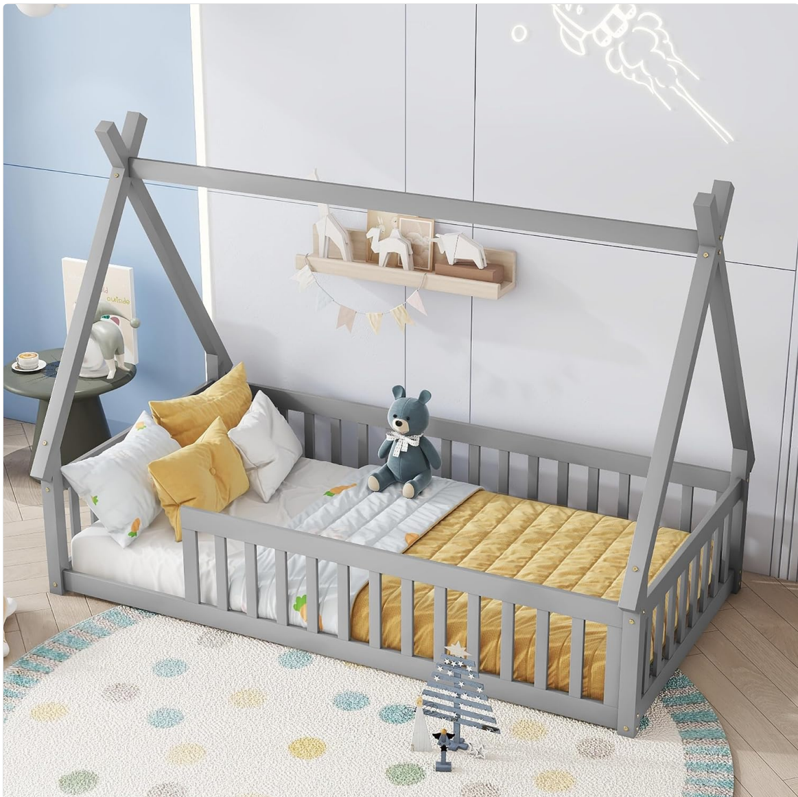
Figure 3.1: Safety Enclosure. This image highlights the 16.2-inch height of the safety rails, designed to provide a secure sleeping environment.