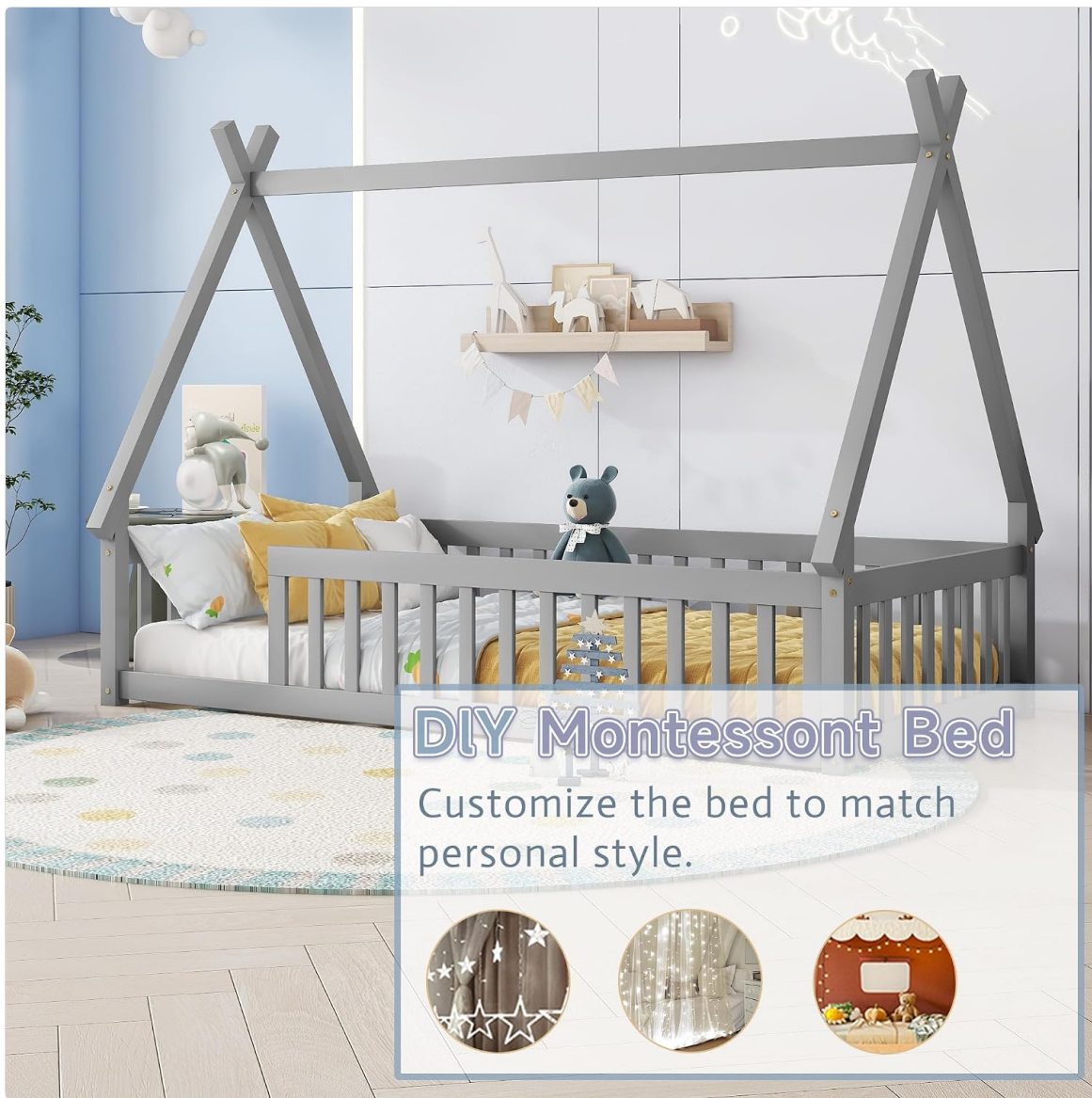
Figure 4.2: Bed Frame Components. This image displays the main structural elements of the bed frame before full assembly, including the base and the teepee top.