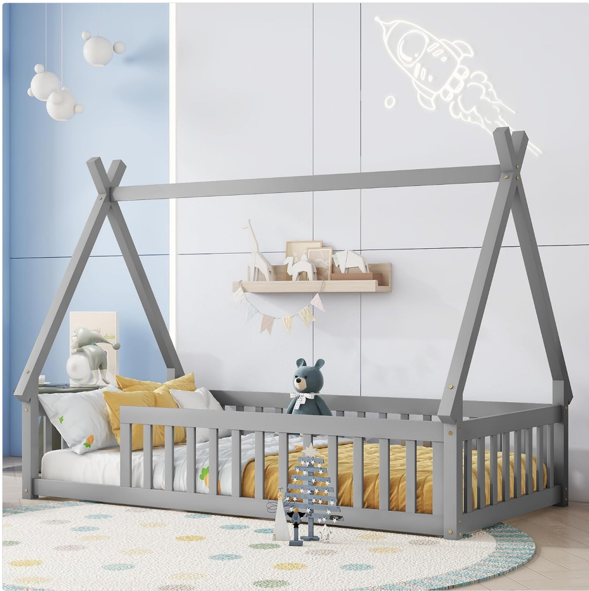
Figure 1.1: Assembled Mirightone Twin Size Teepee Floor Bed. This image shows the complete bed frame with its distinctive teepee shape and fence rails, suitable for a child's bedroom.