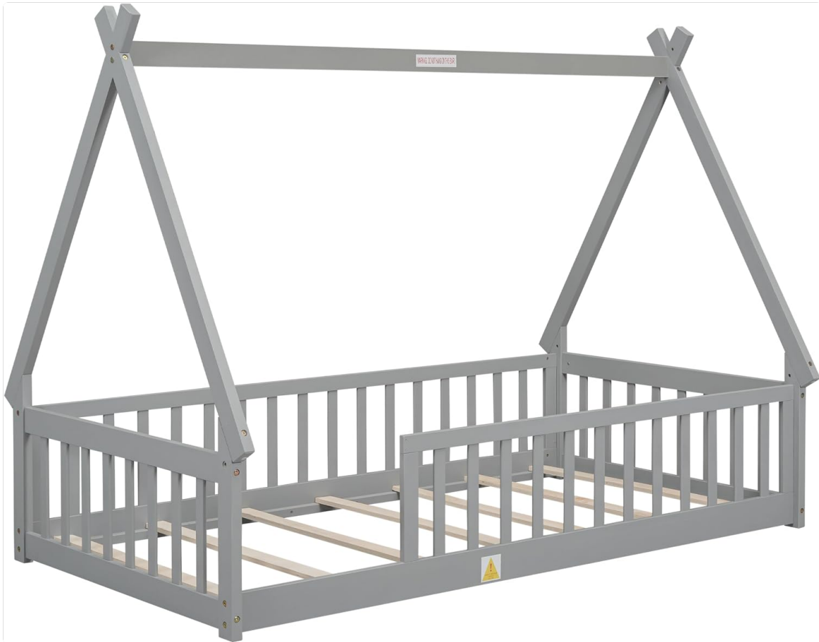
Figure 5.1: DIY Customization. This image demonstrates how the teepee bed can be personalized with various decorations to match a child's style and room theme.