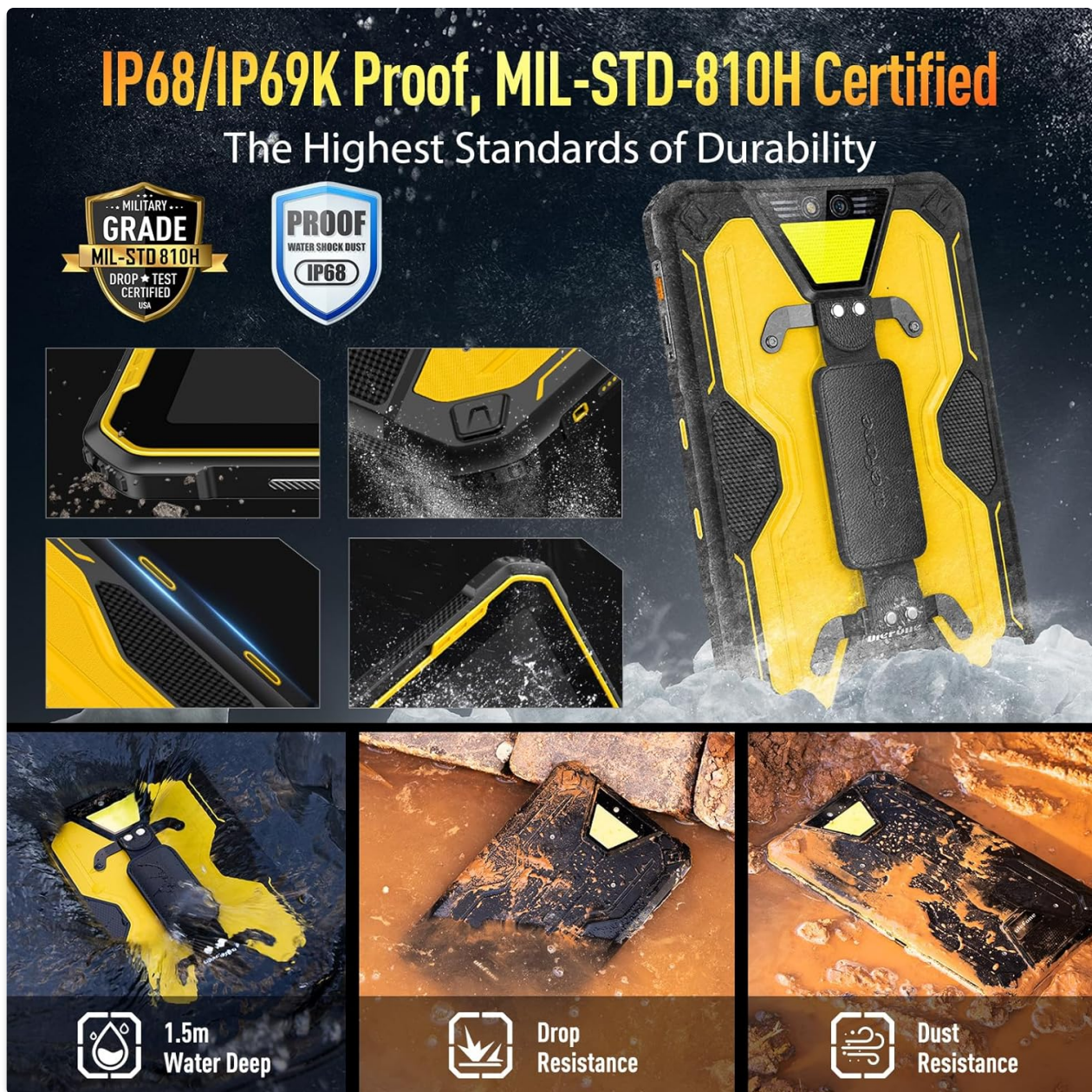
Image 7: Ulefone Armor Pad 2 showcasing its rugged features, including water, drop, and dust resistance.