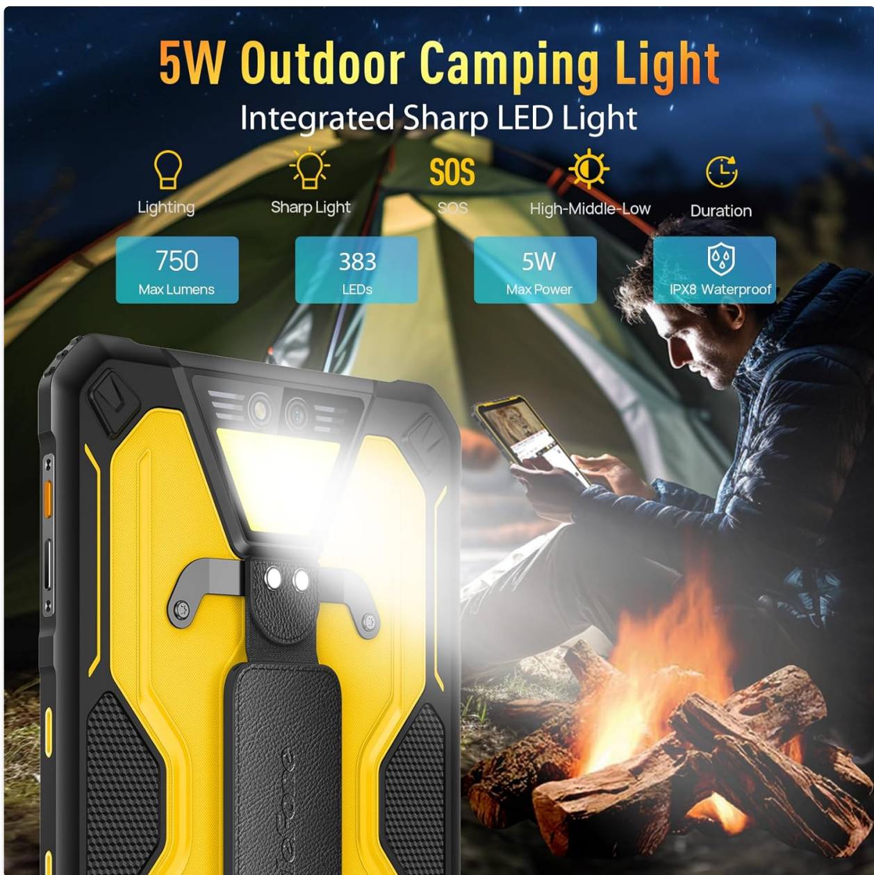
Image 3: Ulefone Armor Pad 2 demonstrating its 5W outdoor camping light.