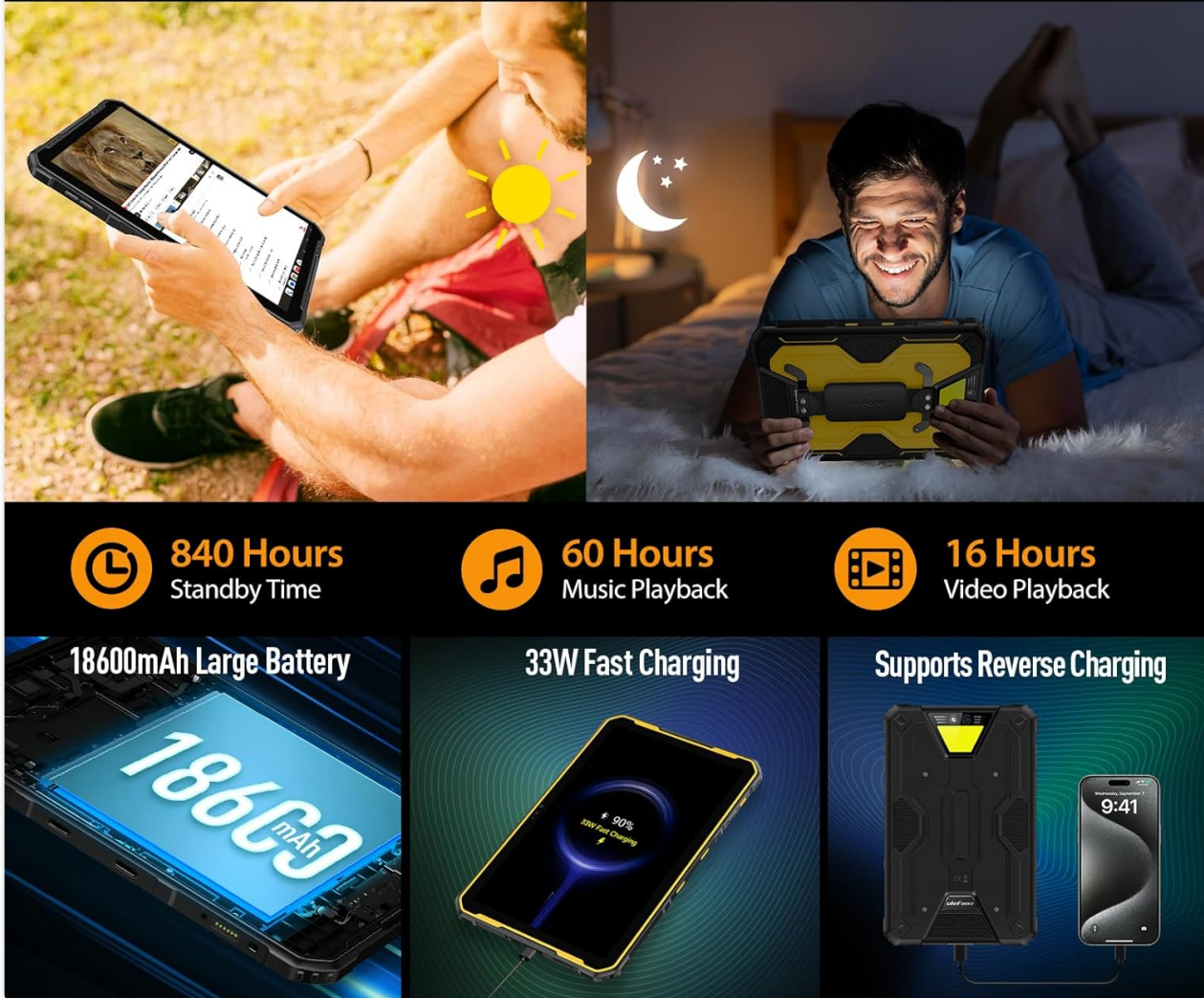
Image 8: Features of the 18600mAh battery, highlighting its capacity and charging capabilities.