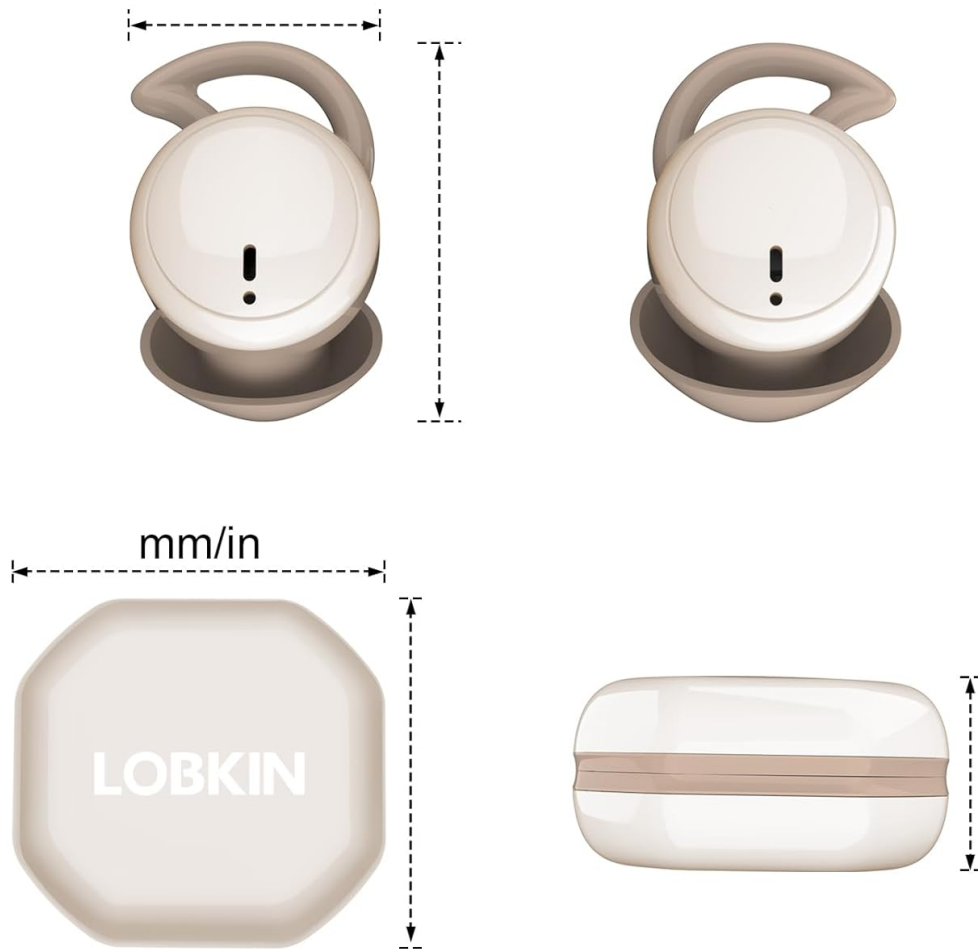
Image showing the dimensions of the LOBKIN S7 earbuds and their charging case in millimeters and inches.