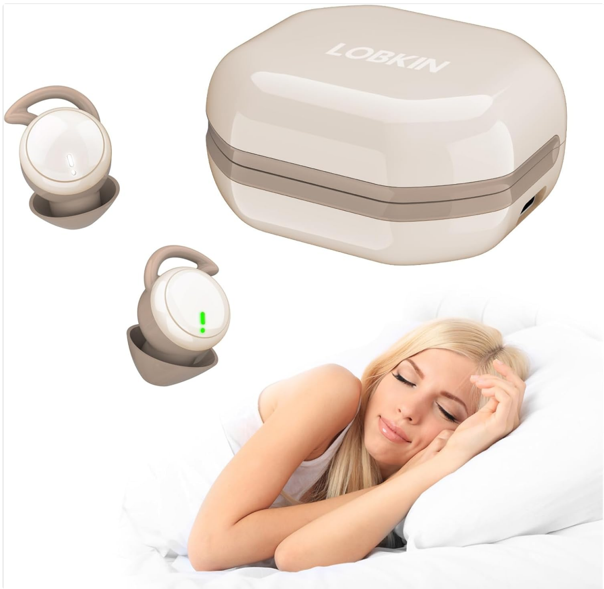
Image showing the LOBKIN S7 Sleep Earbuds, their charging case, and a person comfortably sleeping with the earbuds in place.