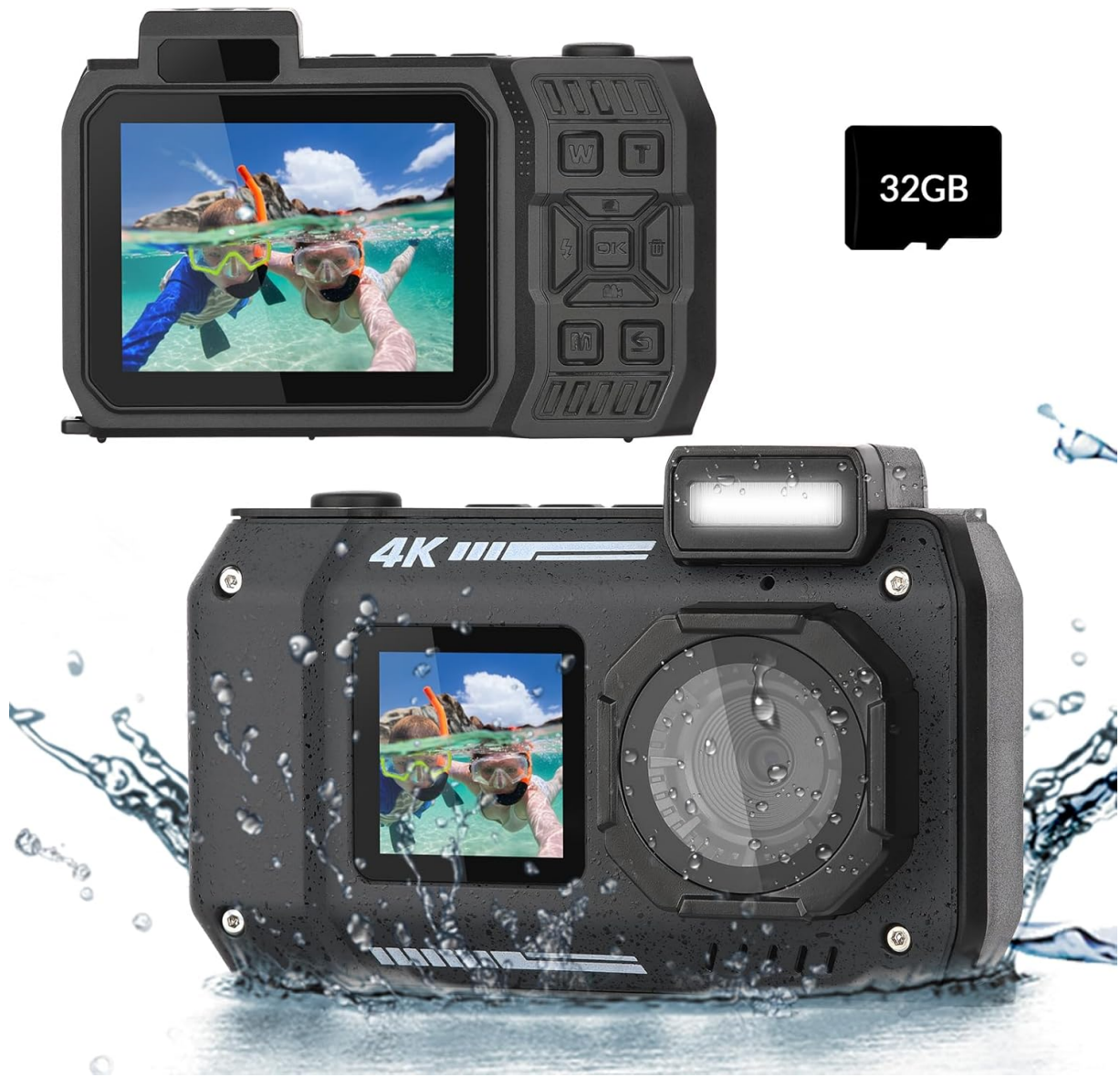
This image displays the Mafiti D50 Underwater Camera from both the front and rear perspectives. The front shows the lens, flash, and a small front screen, while the rear view highlights the larger main display and control buttons.