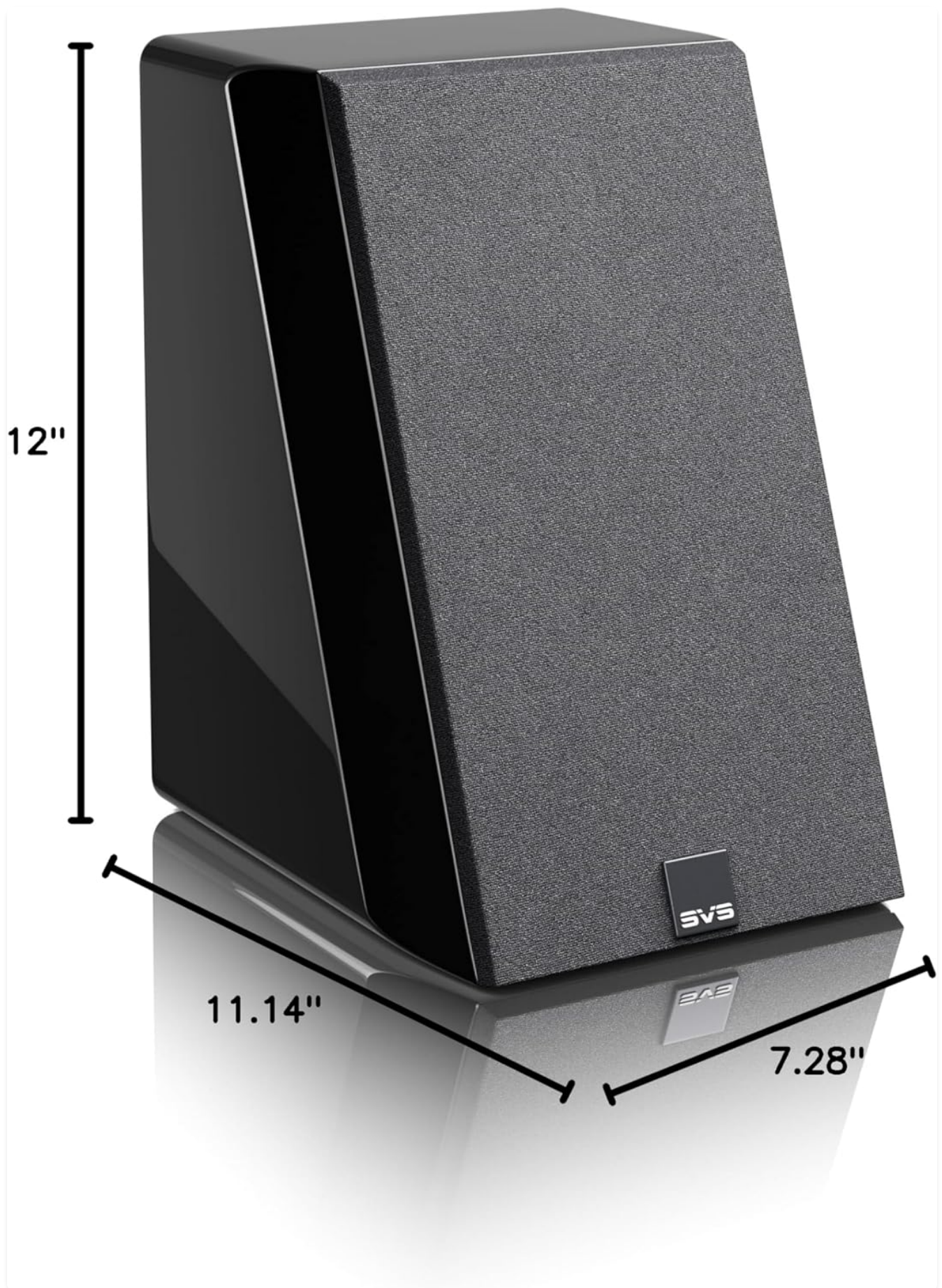
Figure 4: Dimensions of the SVS Ultra Elevation Surround Speaker.