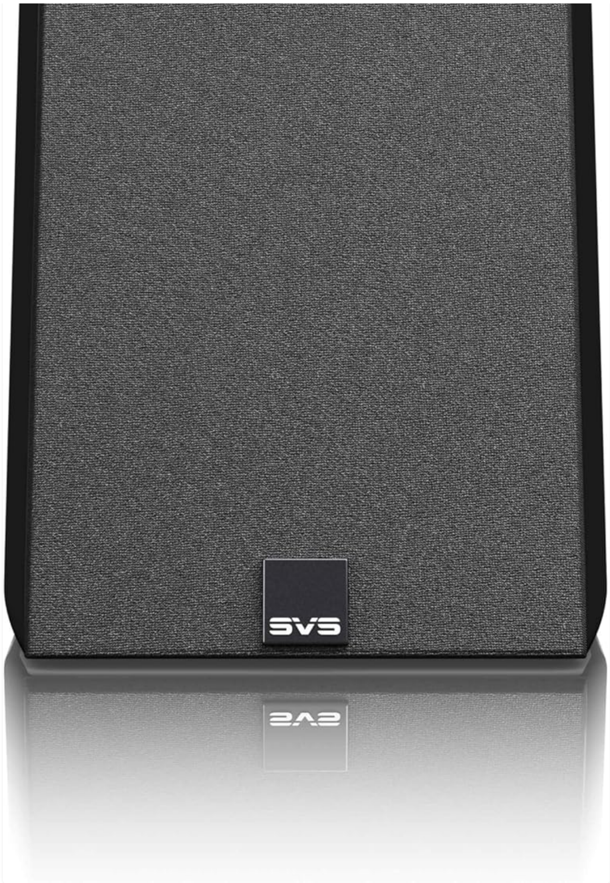
Figure 1: SVS Ultra Elevation Surround Speaker with magnetic grille attached.