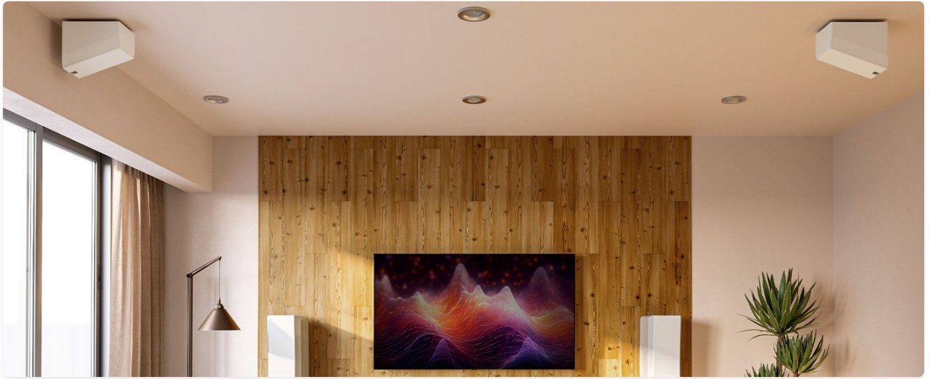
Figure 2: Example room setup with SVS Ultra Elevation speakers mounted for height effects.