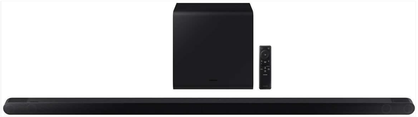
Image: The Samsung HW-S80CB/ZA soundbar, its wireless subwoofer, and the included remote control, all in black.