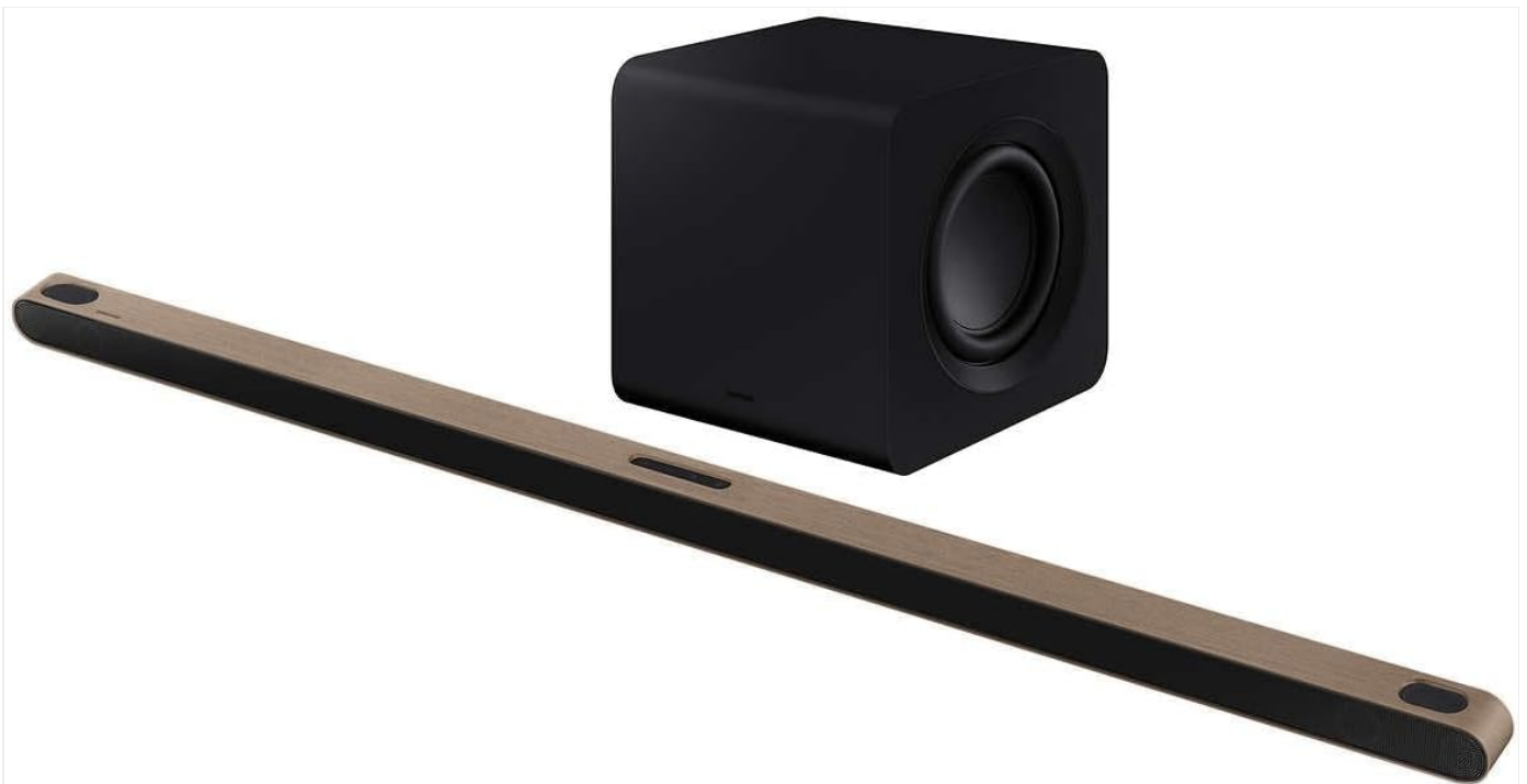
Image: The Samsung HW-S80CB/ZA slim soundbar with a teak-like trim and its accompanying wireless subwoofer.