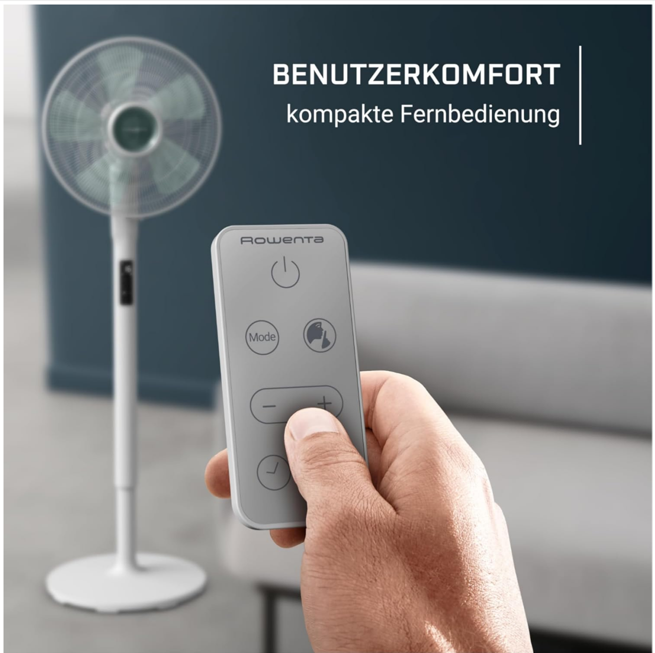
Image: A hand holding the compact remote control, highlighting user comfort and convenience.