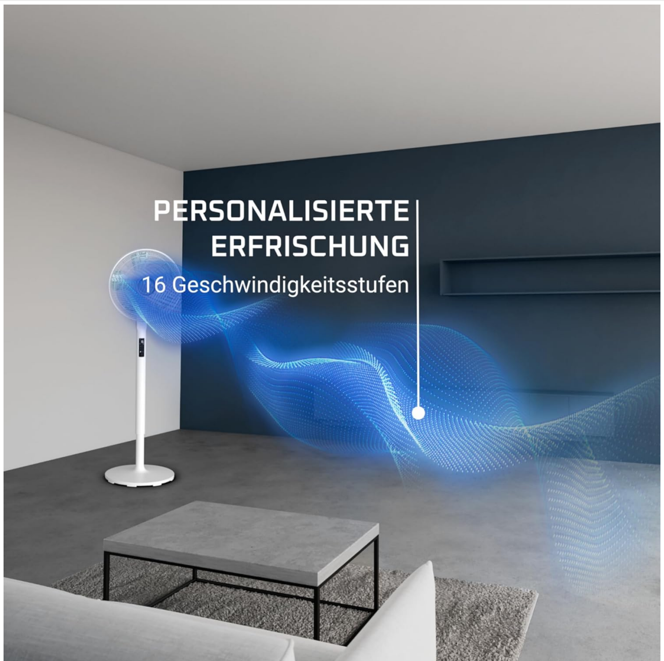
Image: The fan demonstrating personalized refreshment with its 16 speed levels.