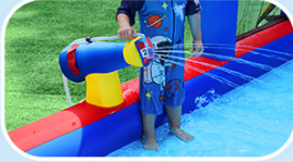
Water Cannon Add More Interaction and Refreshing fun