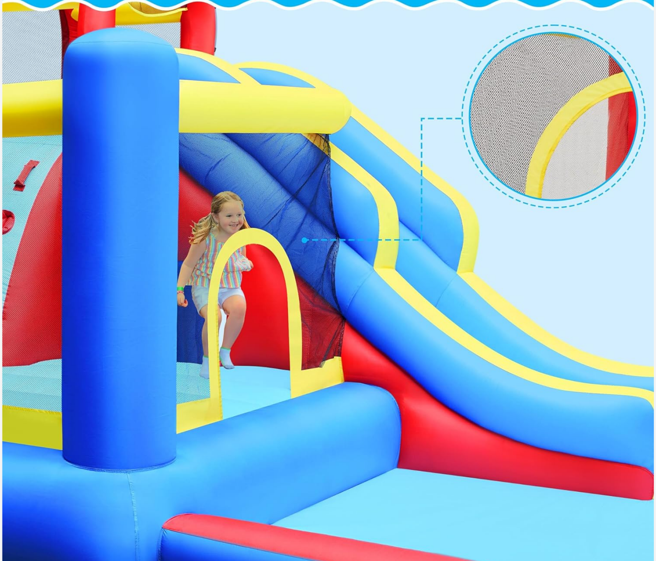
Image: Close-up of the safety mesh walls, ensuring a secure play environment.