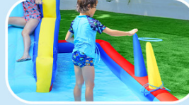
Ring Toss Game 6 Plastic Rings Included

Image: Detailed view of the various play features including the slide, climbing wall, and games.