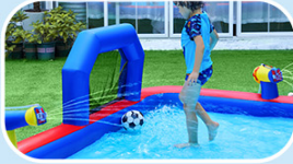
Soccer Goal 1 Soccer Ball Included