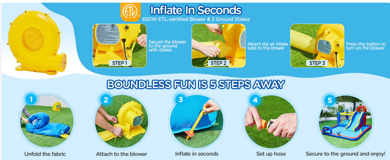
Image: Step-by-step guide for quick and easy setup.

Video: Official product video demonstrating the setup and features of the inflatable bounce house.