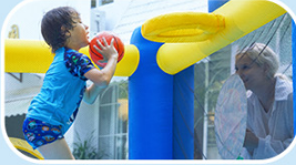
Basketball Hoop Split Hoop Design for Enhanced Safety