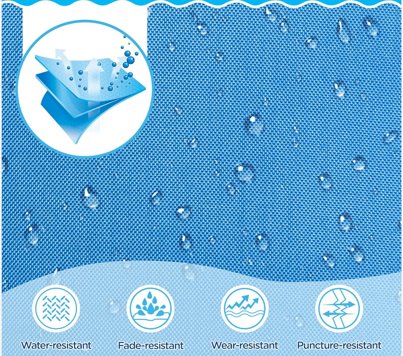
Image: Illustration highlighting the water-resistant, fade-resistant, wear-resistant, and puncture-resistant qualities of the fabric.