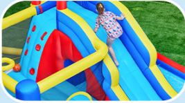
Long Slide For an Enjoyable and Thrilling Experience