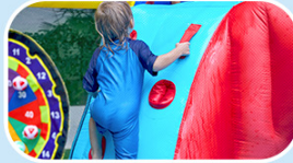
Climbing Area Encourages Physical Activity and Exercise