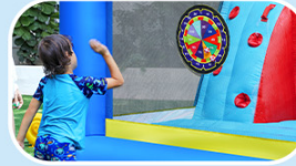
Dart Game 6 Hook & Loop Balls Included