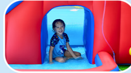
Tunnel Create a Diverse and Enjoyable Experience