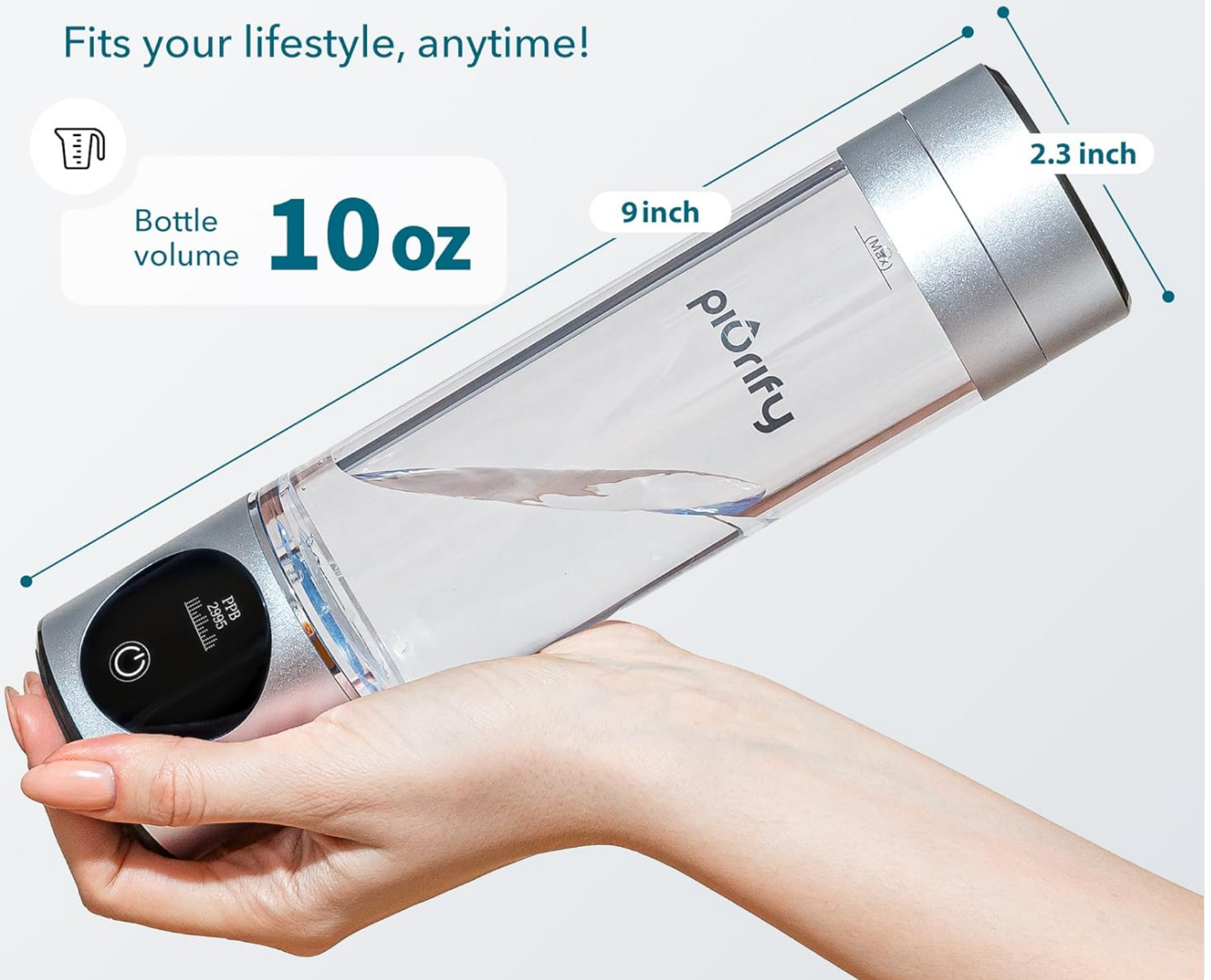
Image: Product dimensions and capacity.