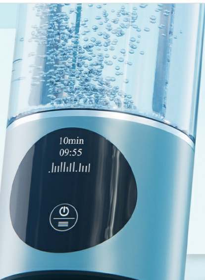
Image: SPE/PEM technology details, showing harmful byproduct expulsion.