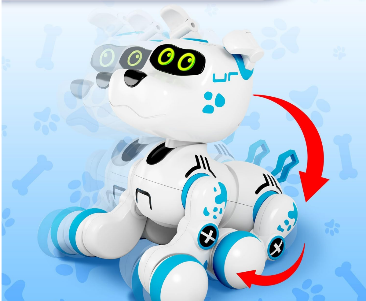
Image: The Xtrem Bots Bobby Robot Dog in a sitting position, demonstrating one of its interactive movements.