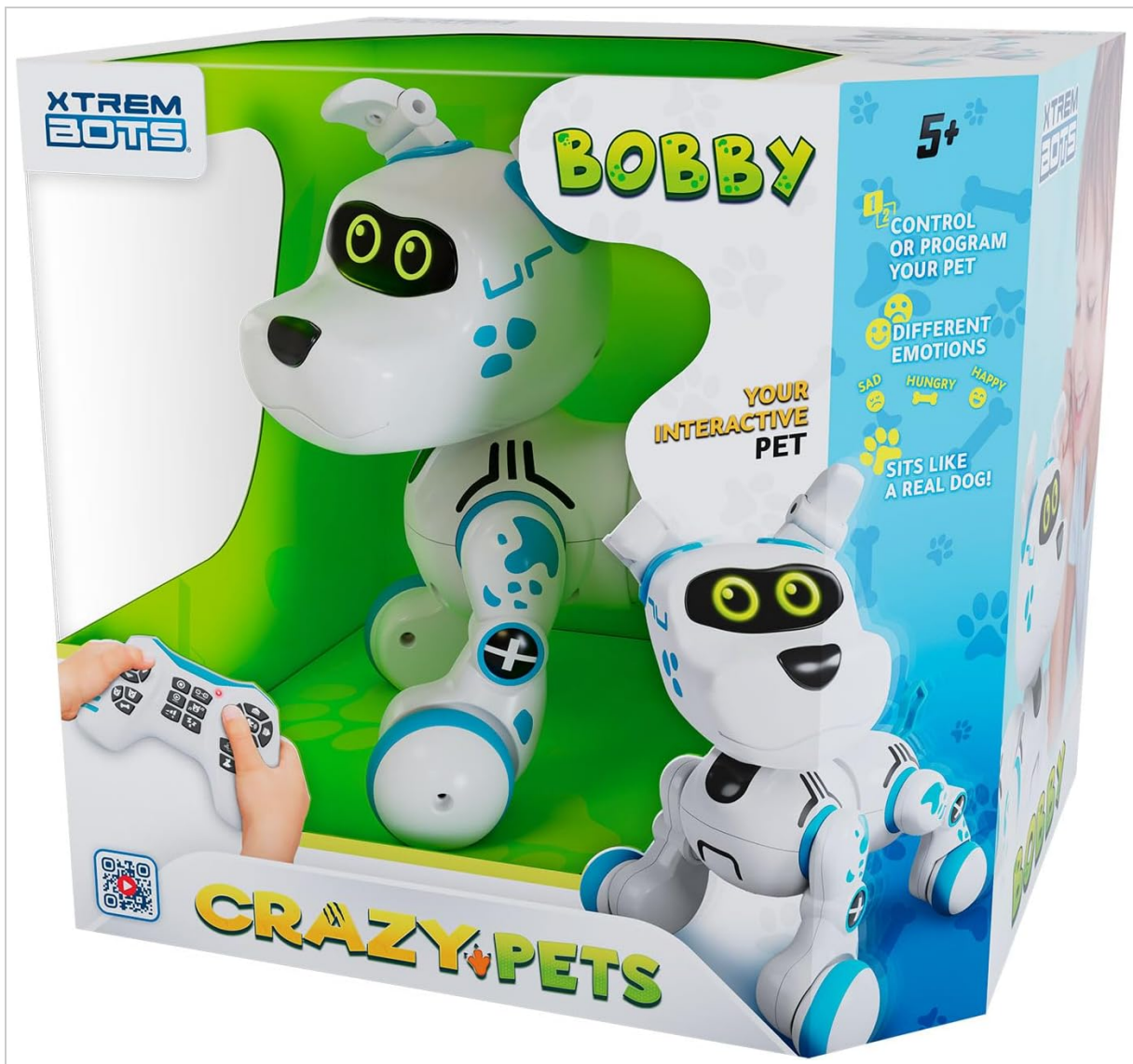
Image: The product box for Xtrem Bots Bobby Robot Dog, displaying the robot and its remote control.