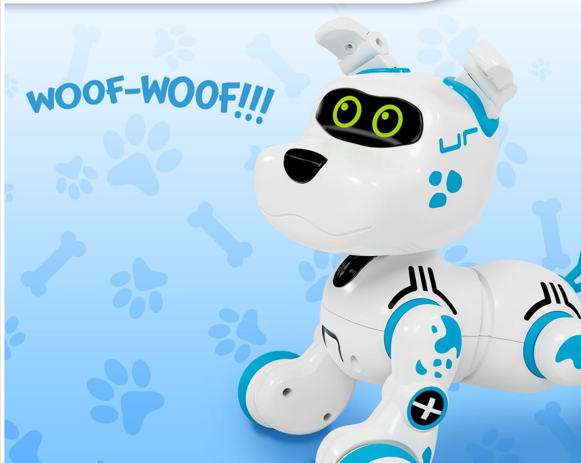
Image: The Xtrem Bots Bobby Robot Dog with a 'Woof-Woof' speech bubble, indicating its sound capabilities.