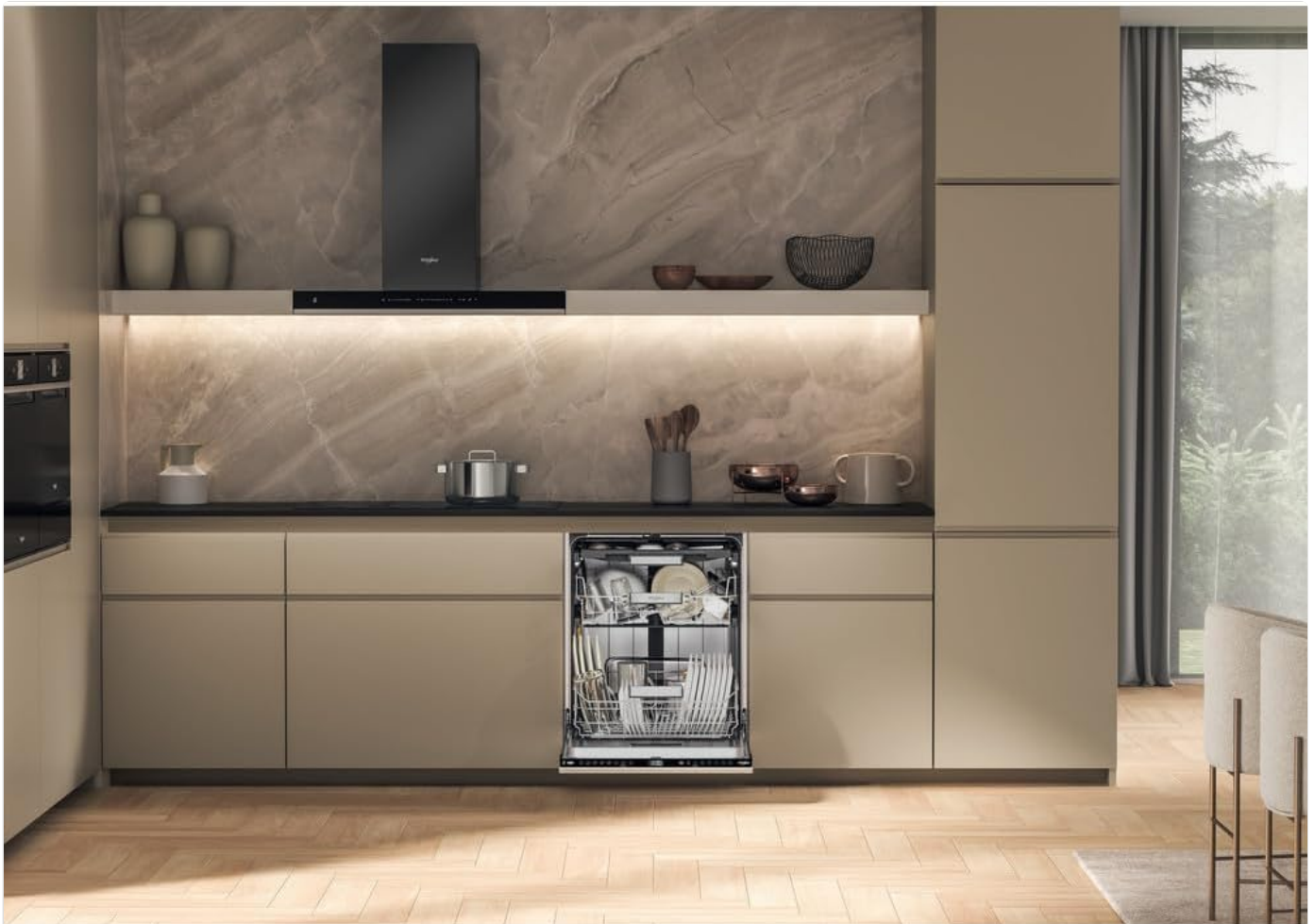
Figure 3.1: The Whirlpool W7I HF60 TU dishwasher seamlessly integrated into a kitchen setting, demonstrating its built-in design.

The dishwasher dimensions are approximately 55.5D x 59.8B x 82H centimeters. Ensure your cabinet opening meets these requirements. The appliance weighs approximately 37.5 kilograms.