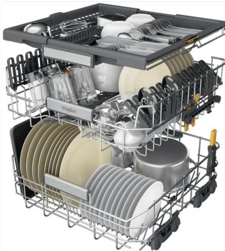
Figure 4.2: A detailed view of the dishwasher's top cutlery tray, designed for efficient cleaning of utensils.