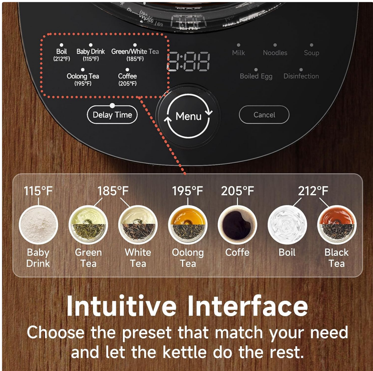
Image: The control panel displaying various temperature presets for different beverages.

The kettle features an intuitive control panel on the power base. Rotate the MENU knob to select your desired function. The display will show the current temperature or selected program.