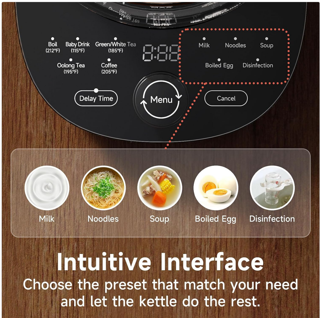
Image: The control panel displaying various food preparation functions such as Milk, Noodles, Soup, Boiled Egg, and Disinfection.