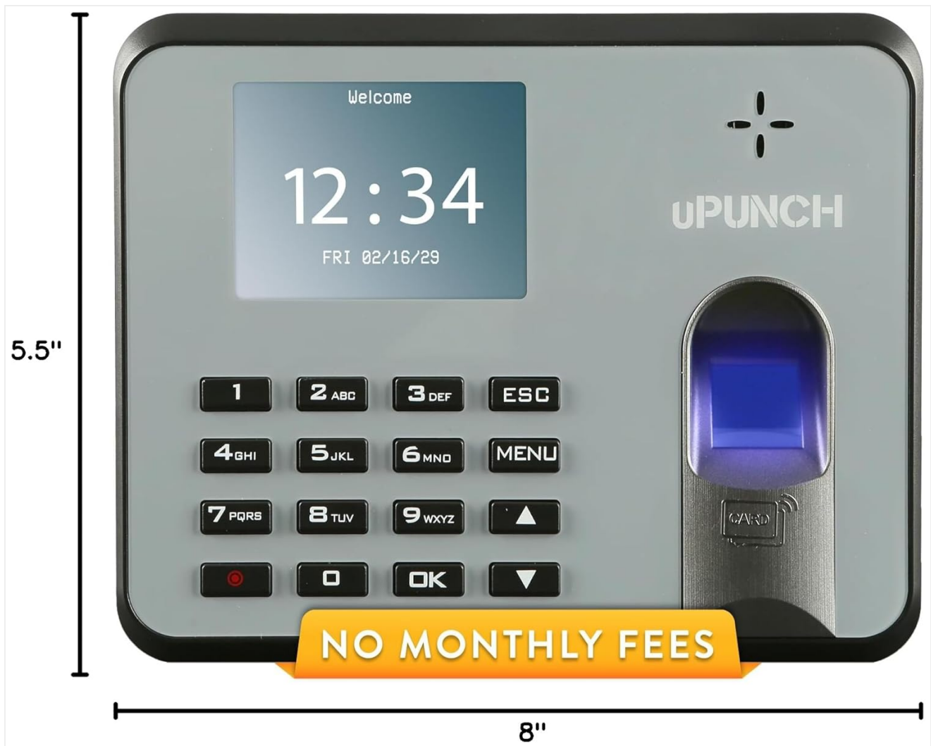
Figure 8: Approximate dimensions of the uPunch MK1000 time clock.