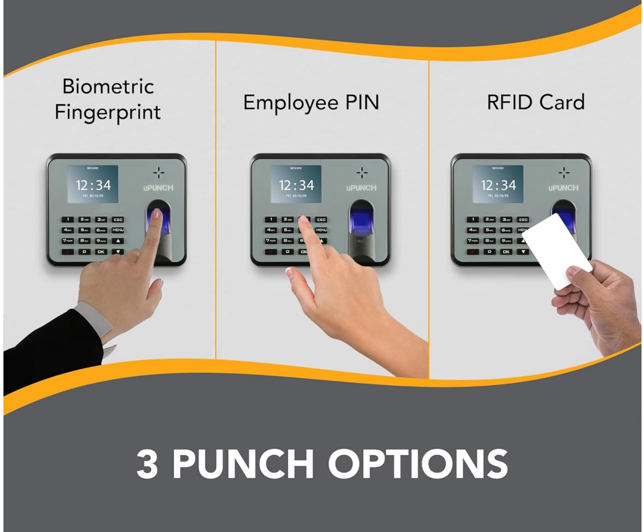
Figure 2: The uPunch MK1000 supports fingerprint, PIN, and RFID card authentication methods.