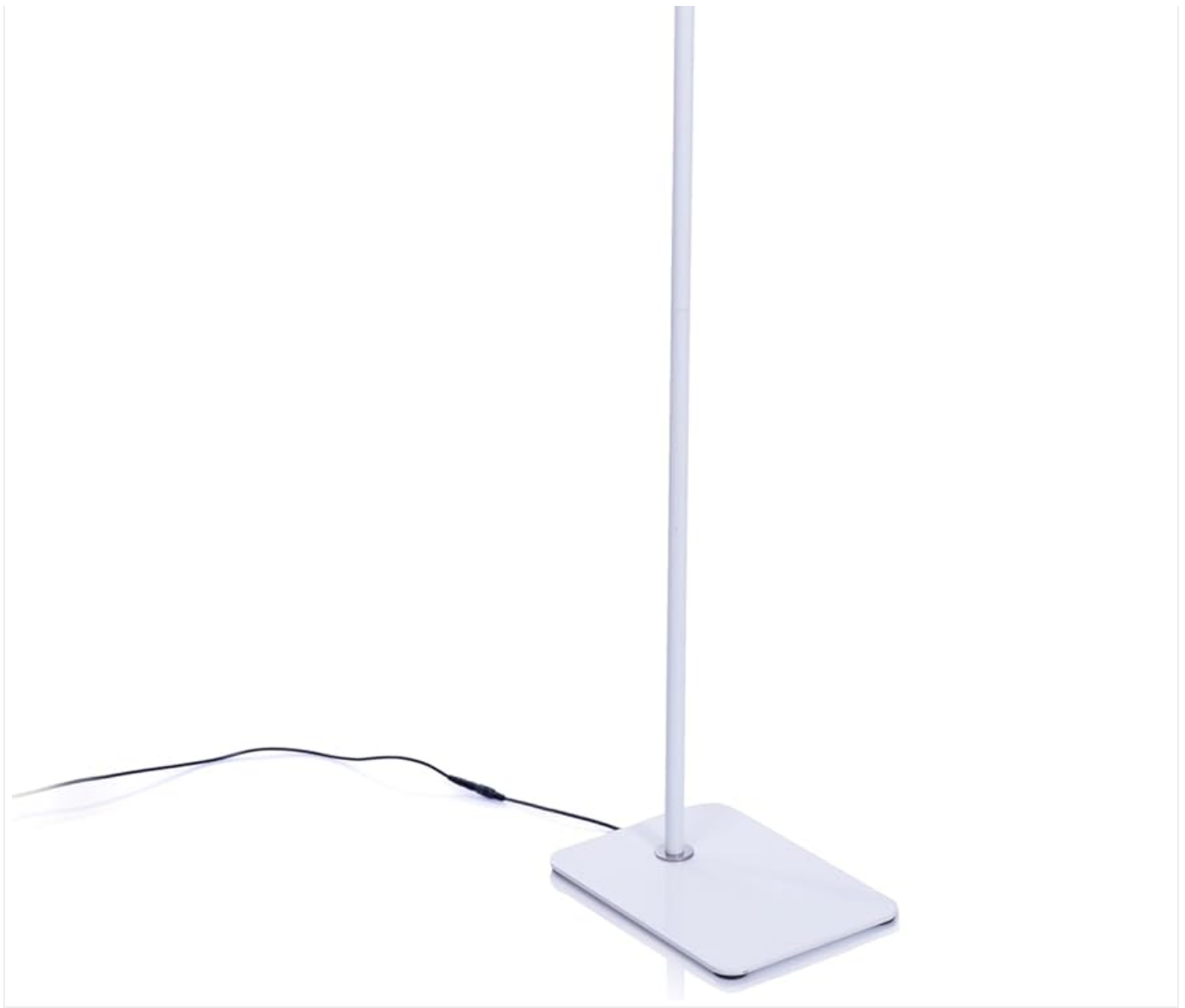
Figure 1: The daylight Uno Pro Floor Lamp.