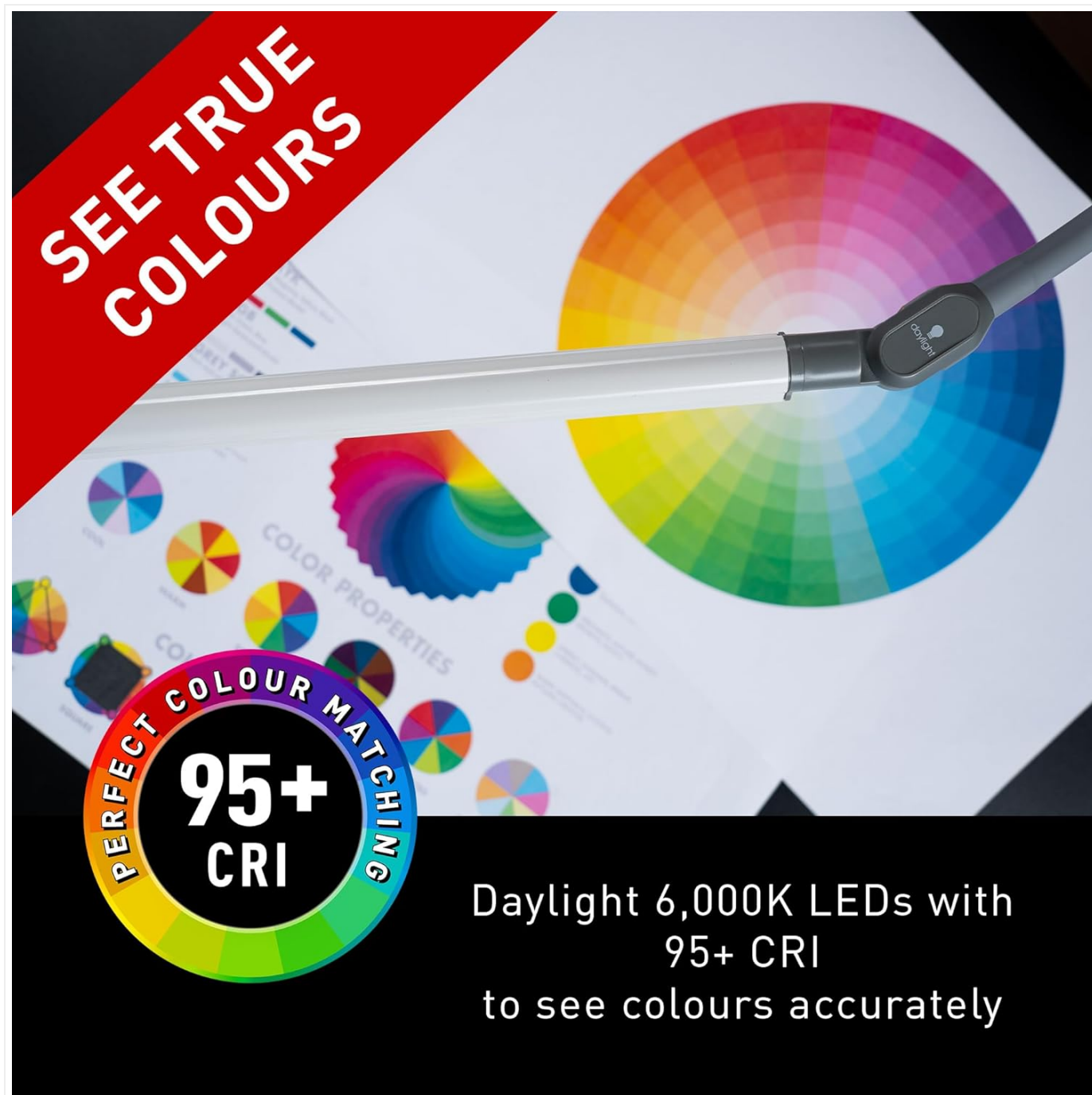
Figure 5: High Color Rendering Index (CRI) for accurate color perception.