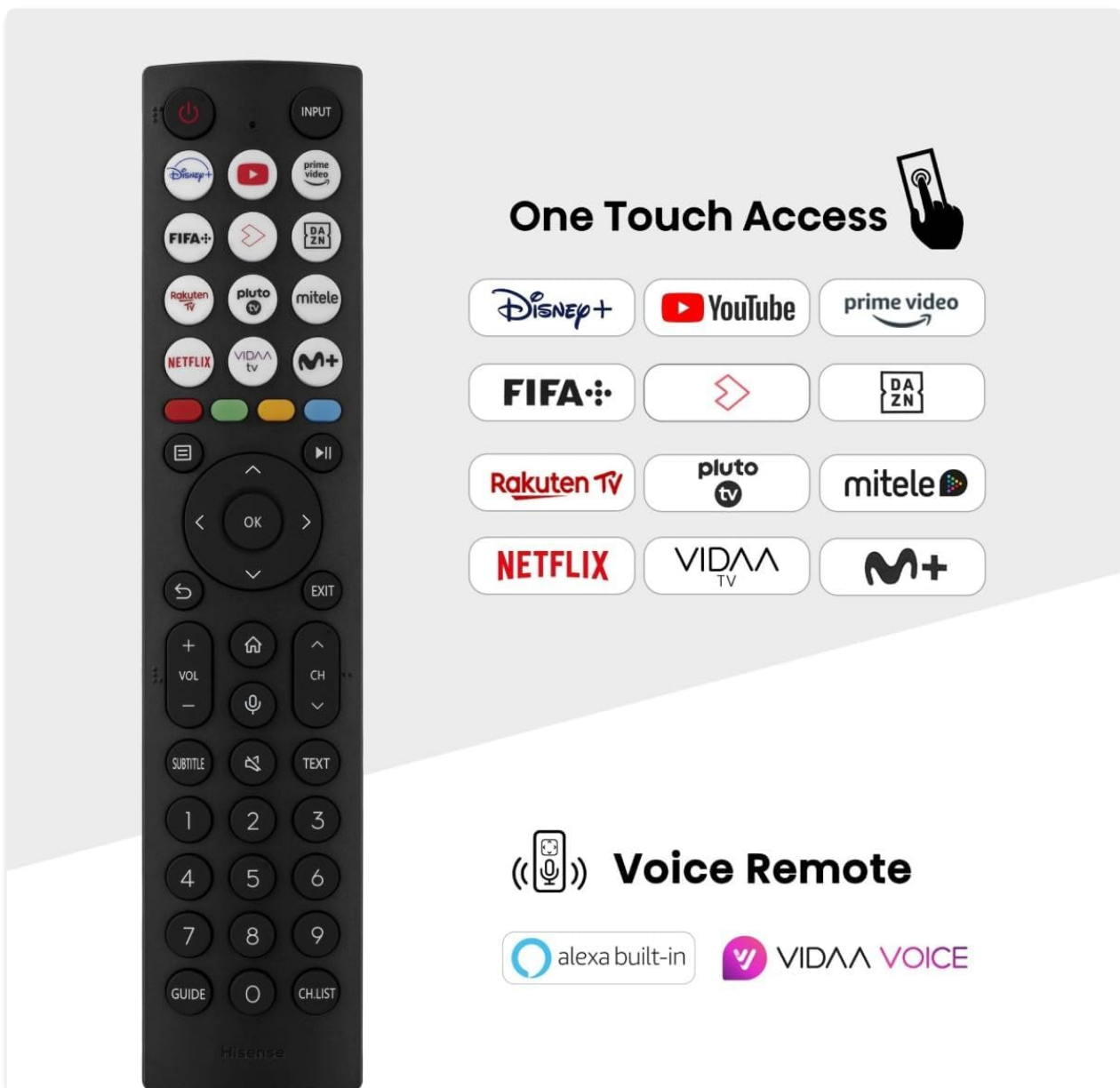
Image: The Hisense Smart TV remote control, highlighting dedicated buttons for popular streaming services like Disney+, YouTube, Prime Video, Netflix, and others. It also indicates voice control capabilities with Alexa built-in and VIDAA Voice.

The included remote control allows you to navigate the TV's features. Insert the provided batteries, ensuring correct polarity.