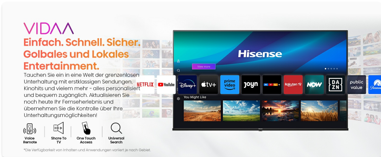
Image: A visual representation of the VIDAA Smart TV interface, displaying a variety of application icons for streaming services and other content, emphasizing its simple, fast, and secure global and local entertainment options.

and streaming services. Use the Home button on your remote to access the smart TV interface.