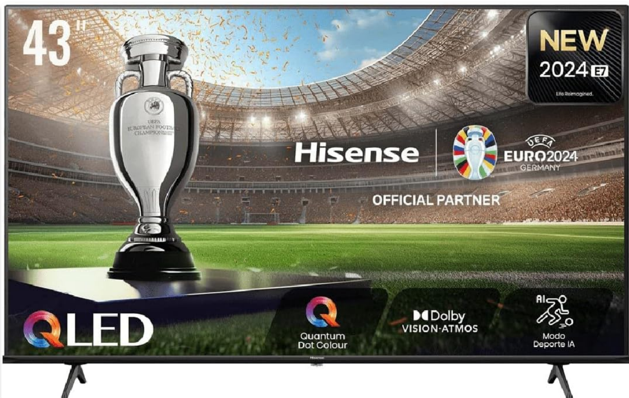
Image: Front view of the Hisense 43E7NQ QLED Smart TV, showcasing its display and slim bezels.

This manual provides essential information for setting up, operating, and maintaining your Hisense 43E7NQ QLED Smart TV. Please read these instructions carefully before using your television and retain them for future reference.