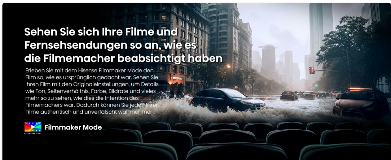
Image: A scene depicting a flooded street with cars, viewed from a cinema audience perspective, illustrating the Filmmaker Mode feature which ensures content is displayed as originally intended by the creators.