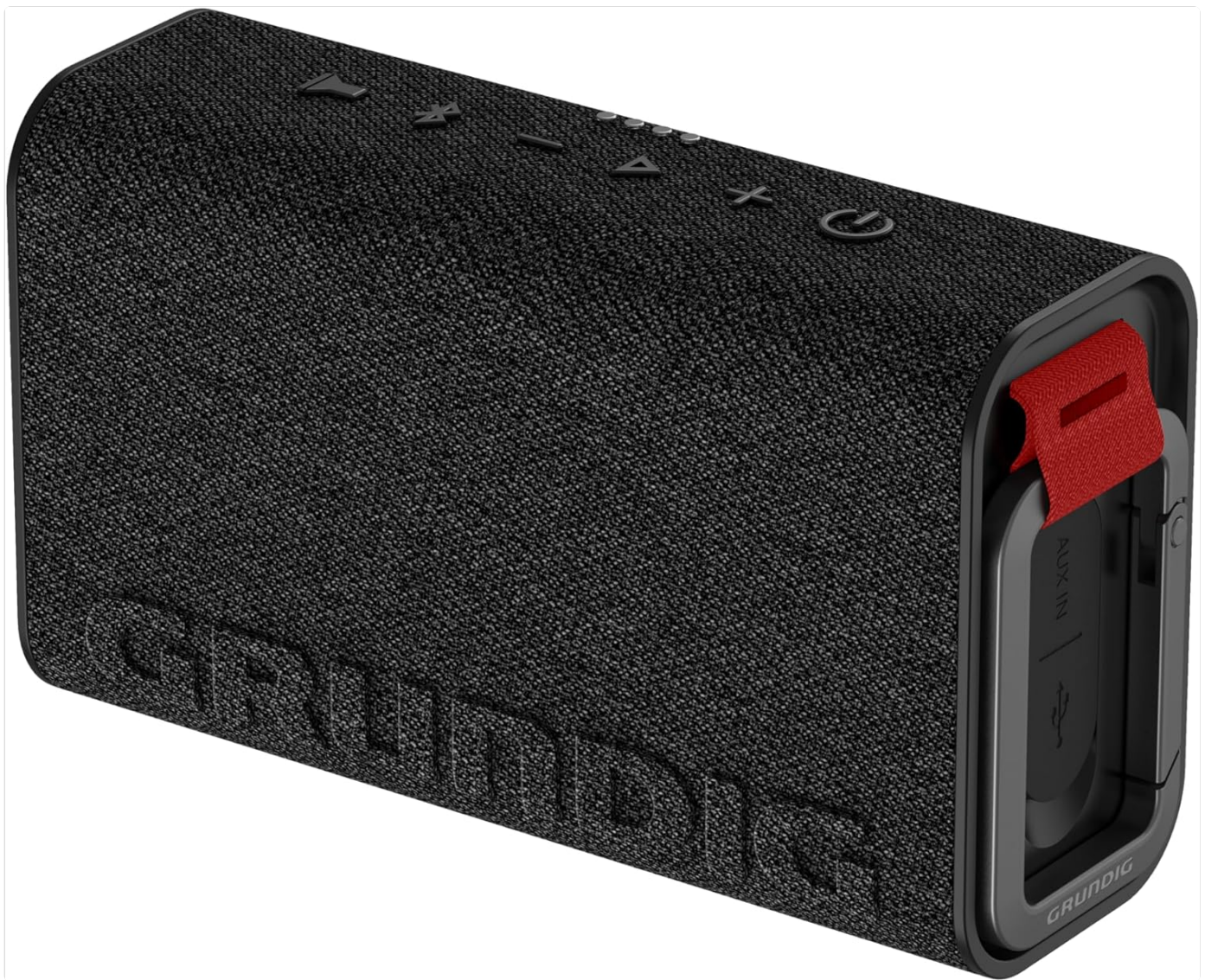
Image: The Grundig Xplore Bluetooth Speaker in black, highlighting its robust, portable design.