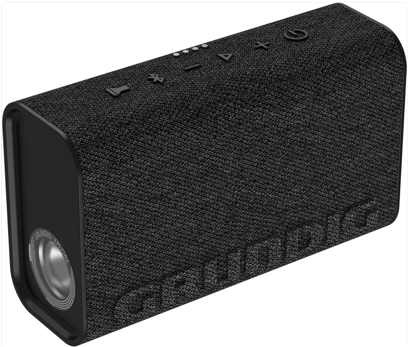
Image: The charging and AUX-in ports located on the side of the speaker, protected by a waterproof flap.