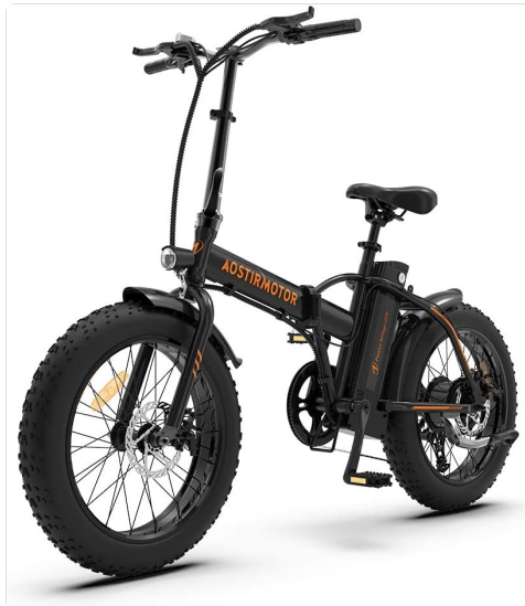
Image: Front view of the Aostirmotor A20 electric bike, highlighting the fat tire and front fork.