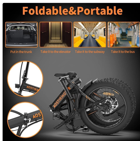
Image: The Aostirmotor A20 electric bike in its folded configuration, demonstrating its compact size for transport in a car trunk, elevator, or public transport.

The bike features a foldable design, reducing its size by over half for easy storage and transport. The folded size is approximately 35.4 x 27.6 inches.