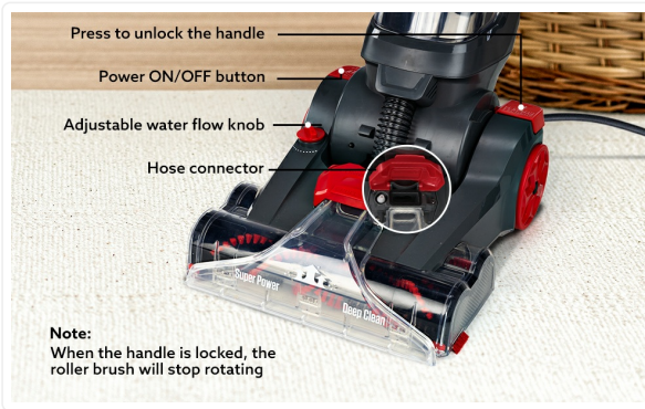
Figure 3: Base Controls: Handle Unlock, Power ON/OFF, Adjustable Water Flow Knob, Hose Connector.