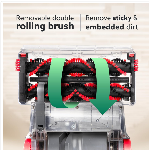
Figure 4: Removable Double Rolling Brush for deep cleaning and easy maintenance.