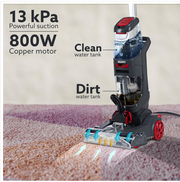
Figure 2: Clean Water Tank (2.6L) and Dirty Water Tank (1.3L)