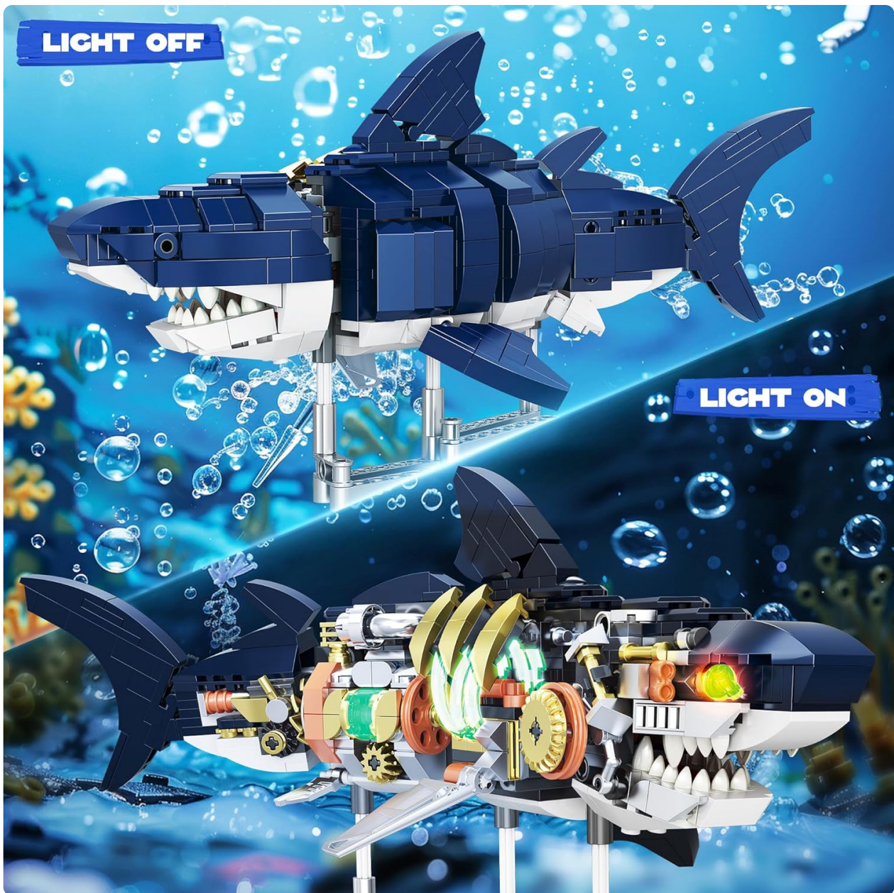
Image: Two views of the mechanical shark, one with its internal lights off and another with the lights illuminated, showcasing the visual effect.

Video: A demonstration of the Jorumo Mechanical Shark's features, including its realistic design, internal lighting, and the movement of its fins and tail when the base handle is turned.