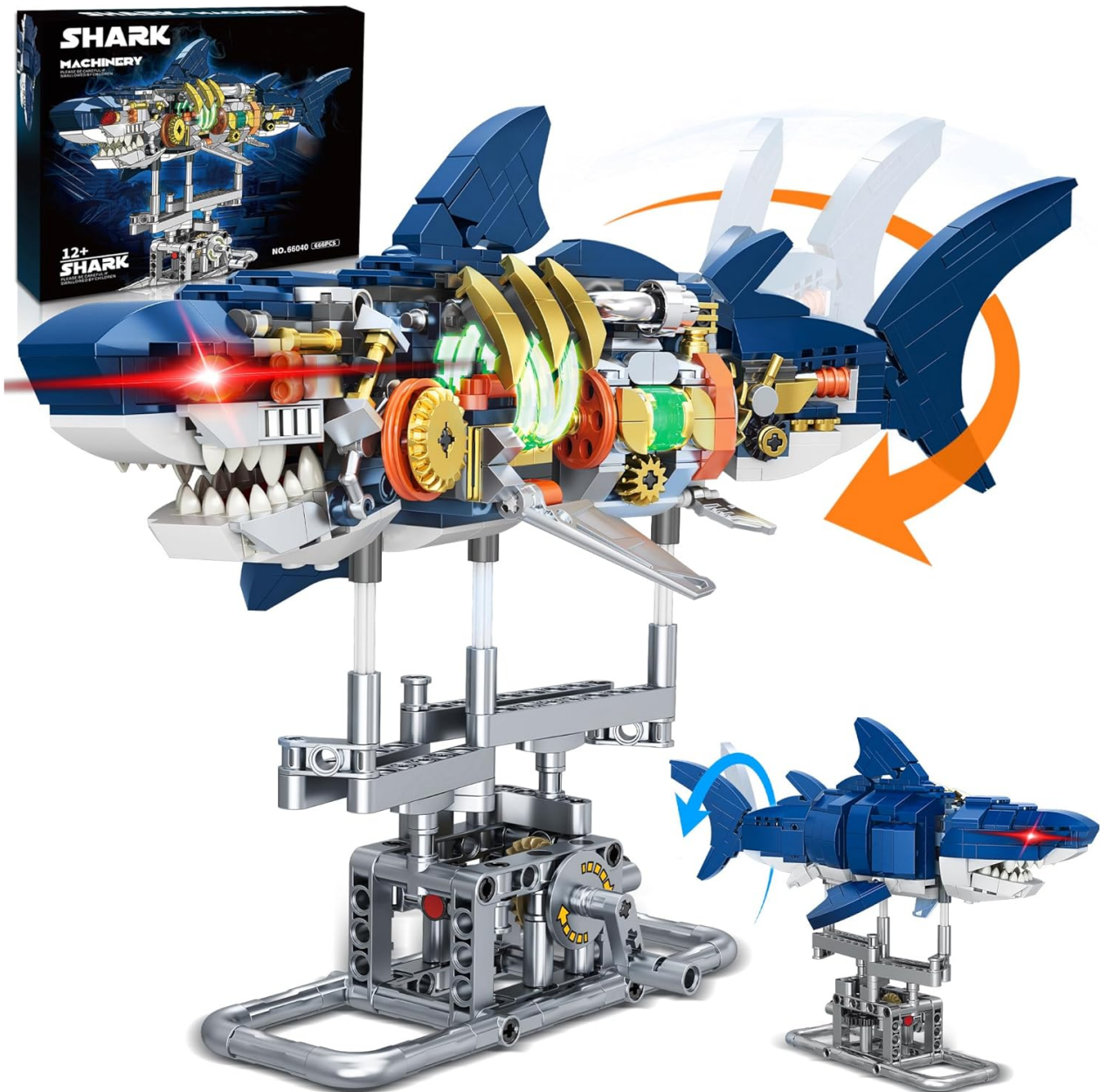
Image: The fully assembled Jorumo Mechanical Shark Building Block Set, showcasing its intricate internal mechanisms and illuminated features, displayed on its stand.