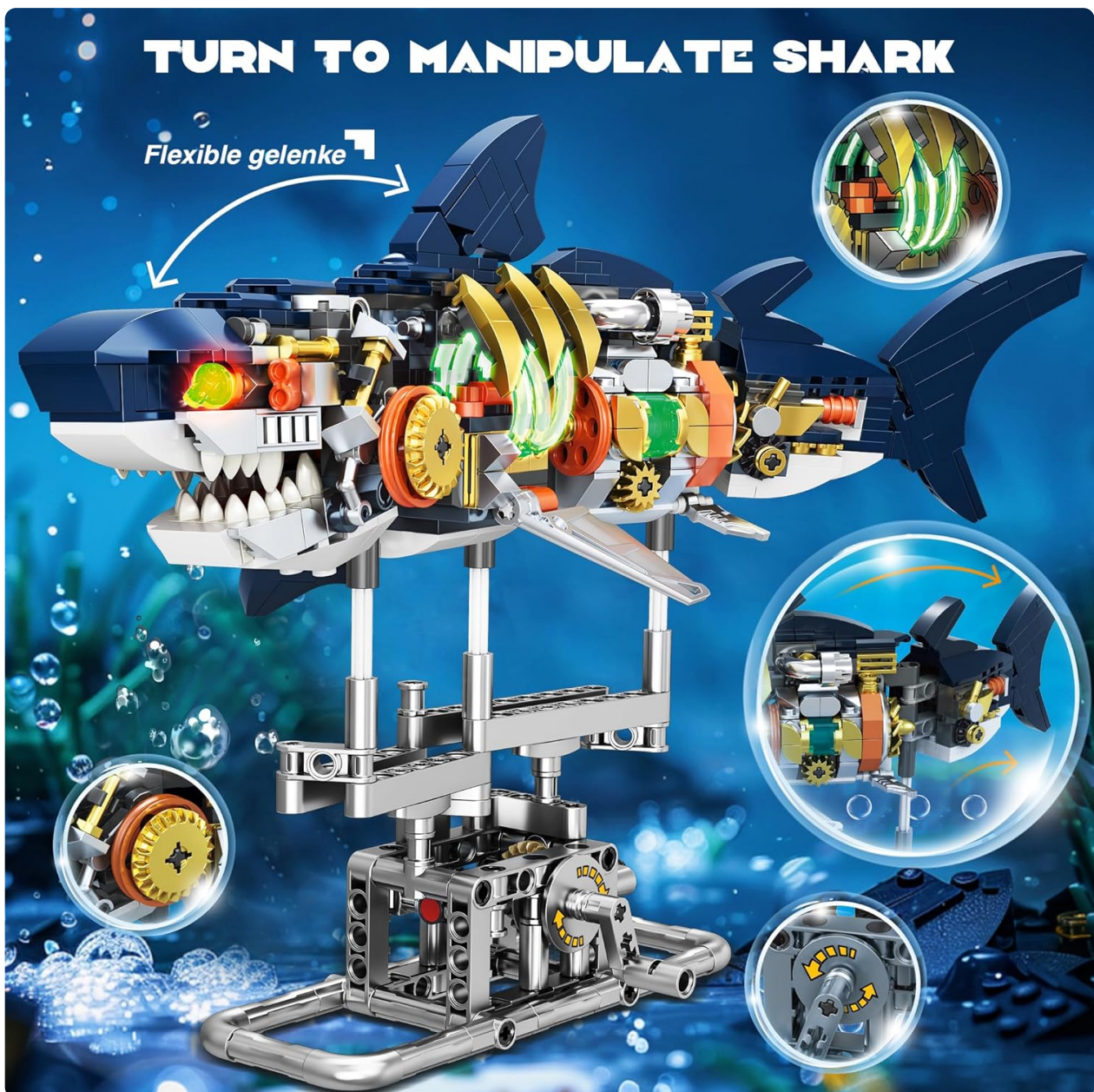
Image: The mechanical shark model on its display stand, highlighting the rotatable components and internal gears that enable its movement.