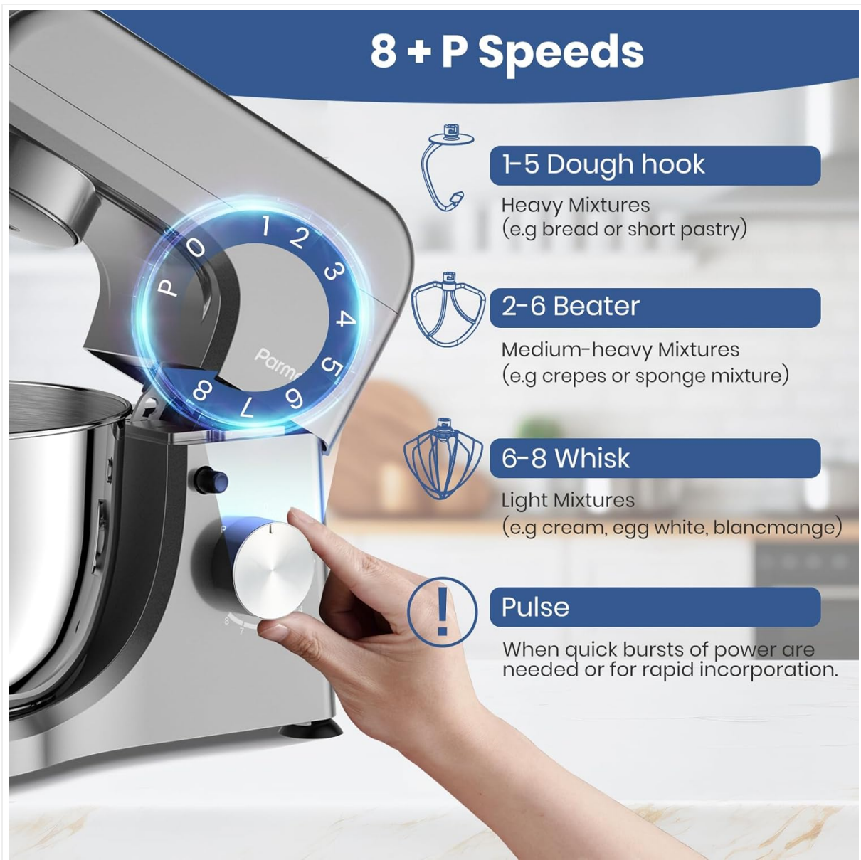
Figure 5: Speed settings and recommended uses for each attachment.