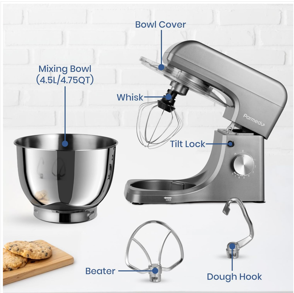
Figure 2: Labeled components of the Parmedu BK043 Stand Mixer for easy identification.