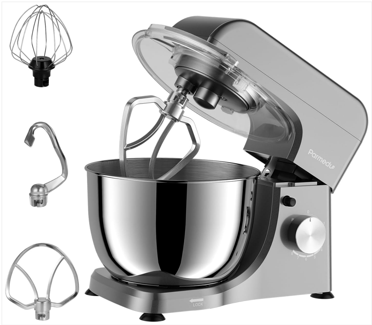
Figure 1: Parmedu BK043 Electric Kitchen Stand Mixer with its main components and attachments.