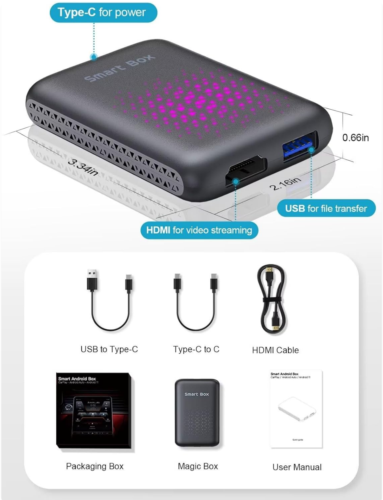
Figure 2.1: Included components of the CarPlay AI Box 2.0.