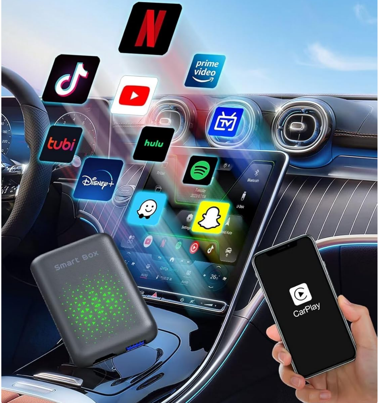
Figure 4.2: Enhance your driving experience with integrated streaming apps.