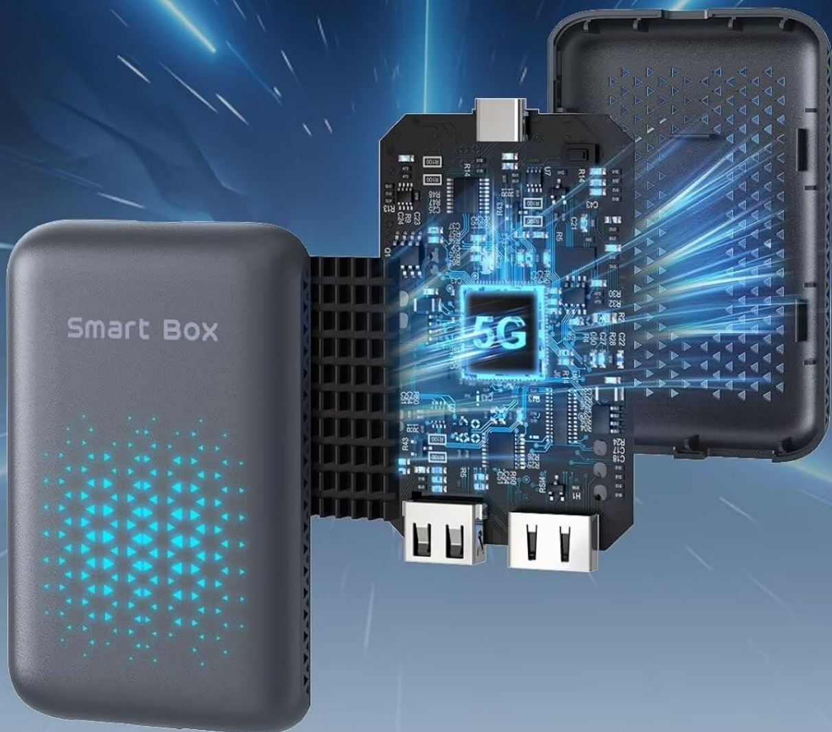
Figure 7.1: The device features a 4-core smart chip for excellent performance.