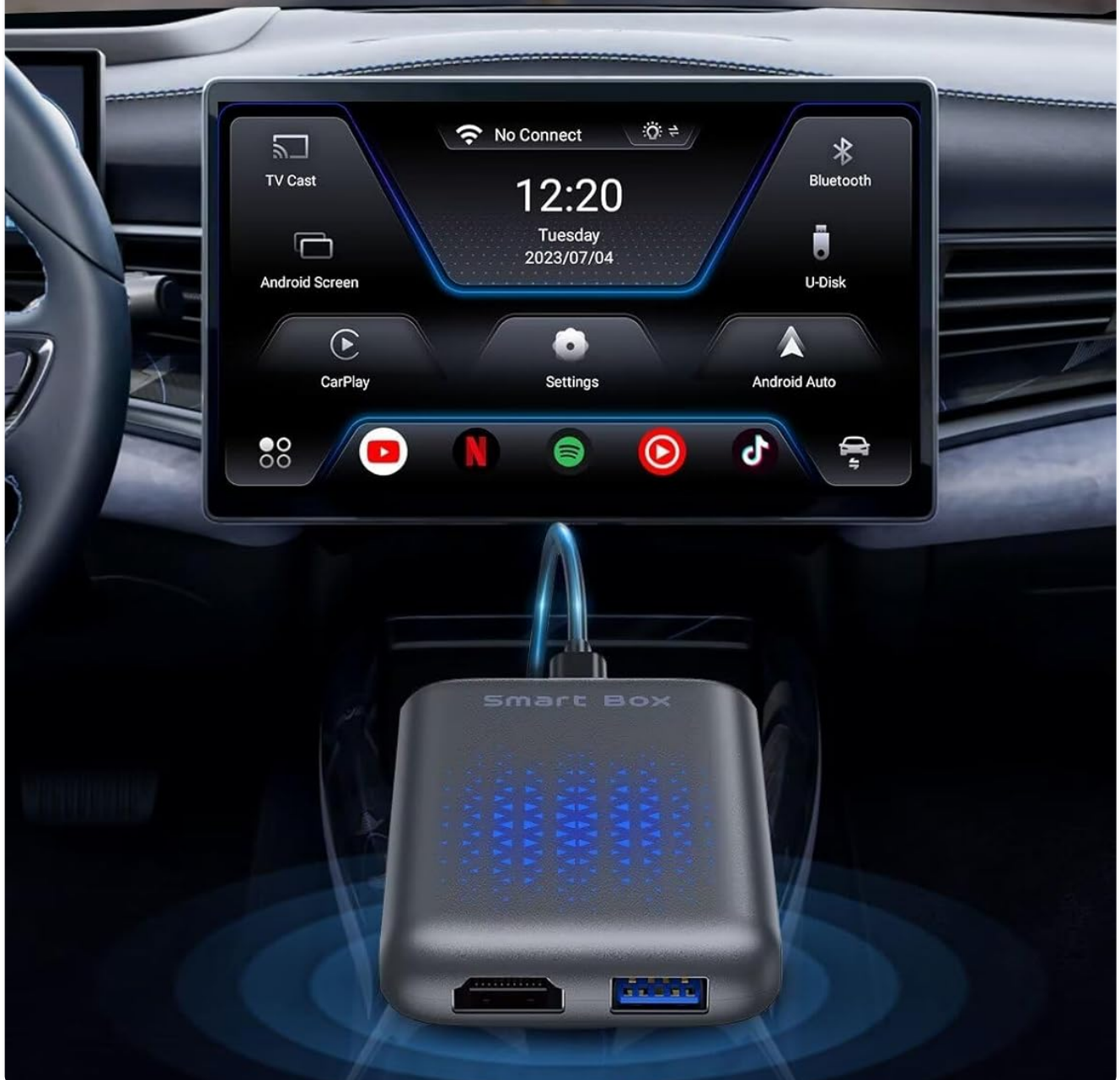
Figure 3.1: CarPlay AI Box 2.0 connected and displaying its main interface on a car's screen.