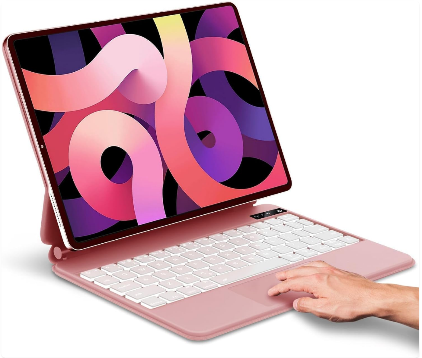
Image: A pink FOGARI keyboard case with an iPad attached, showing a hand interacting with the multi-touch trackpad. The iPad screen displays a colorful abstract wallpaper.