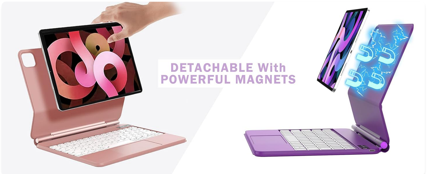
Image: The keyboard case in purple, showing the iPad magnetically attached and floating above the keyboard, illustrating the cantilever stand design. This image highlights the side profile and the mechanism of the stand.

The keyboard case features a unique floating cantilever stand design, allowing your iPad to magnetically attach and float above the keyboard. This design provides a stable and adjustable viewing experience.