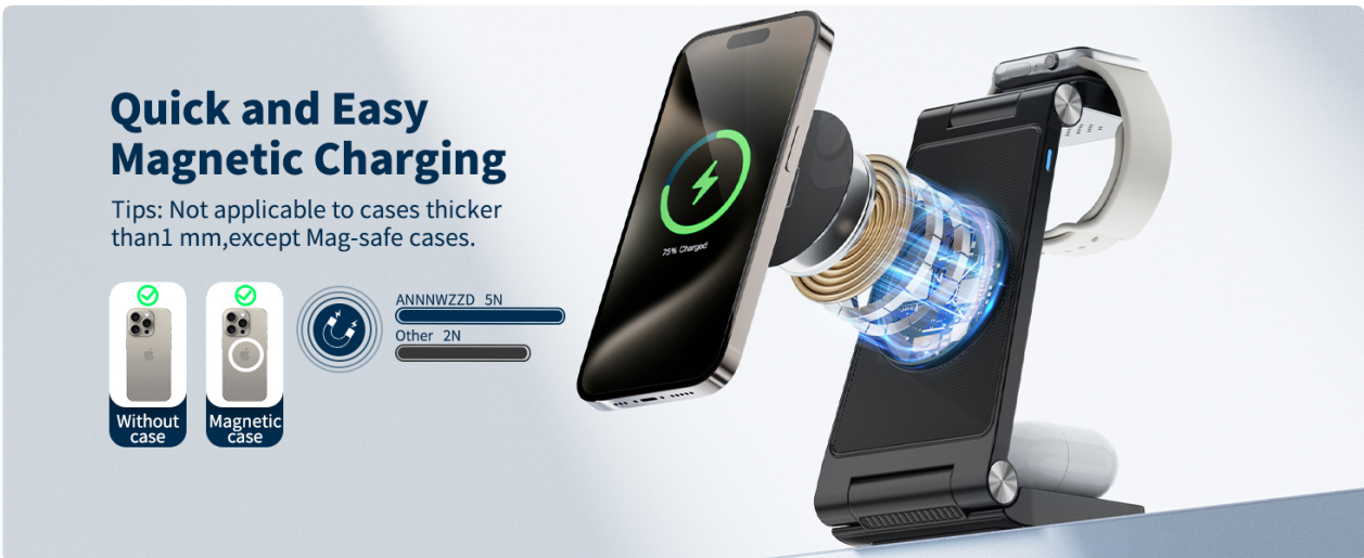
Image 2: The charging station supports multiple device orientations.