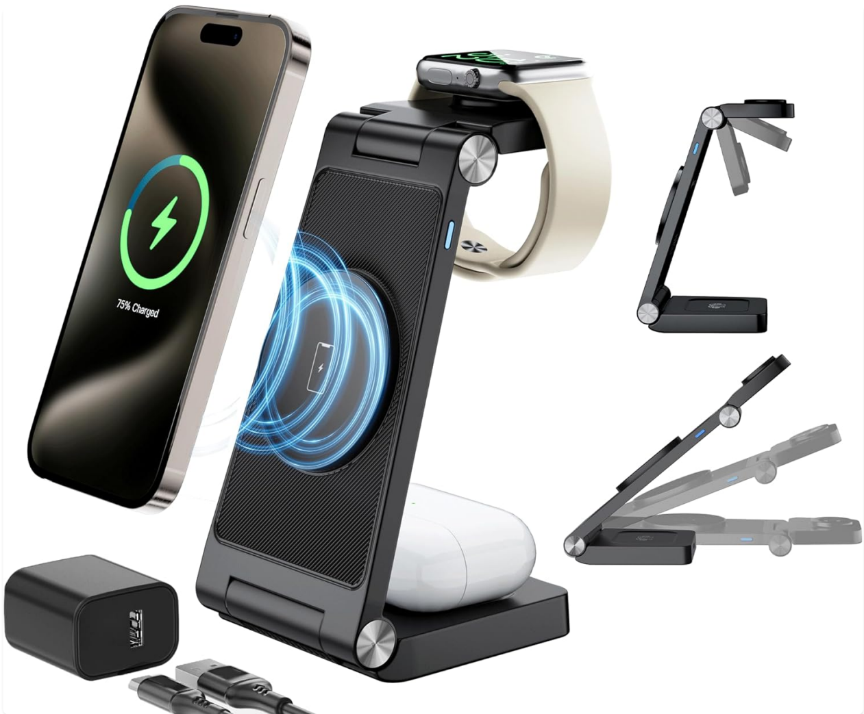
Image 1: ANNNWZZD 3-in-1 Magnetic Wireless Charging Station in use.