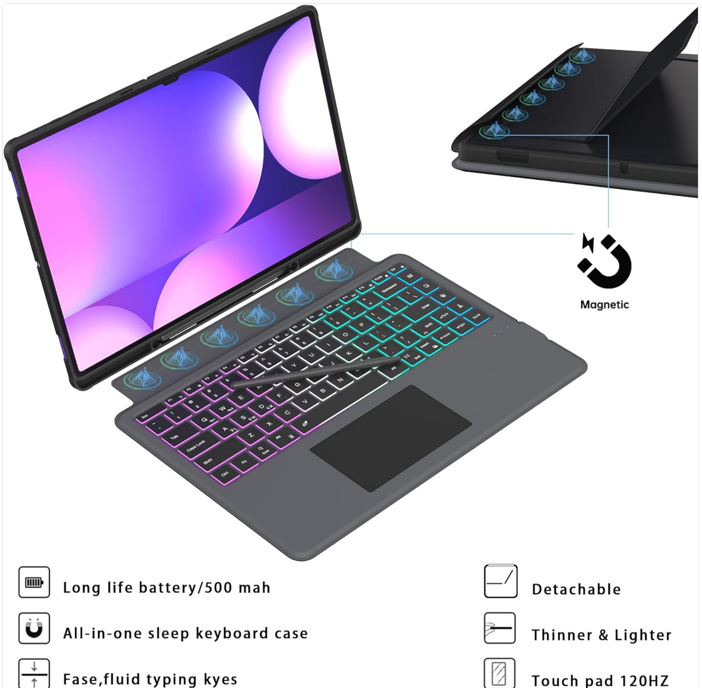
Image: An exploded view diagram illustrating how the keyboard magnetically attaches to the tablet case. Key features such as long battery life (500 mAh), detachable design, thinner and lighter profile, fluid typing keys, and a 120Hz touchpad are highlighted.