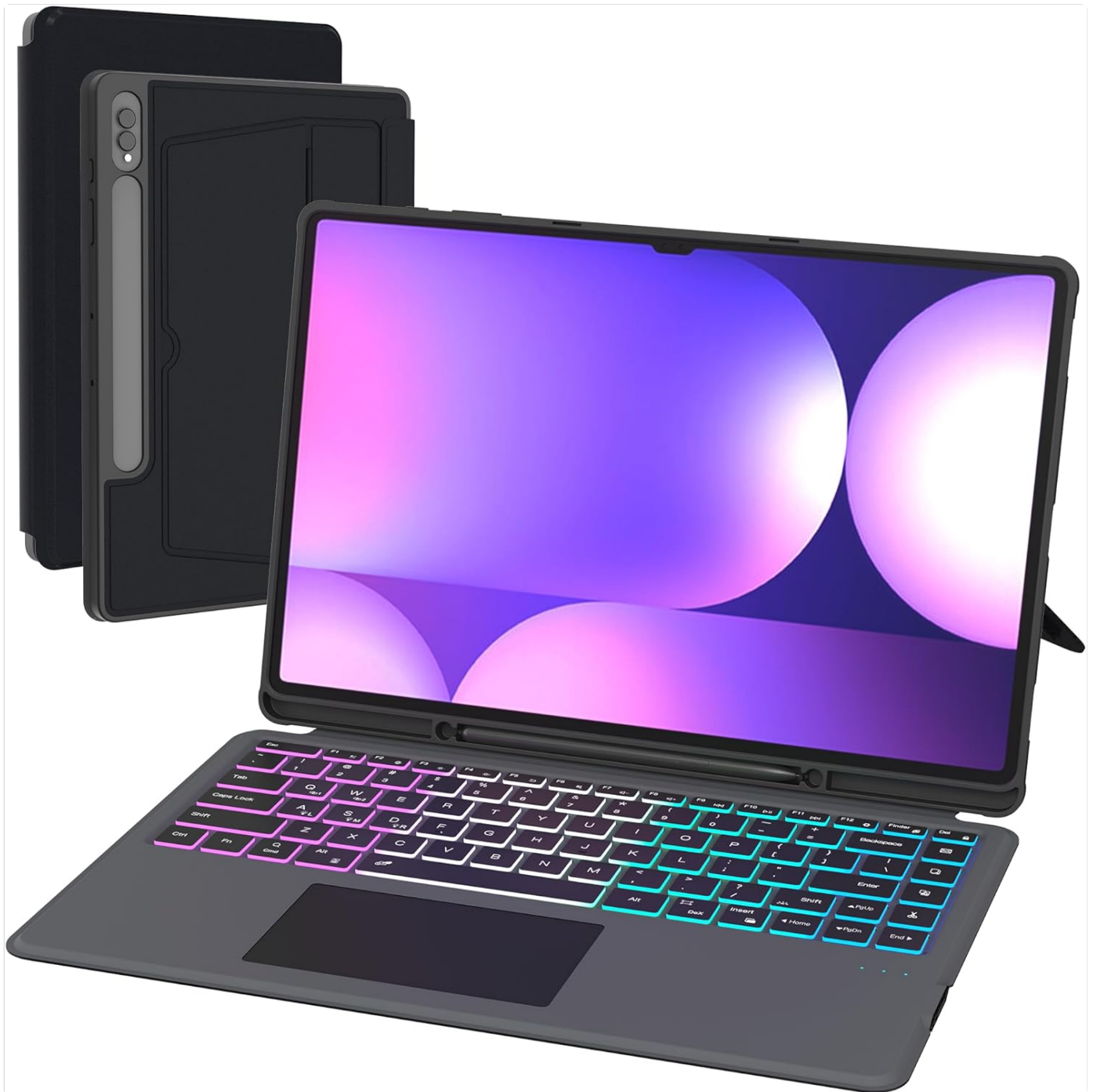
Image: The SNOODU Keyboard Case with a tablet inserted, displaying the illuminated keys and integrated trackpad. The case is open, showing the tablet in a propped-up position, ready for use.