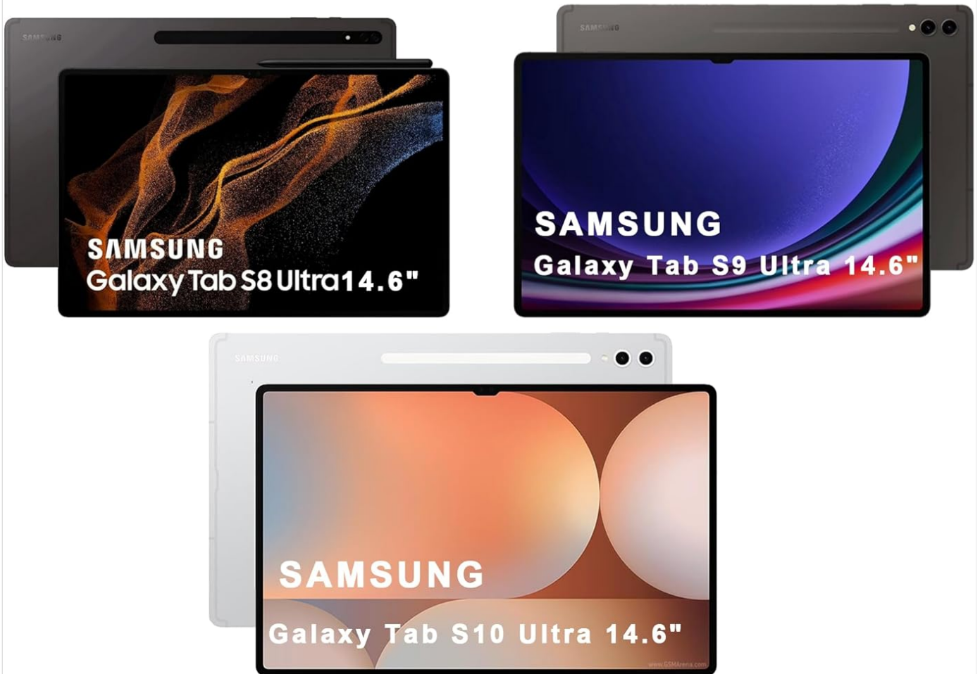
Image: A visual guide indicating compatibility with Samsung Galaxy Tab S8 Ultra 14.6", S9 Ultra 14.6", and S10 Ultra 14.6" models. A large exclamation mark highlights the compatibility notice.