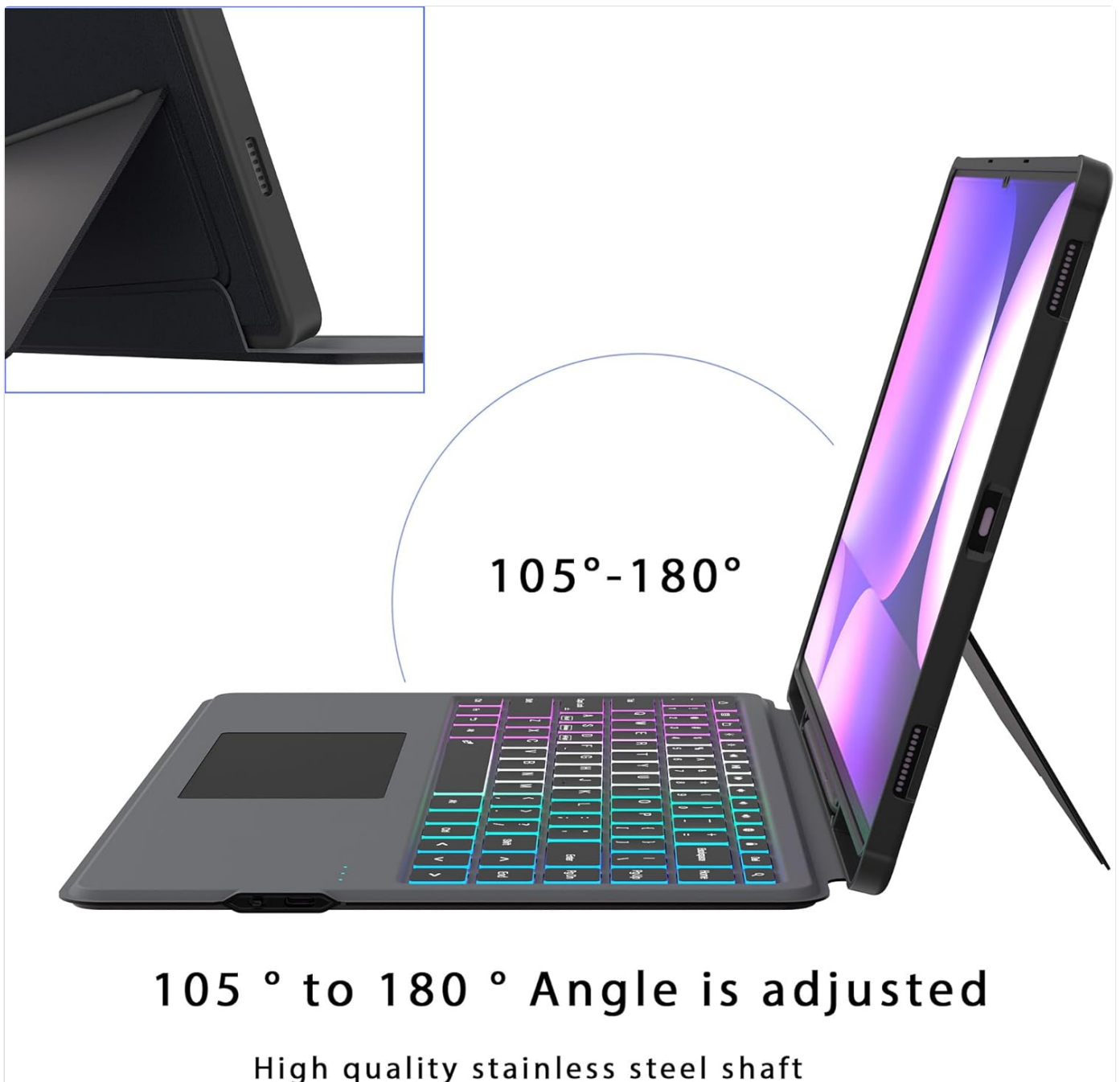
Image: A side profile of the keyboard case with the tablet, illustrating the adjustable kickstand that allows for viewing angles between 105 and 180 degrees. This flexibility supports various activities like typing, watching, and drawing.