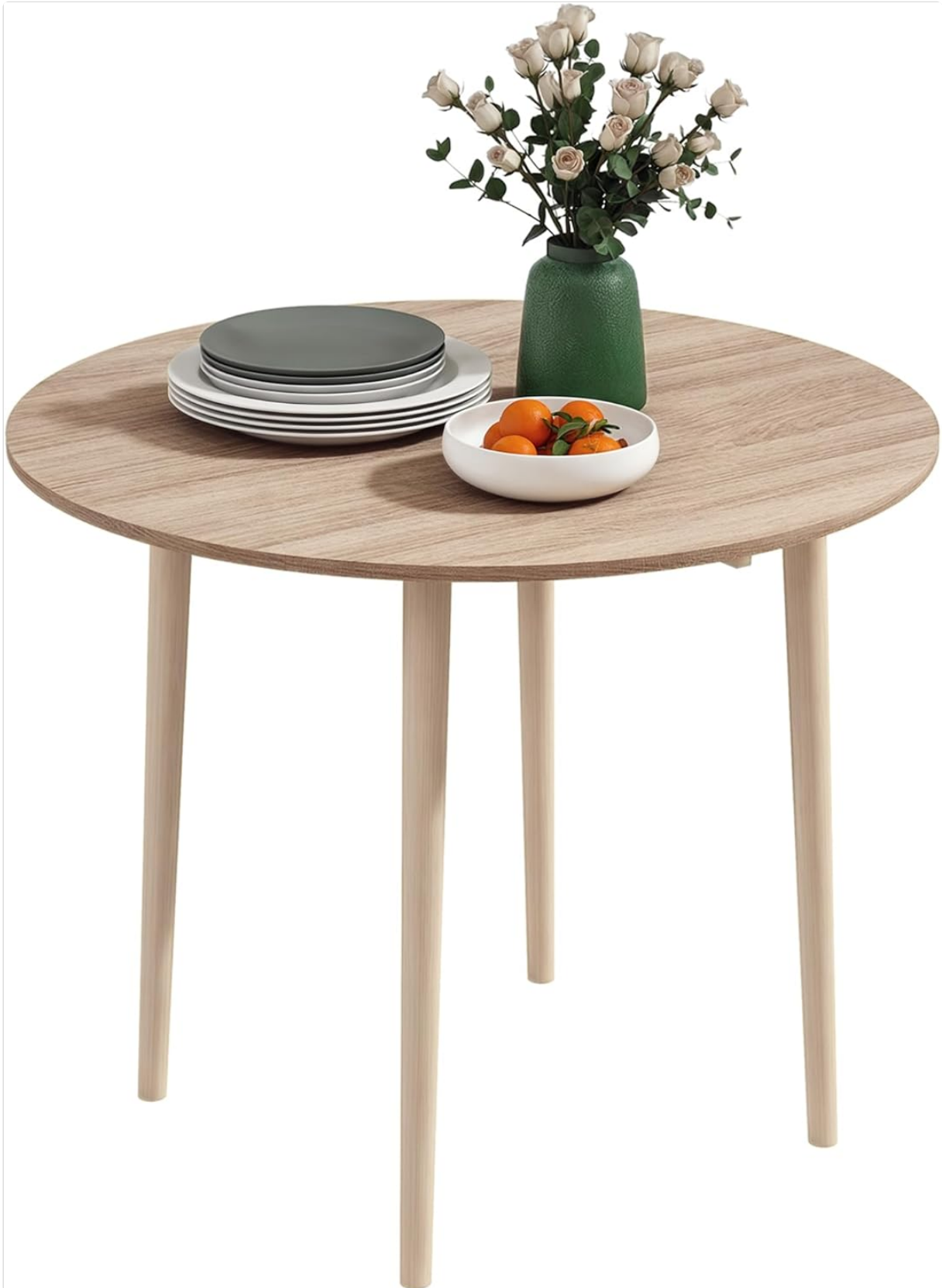
Image 2.1: The HOMCOM 35 inch Collapsible Drop Leaf Dining Table in its fully extended, round configuration, featuring an oak finish and solid wood legs. It is shown with a vase of flowers and plates.