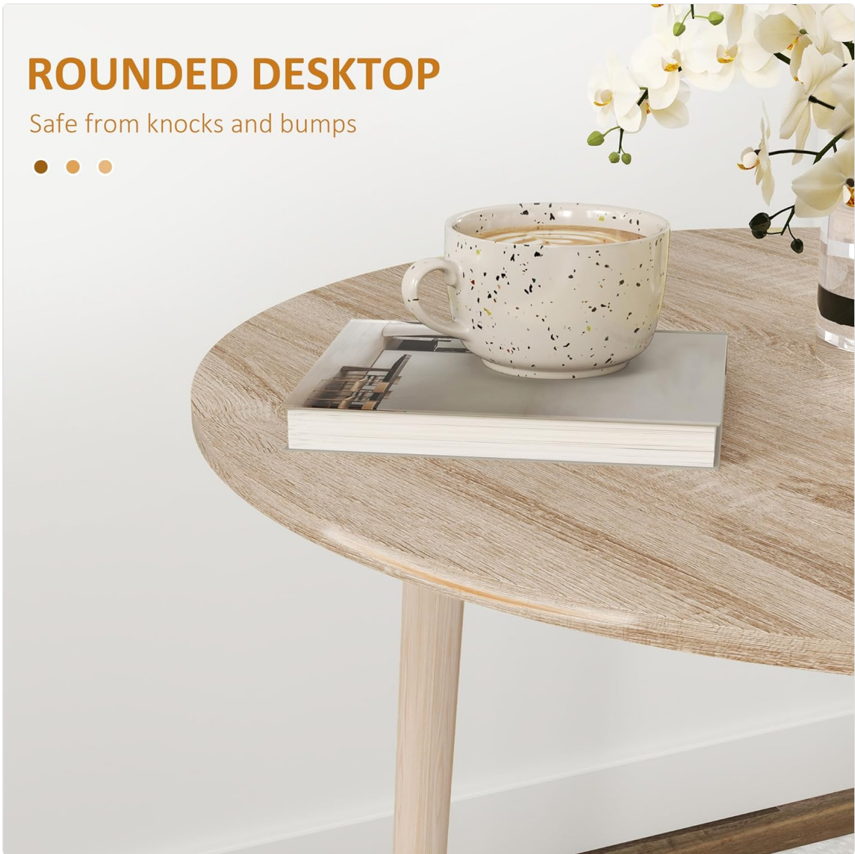
Image 5.1: The rounded desktop design, which helps prevent accidental bumps and provides a smooth surface for daily use.