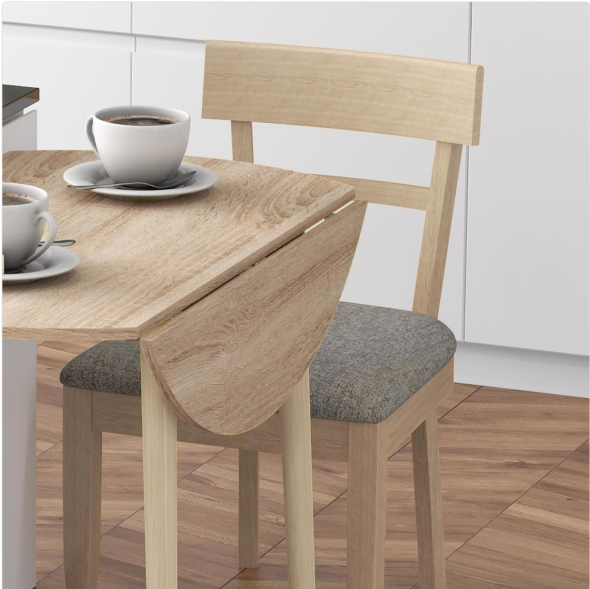
Image 4.2: A detailed view of the drop leaf hinge and support mechanism, illustrating how the leaf folds down.

Always ensure the support arms are fully engaged when leaves are extended to maintain stability.