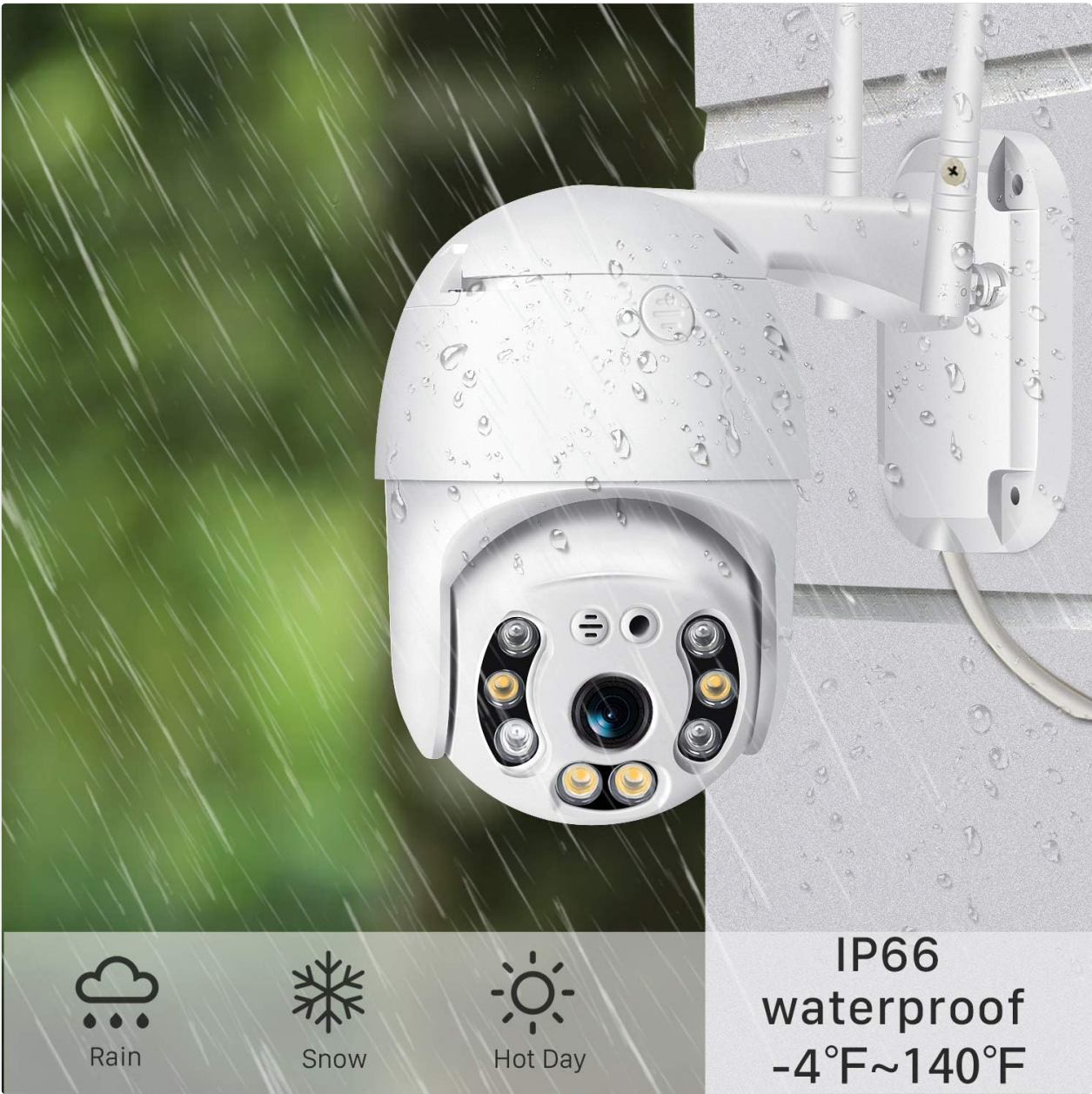
Figure 5: IP66 Weather-Proof Design