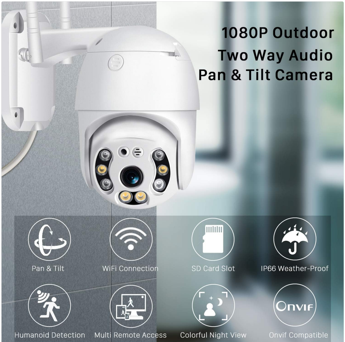
Figure 6: Comprehensive Feature Overview