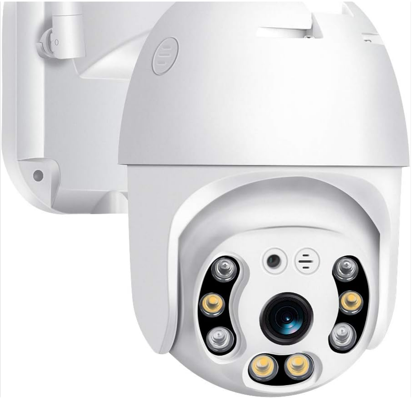
Figure 1: BESDERSEC Pan Tilt Outdoor Security Camera (Front View)