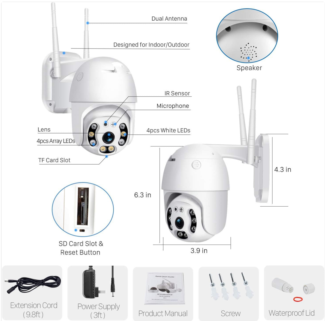
Figure 2: Package Contents and Camera Dimensions