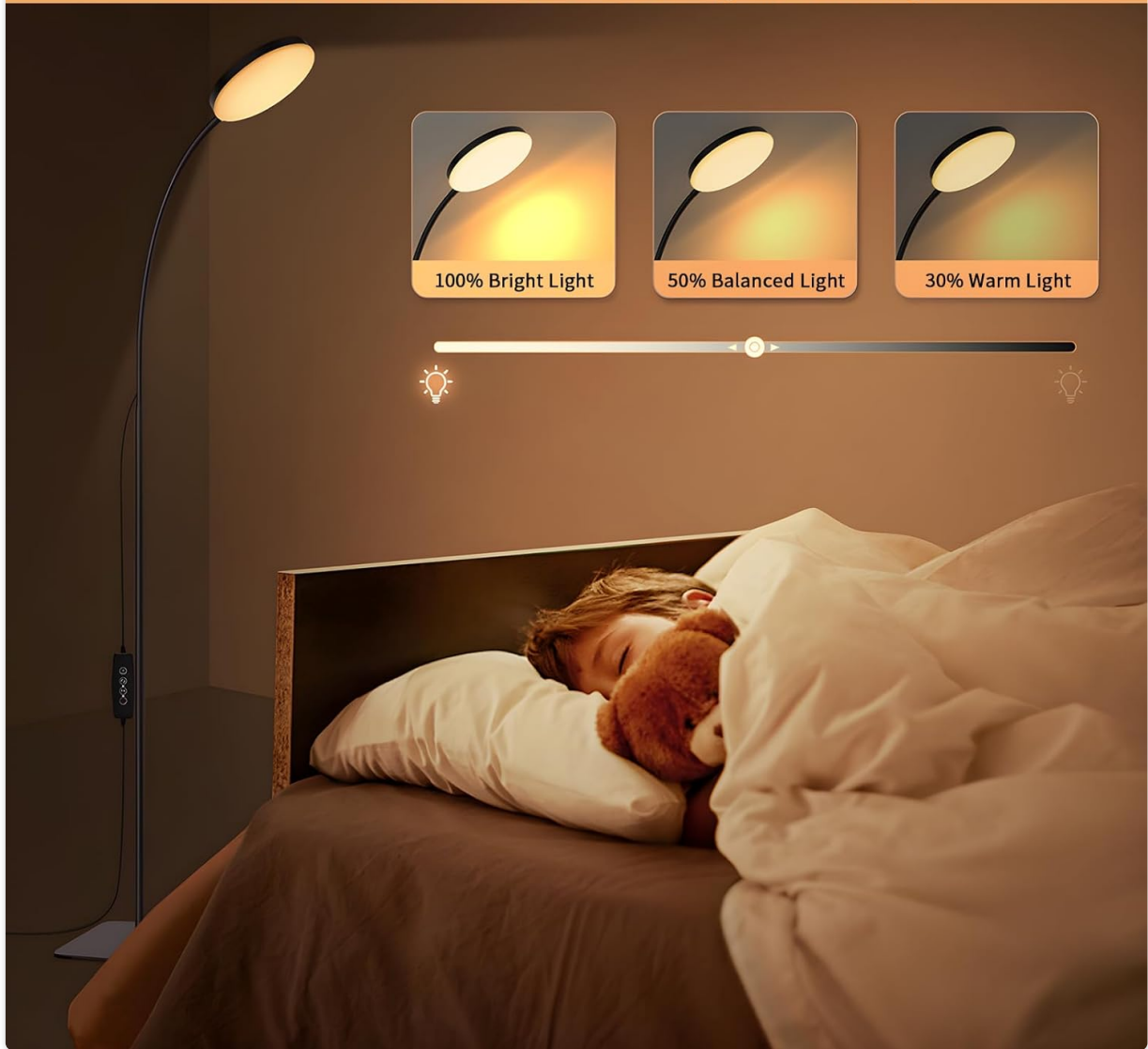
Image: The Mojimdo LED Floor Lamp demonstrating dimmable brightness with 10 levels, showing 100% Bright Light, 50% Balanced Light, and 30% Warm Light settings.

Each color mode has 10 levels of brightness settings