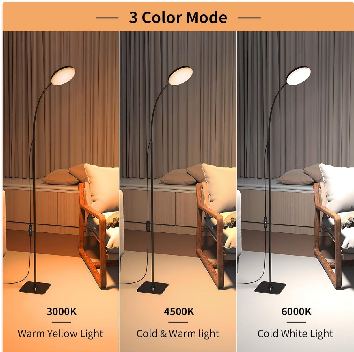
Image: The Mojimdo LED Floor Lamp displaying three distinct color temperatures: 3000K Warm Yellow Light, 4500K Cold & Warm Light, and 6000K Cold White Light.

The lamp offers three color temperature modes: