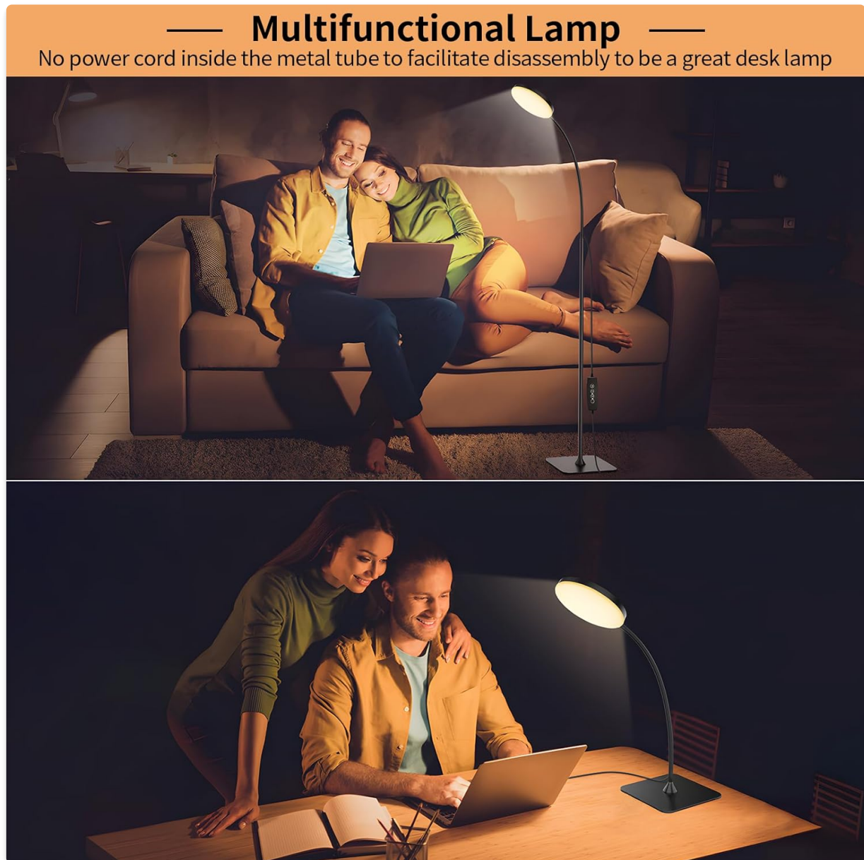
Image: The Mojimdo LED lamp shown in two configurations: as a tall floor lamp next to a sofa, and as a shorter desk lamp on a table, demonstrating its convertible design.

This lamp can be easily converted between a floor lamp and a desk lamp: