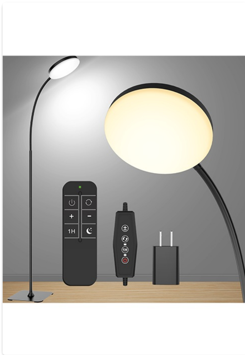
Image: Contents of the Mojimdo 168 LED Floor Lamp package, including the lamp head, pole sections, base, remote control, dimmer on cord, and USB power adapter.