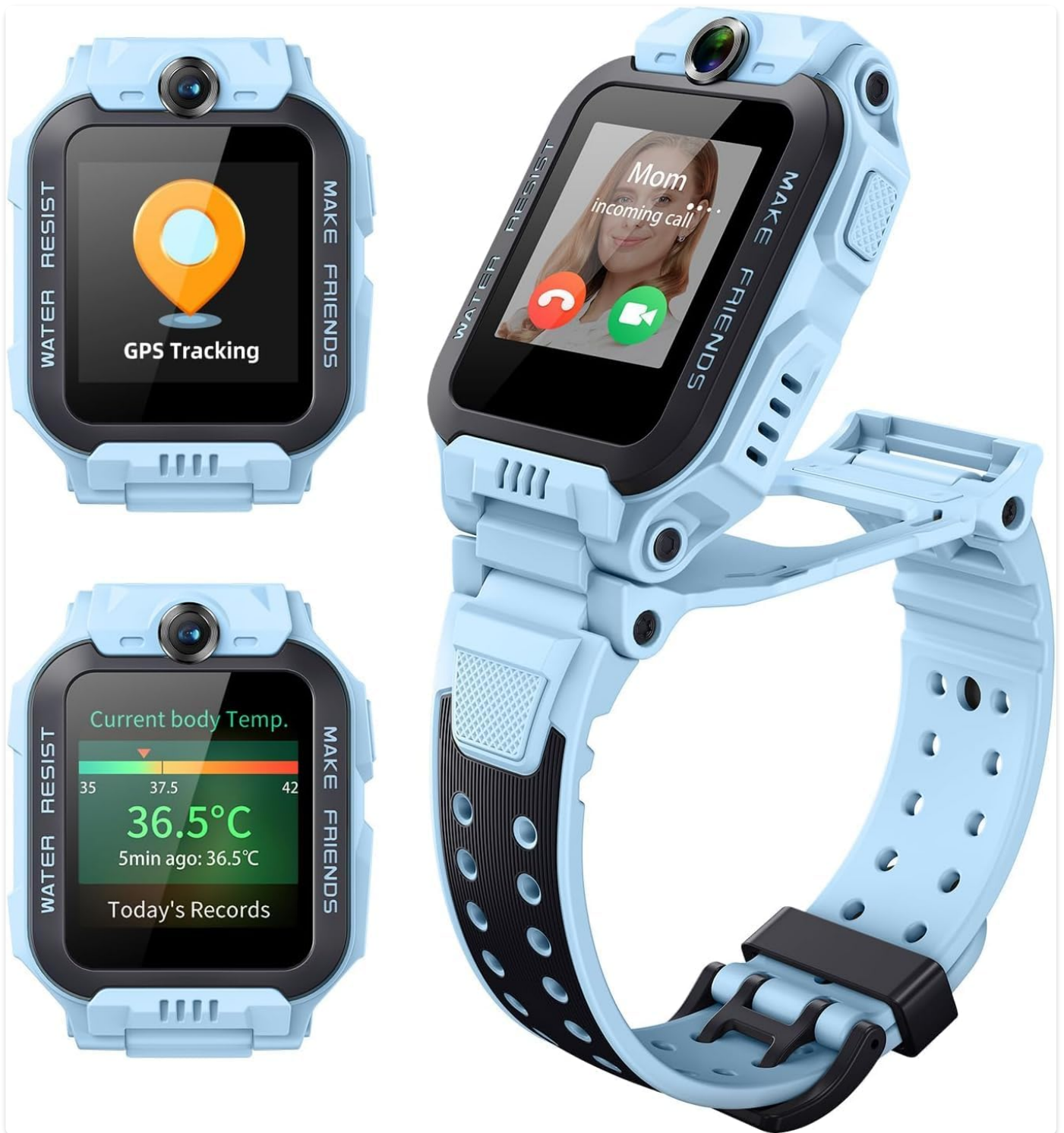
Figure 1: Overview of the imoo Watch Phone Z7's key features including GPS tracking, call interface, and health monitoring.