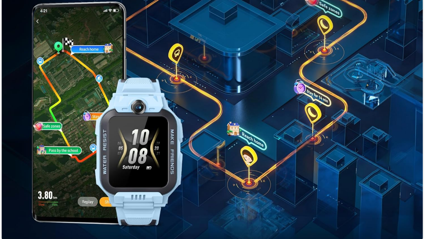
Figure 5: The imoo Watch Phone Z7 illustrating the 14-day location history feature, showing past routes and safe zones.