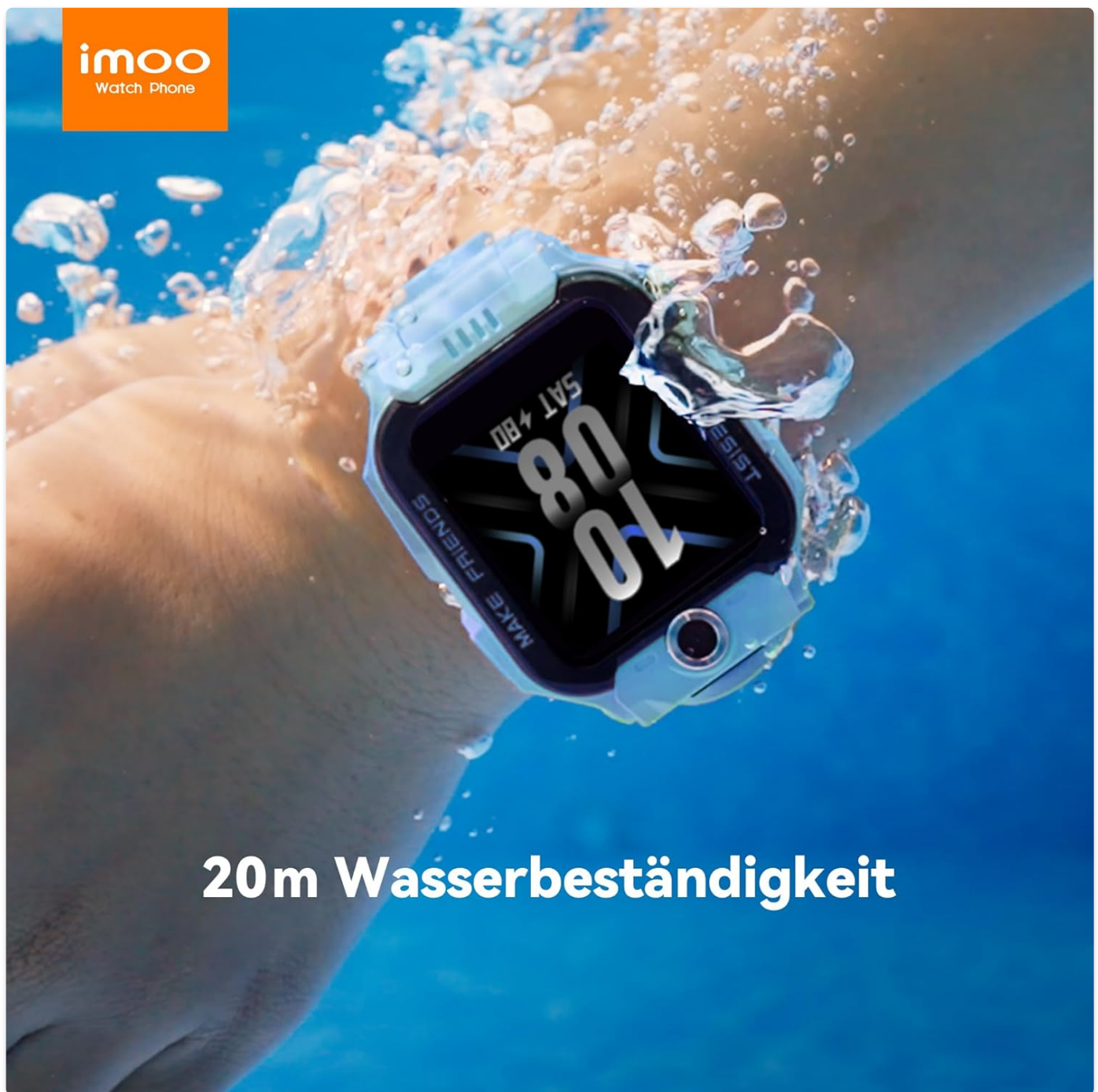
Figure 6: The imoo Watch Phone Z7 demonstrating its IPX8 water resistance while submerged.