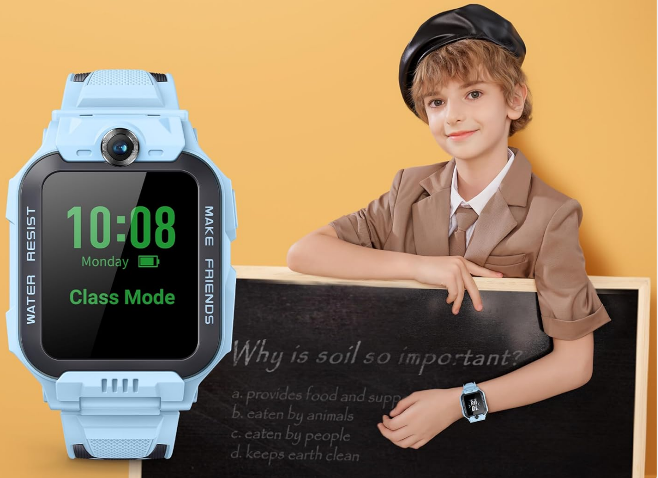
Figure 7: The imoo Watch Phone Z7 screen showing "Class Mode" activated, indicating a period of undisturbed learning.