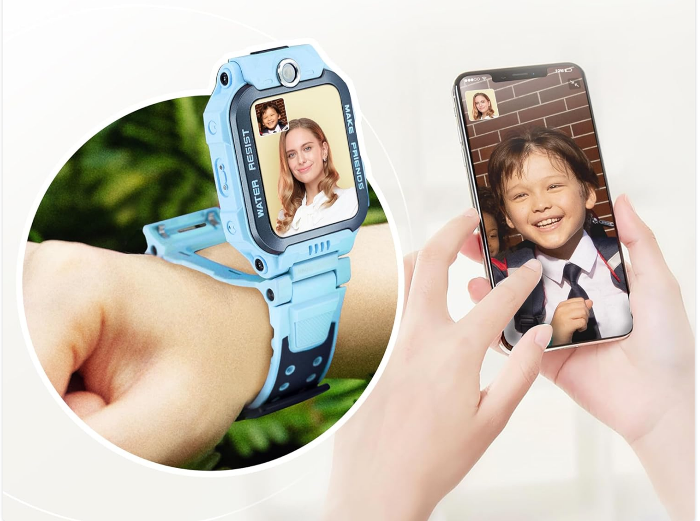
Figure 3: The imoo Watch Phone Z7 facilitating a two-way video call between a child and a parent.