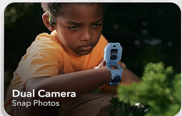
Figure 2: The imoo Watch Phone Z7 highlighting various features including SIM card insertion, class mode, and battery life.