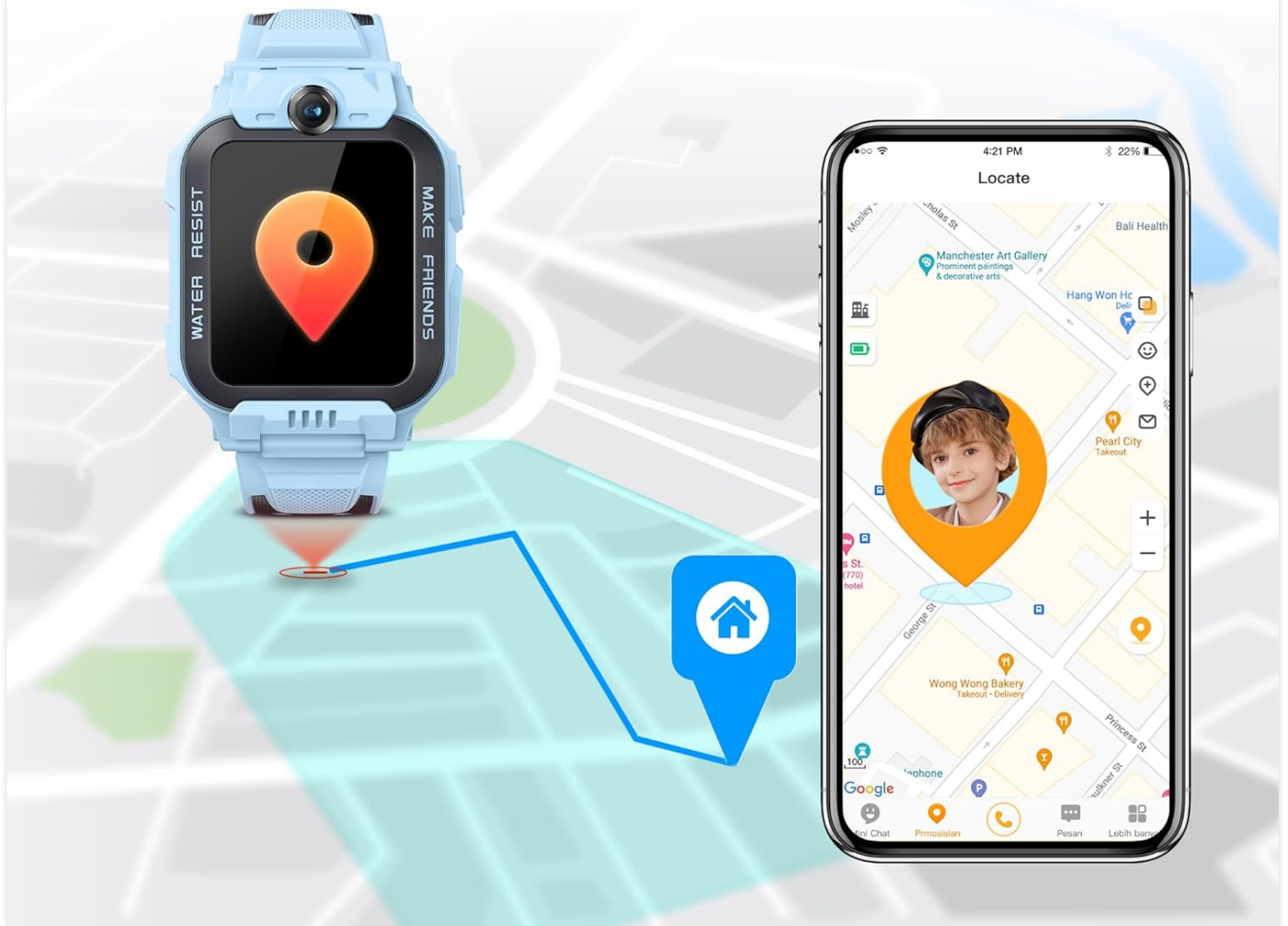
Figure 4: The imoo Watch Phone Z7 showing accurate real-time GPS positioning on a map interface.