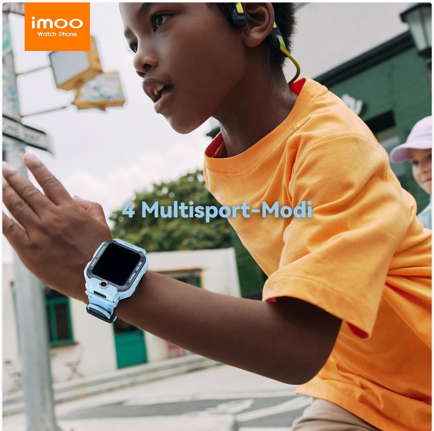
Figure 8: The imoo Watch Phone Z7 being worn by a child during an outdoor activity, highlighting its multi-sport tracking capabilities.