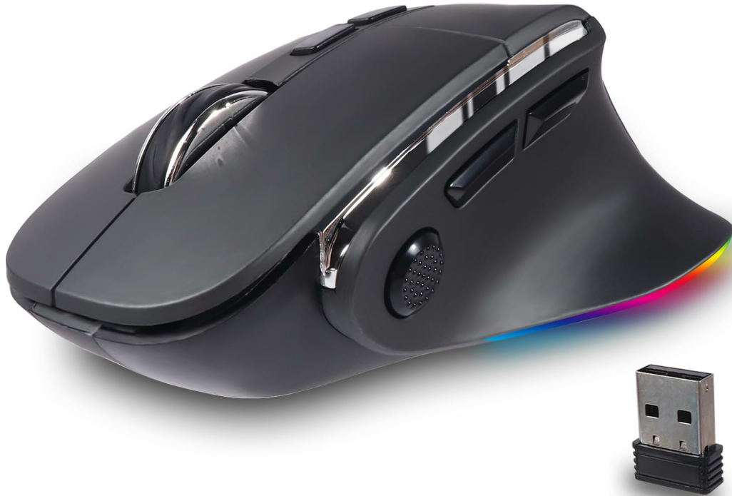
Image: The KUYHRF Ergonomic Vertical Wireless Mouse, showcasing its unique vertical design for improved wrist posture.