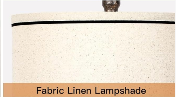
Fabric Linen Lampshade