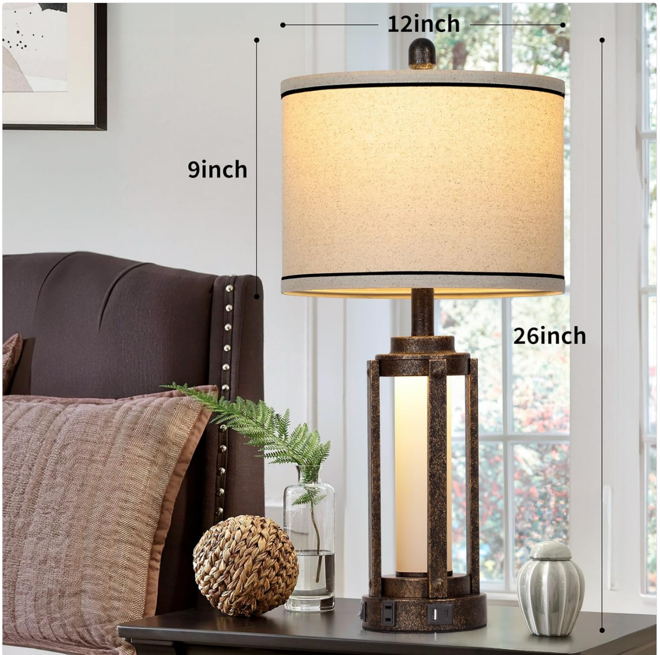
Image: Lolikit Farmhouse Table Lamp with key dimensions.