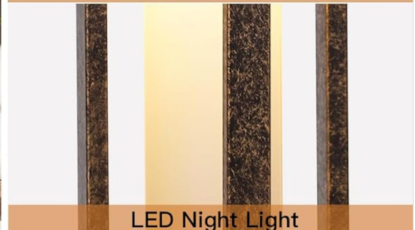
LED Night Light