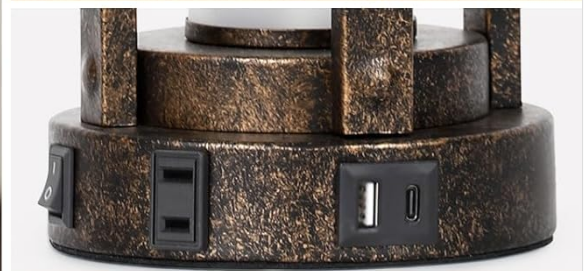
Sturdy Anti-slip Base