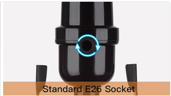
Standard E26 Socket