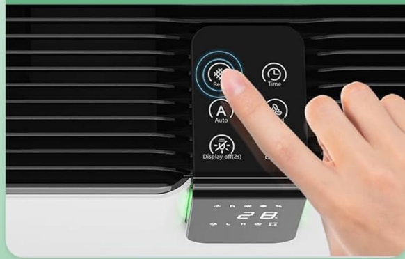
Image: A visual guide demonstrating the four steps for easy filter installation: pulling out the cover, unwrapping the new filter, inserting it, and resetting the indicator.

4. Long-press the "❄️" button for 3 seconds to reset the indicator