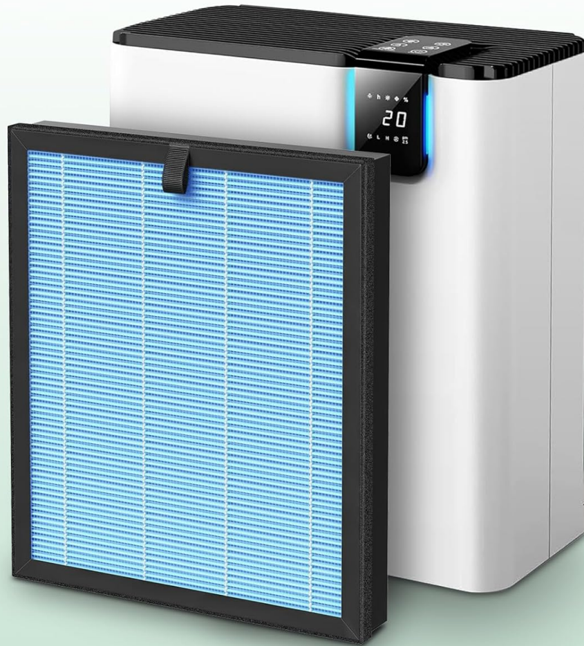
Image: The isinlive MJ005H Replacement Filter positioned next to a compatible POMORON MJ005H Air Purifier, illustrating its intended use.

Compatible with POMORON MJ005H Air Purifiers