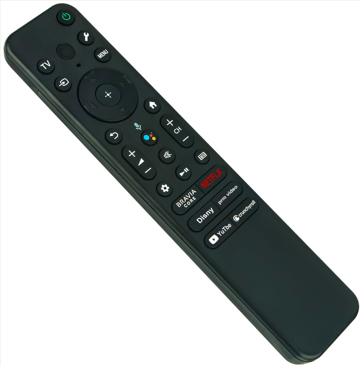
Figure 2: Angled view of the remote, illustrating its comfortable grip and button placement.