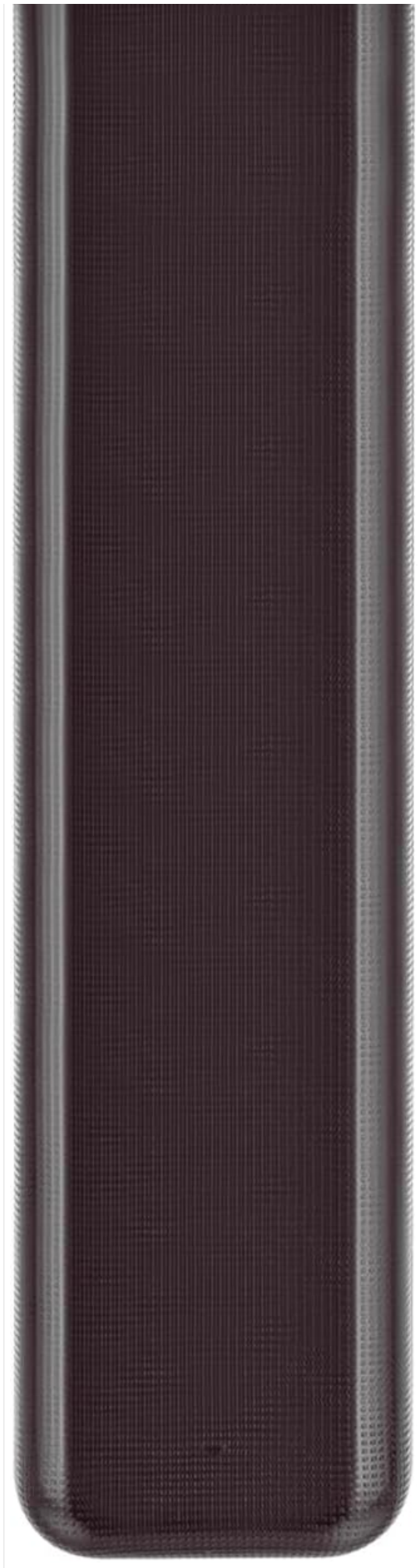
Figure 5: Side profile of the remote control, demonstrating its ergonomic contour.