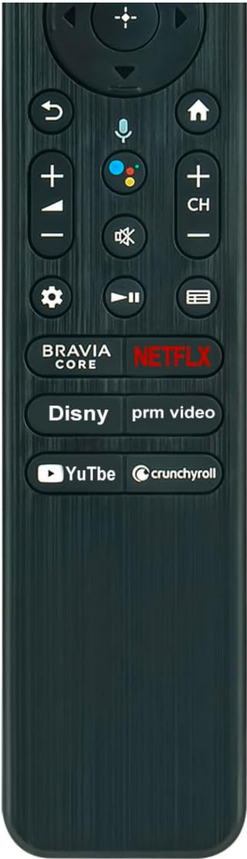
Figure 1: Front view of the RMF-TX810U remote control, highlighting the voice control microphone icon.