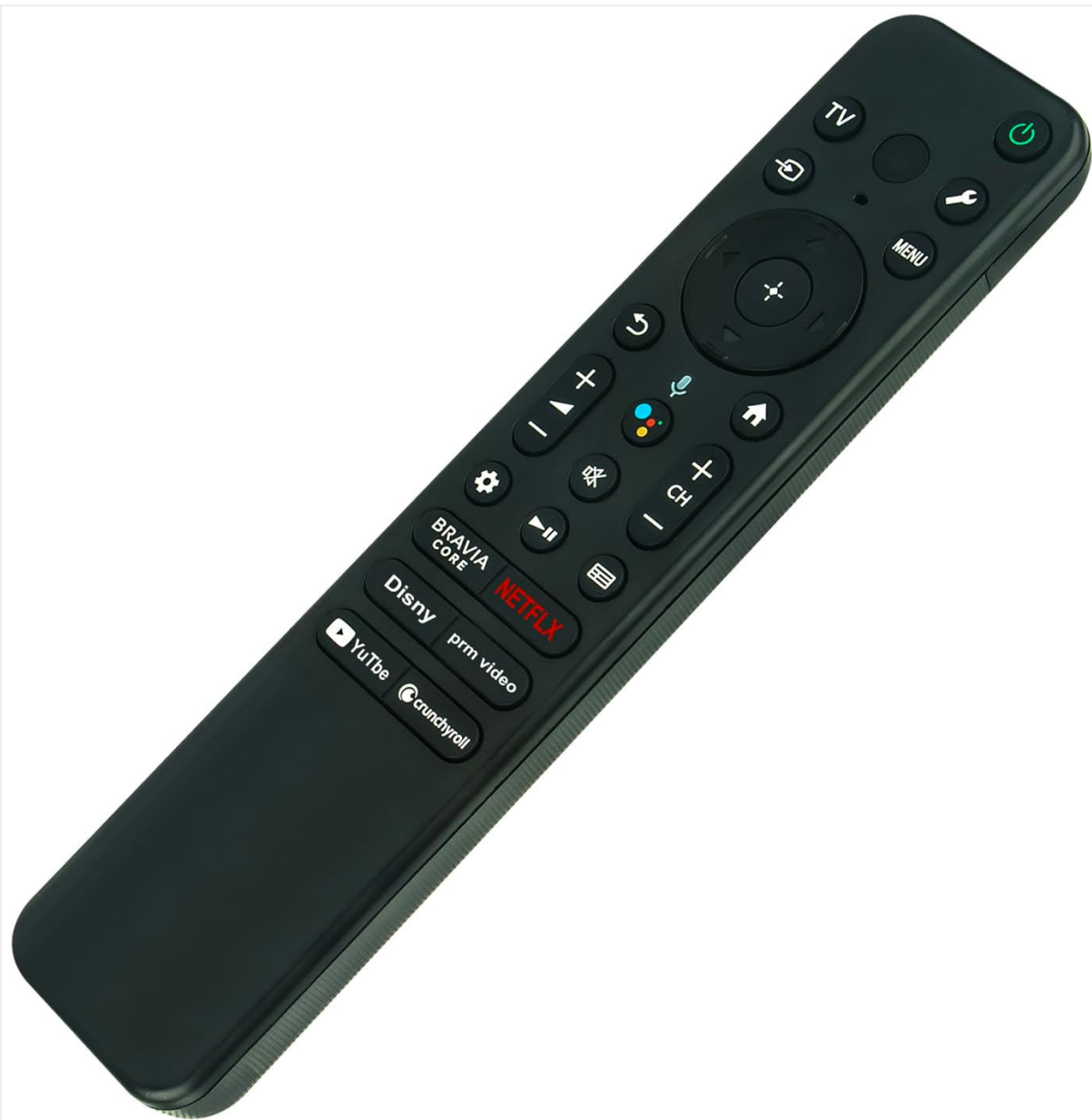
Figure 3: A different perspective of the remote control's front face.