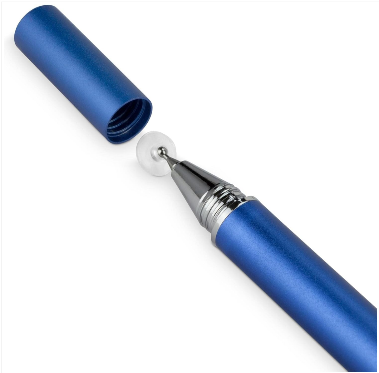
Image: A close-up view of the stylus tip with the protective cap removed, revealing the clear disc. This illustrates the first step of preparing the stylus for use.

Note: This stylus does not require Bluetooth connectivity or batteries. It does not support palm rejection or pressure sensitivity features.