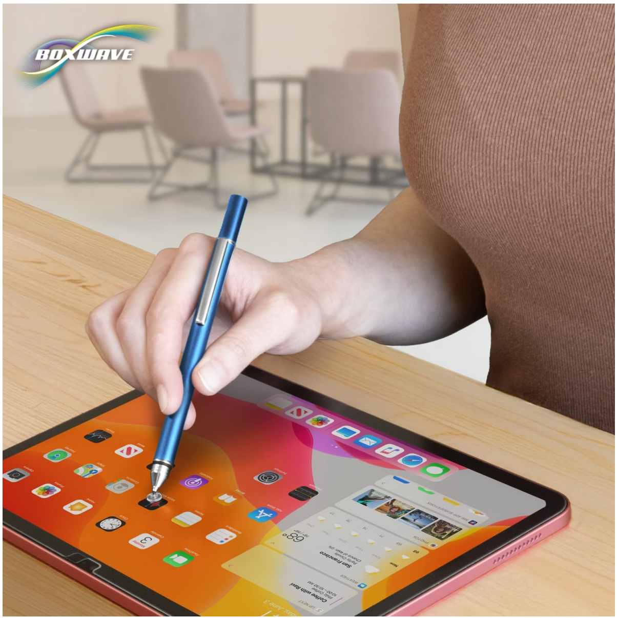
Image: A user demonstrating the stylus in action, interacting with a tablet screen. This shows the natural grip and use of the stylus.