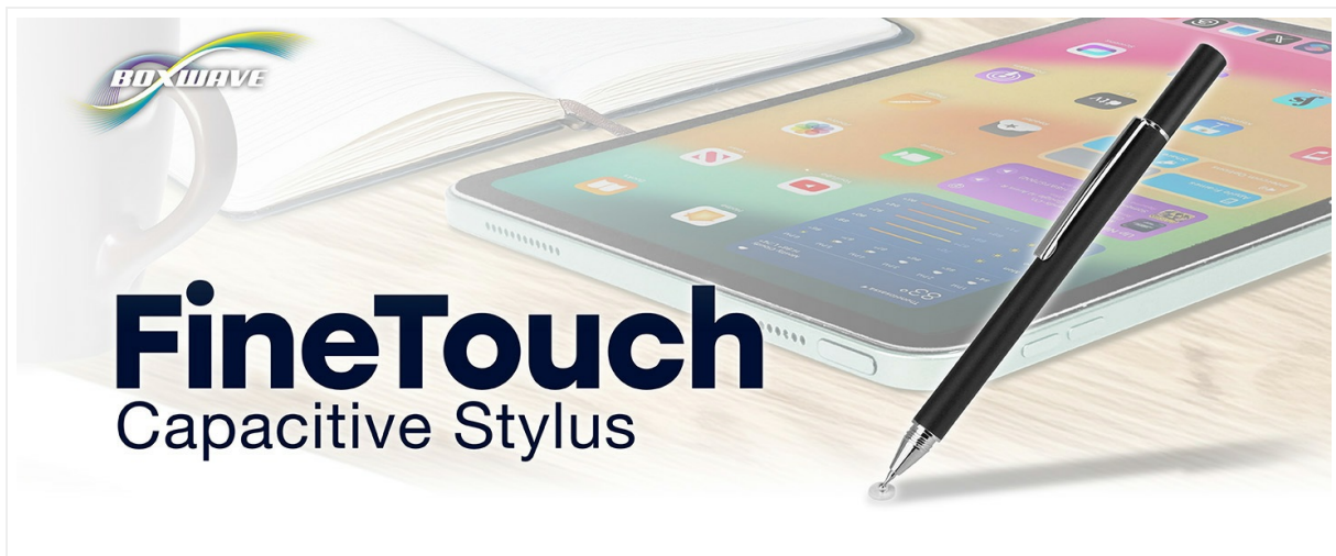
Image: The BoxWave FineTouch Capacitive Stylus, highlighting its clear disc tip for precise touchscreen interaction.

Thank you for choosing the BoxWave FineTouch Capacitive Stylus. This stylus is designed to provide precise and comfortable interaction with your capacitive touchscreen devices, including the Kia 2024 Telluride Display (12.3 in). Its clear disc tip allows for enhanced visibility, ensuring accuracy in your tasks.