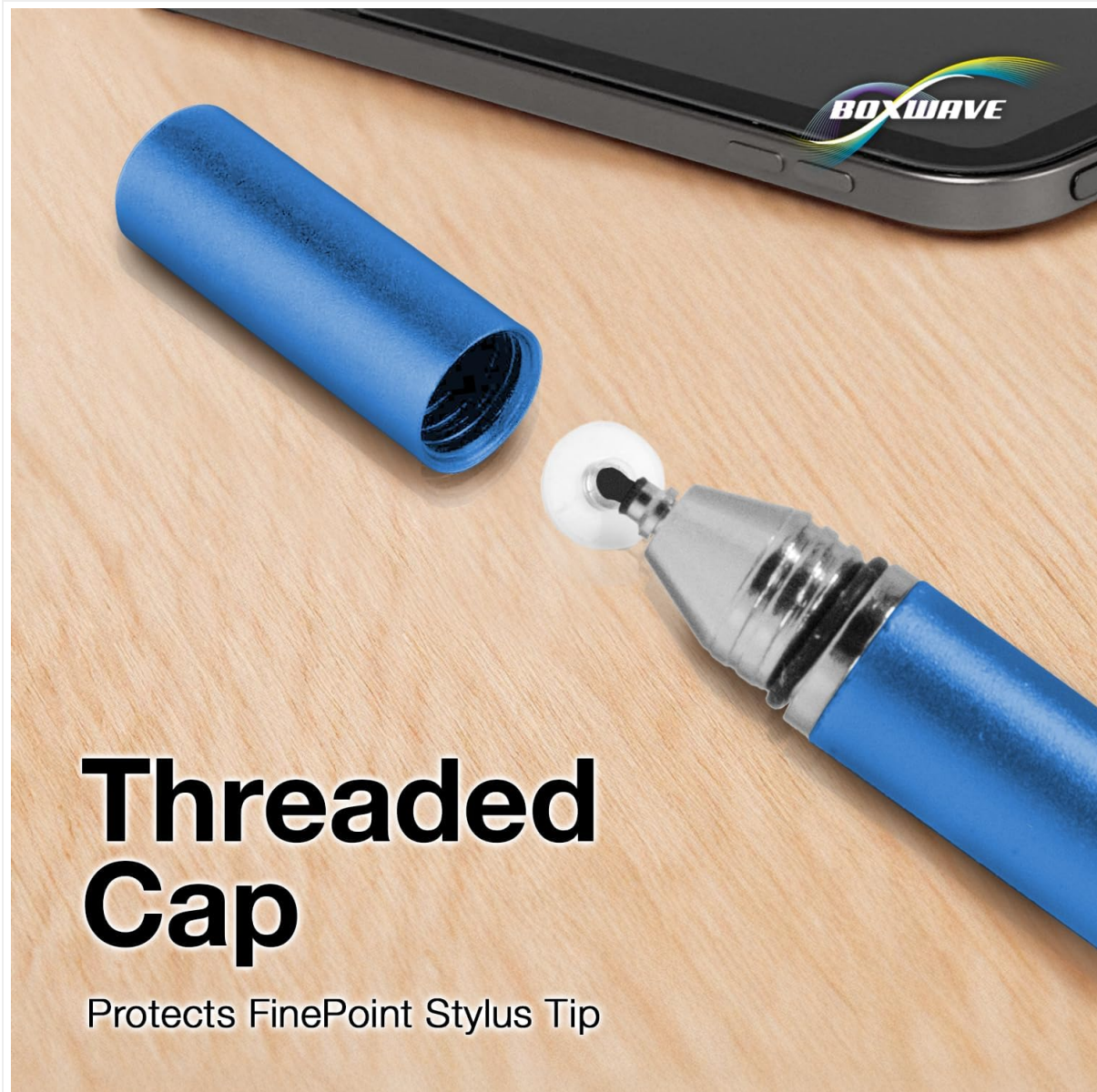
Image: A close-up showing the threaded cap being placed onto the stylus, demonstrating how it secures and protects the clear disc tip.