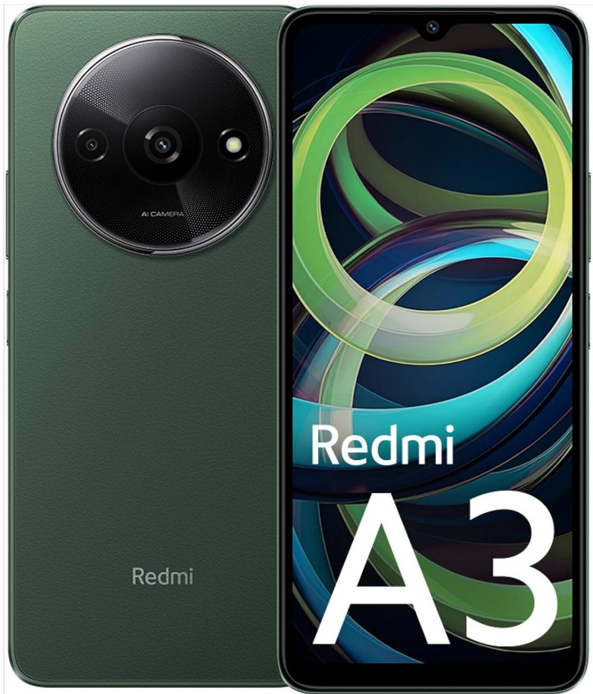
Image: Front and back view of the Xiaomi Redmi A3 smartphone, showcasing its design and camera module.