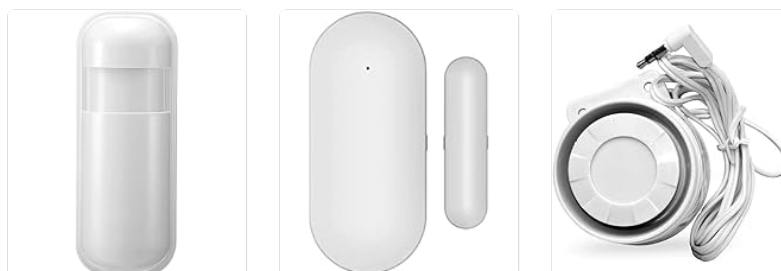
Figure 3.3: Individual components: Motion detector, door/window sensor, and wired siren.