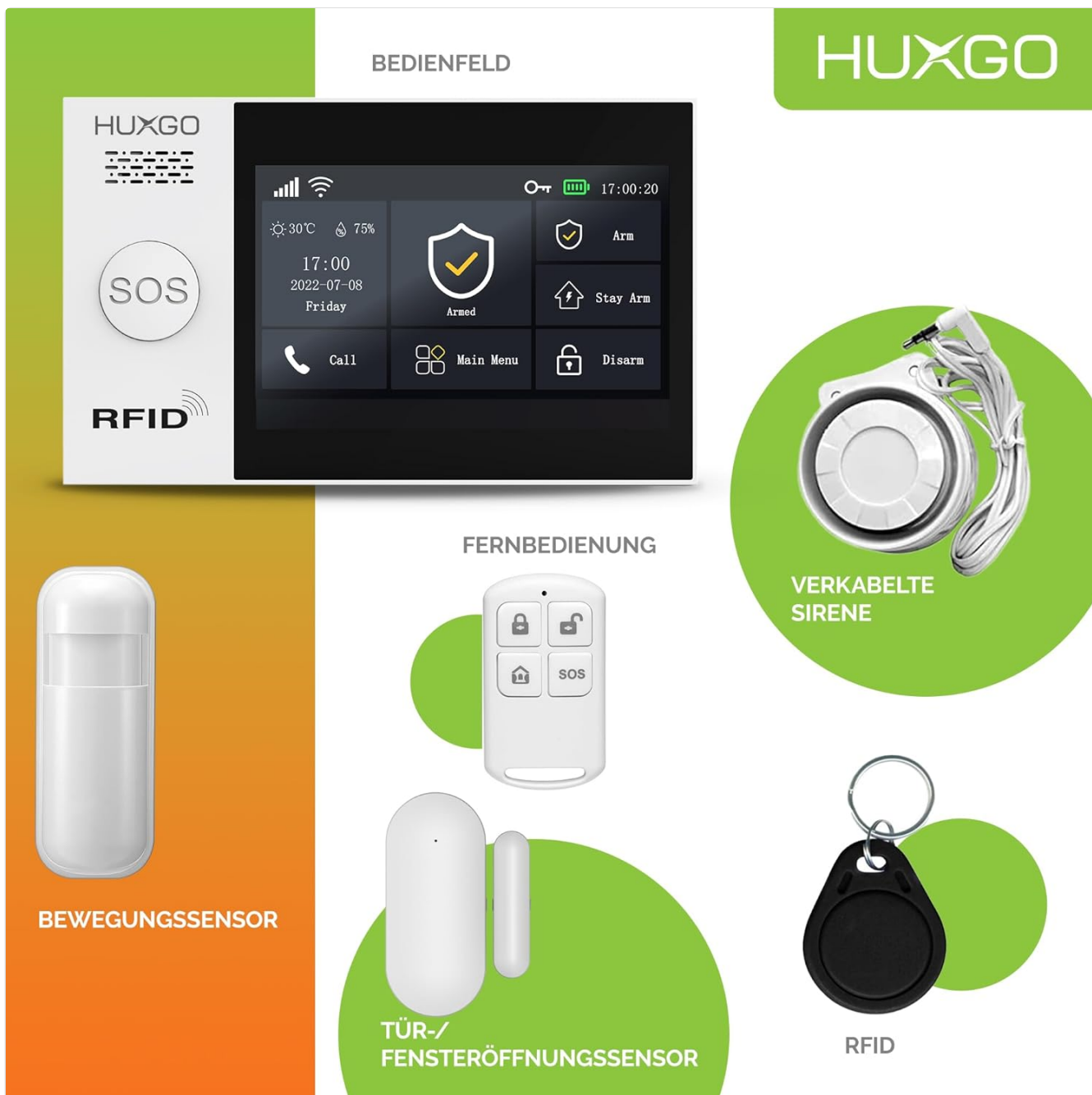
Figure 2.1: Overview of the HUXGO HXA007 alarm system components, including the control panel, motion sensor, remote control, door/window sensor, wired siren, and RFID tag.