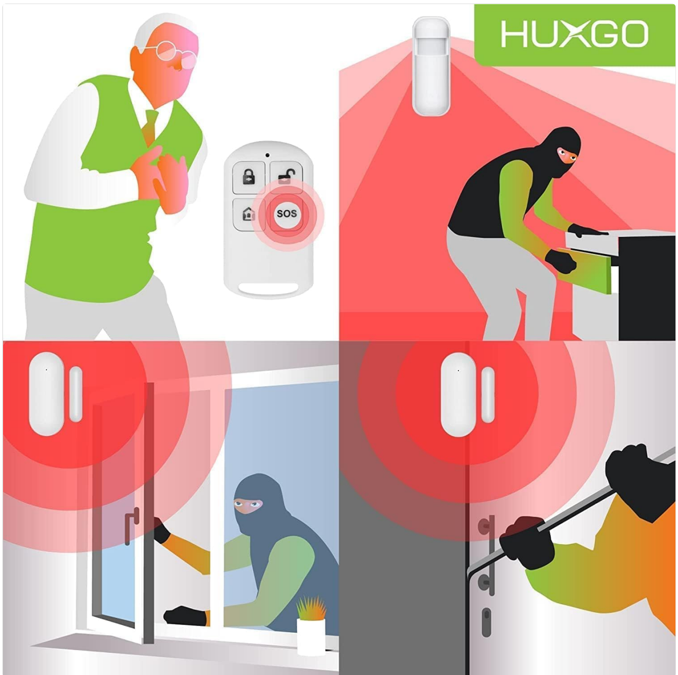
Figure 4.3: Various alarm scenarios detected by the HUXGO HXA007 system, including motion detection, door/window breaches, and SOS activation.