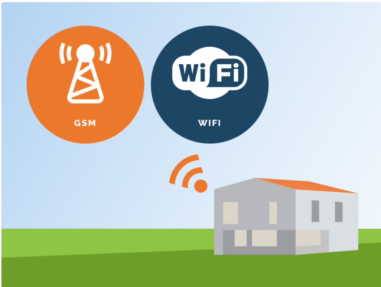
Figure 3.2: Illustration of the HUXGO HXA007's dual network connectivity, supporting both WiFi and GSM for reliable communication.