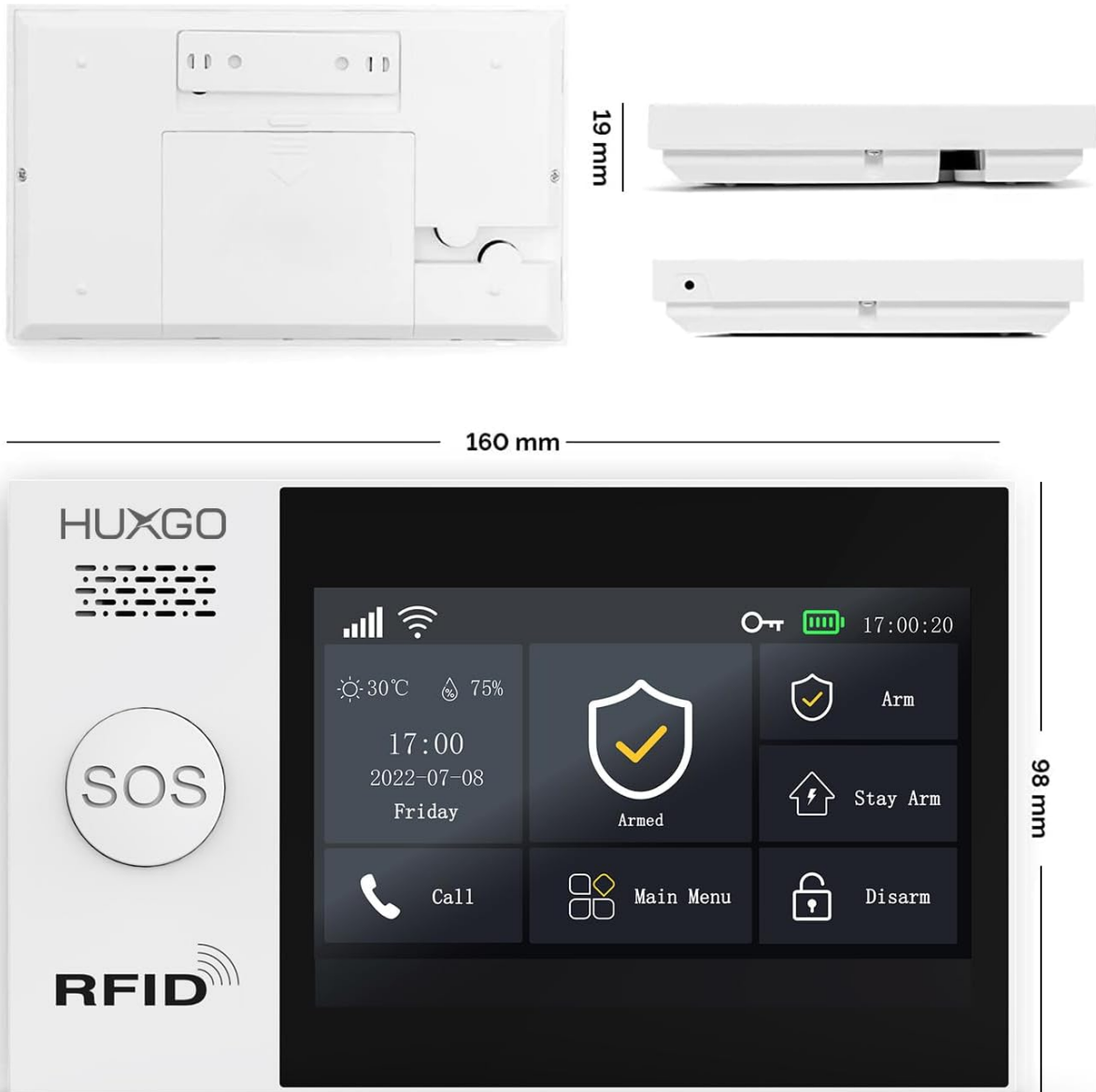
Figure 3.1: Dimensions of the HUXGO HXA007 control panel, measuring 160mm in length, 98mm in height, and 19mm in depth.