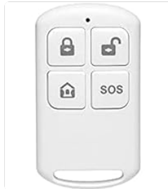
Figure 4.1: The HUXGO remote control with buttons for arming, disarming, stay arm, and SOS.

You can arm or disarm the system using the control panel's touchscreen, the remote controls, RFID key fobs, or the TUYA Smart App.