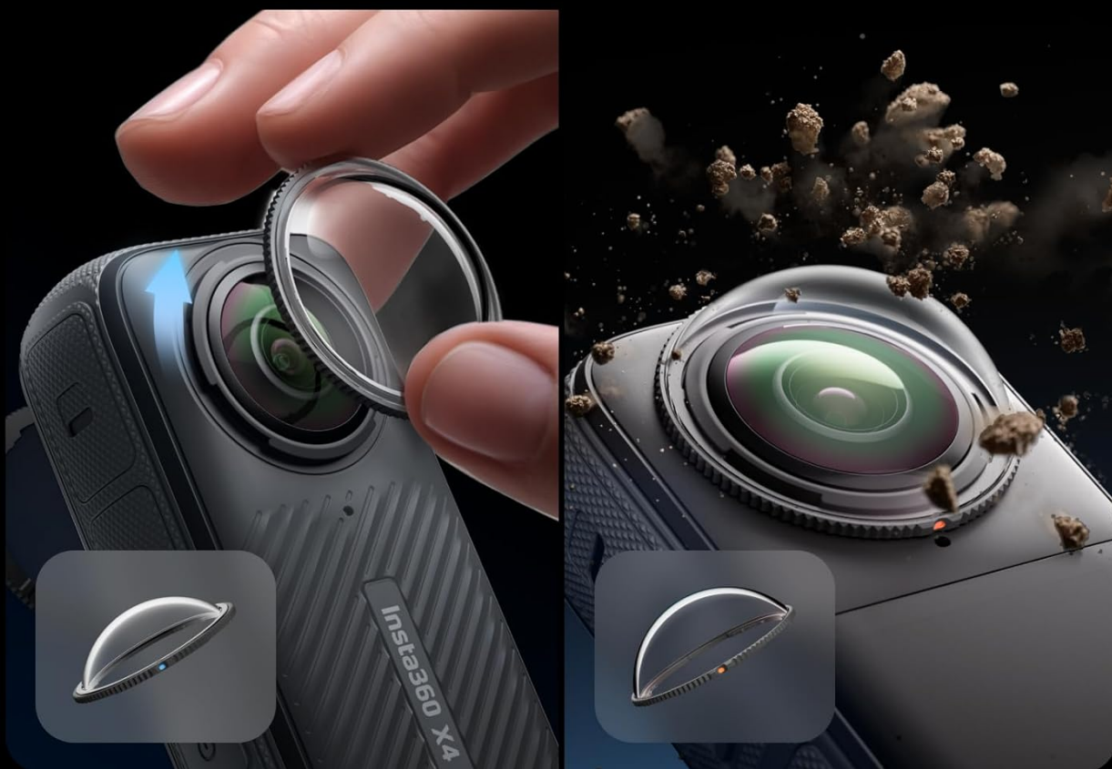
Image: A close-up of hands attaching a removable lens guard to the Insta360 X4, demonstrating the twist-on mechanism.

Easier lens protection as standard. X4 comes with smarter, easy-to-apply lens guards that are removable in a pinch.