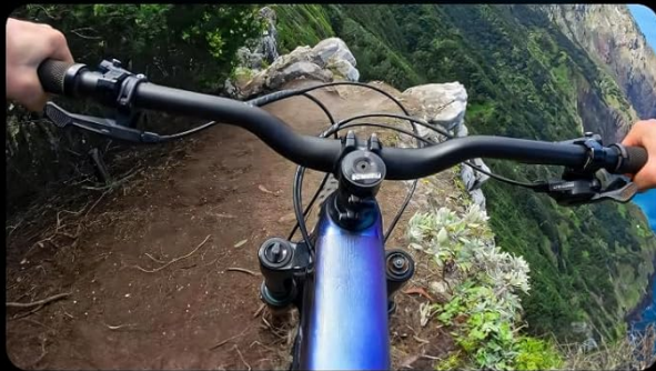
Other Action Cameras

Single-Lens Mode now upgraded to 4K60fps! Take it further and go ultra wide with 4K30fps 170° MaxView.