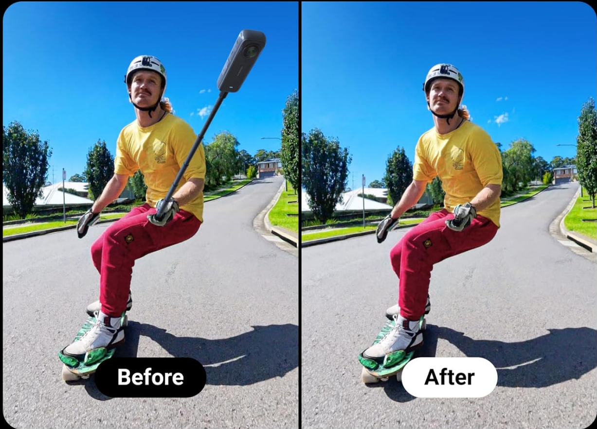
Image: A comparison showing footage before and after the invisible selfie stick effect, making the stick disappear for seamless third-person views.

The Invisible Selfie Stick automatically disappears from your footage! Capture incredible third-person shots and drone-like angles with X4.