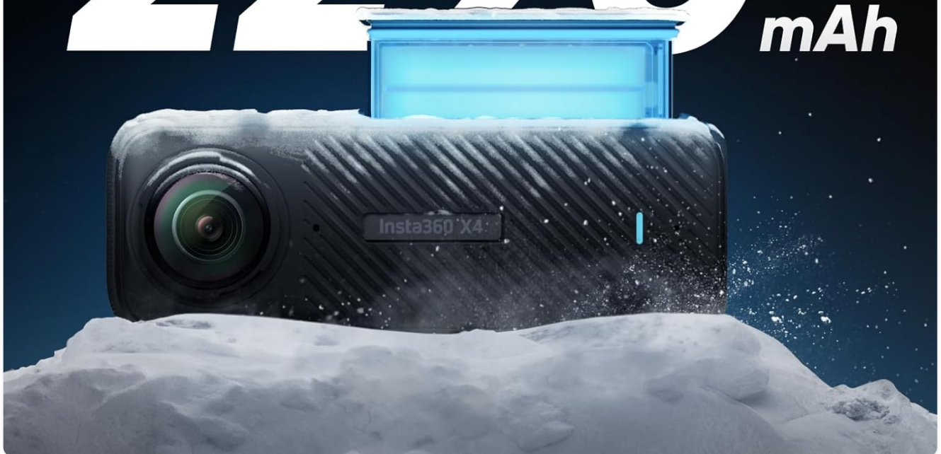
Image: The Insta360 X4's large 2290mAh battery, providing up to 135 minutes of recording time in 5.7K30fps 360 mode.