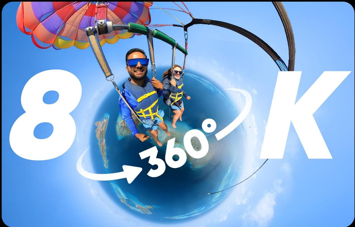
Image: The Insta360 X4's capability to capture 8K 360-degree video, highlighting the flexibility of reframing shots later in the app.

Immerse yourself in the world of unbelievable 8K! Just hit record and find the perfect shot later, with easy reframing in the Insta360 app.