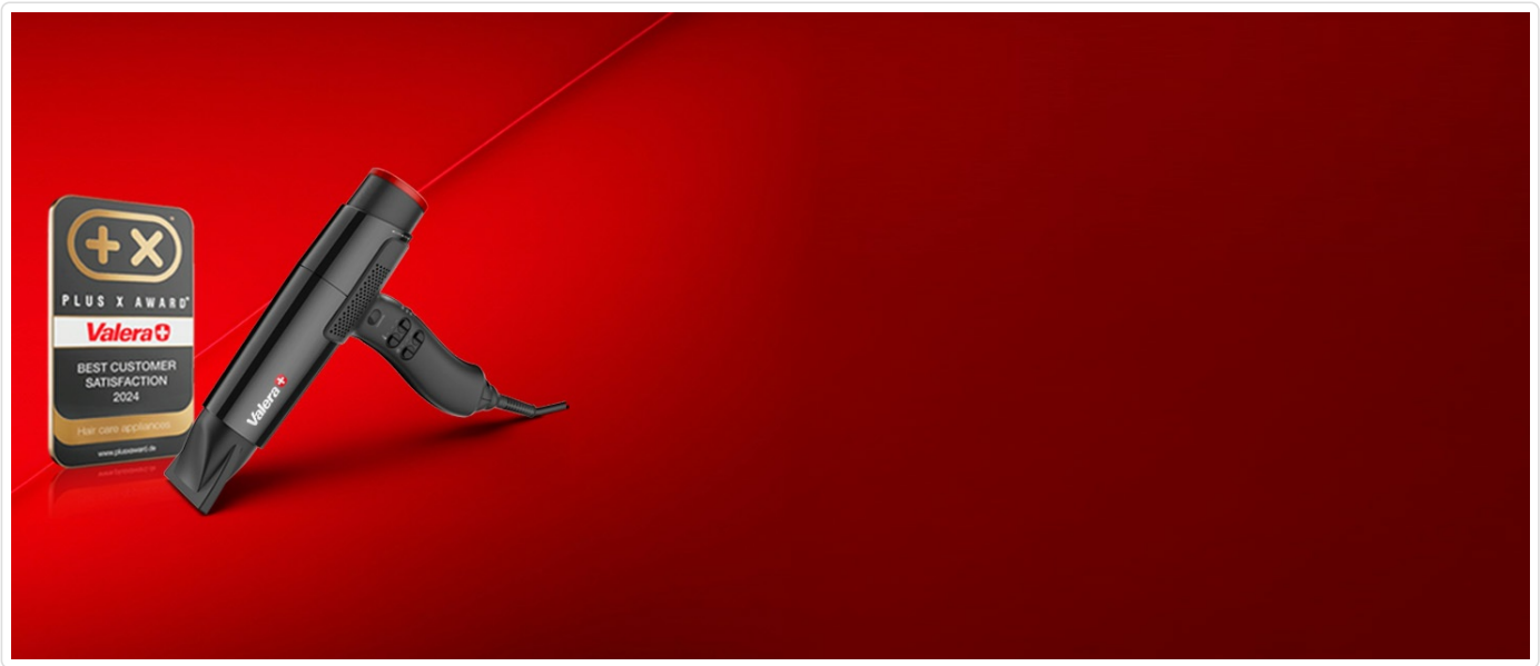
Image: A promotional image featuring a Valera hair dryer alongside a "Plus X Award" for best customer satisfaction, set against a red background.