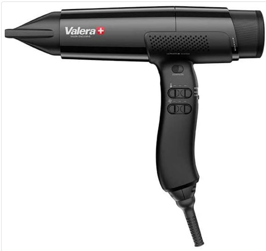
Image: The Valera Ultimate AI NightBlack hair dryer, showcasing its sleek black design and ergonomic handle. This is the main product image.