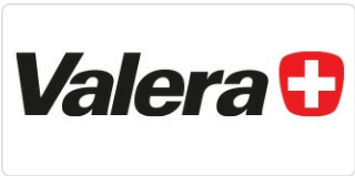
Image: The official Valera brand logo, representing Swiss quality and expertise in hair care.

For warranty information and customer support, please refer to the warranty card included with your product or visit the official Valera website. You can also contact your retailer for assistance. Valera Brand Story: Healthy, shiny, beautiful hair, as well as well-being, safety, and sustainable development, are the cornerstones of our universe. With expertise and passion, we dedicate ourselves to the development of our Valera hair care devices, trusted by professional stylists and demanding users. Valera, Swiss Hair Specialists since 1955.