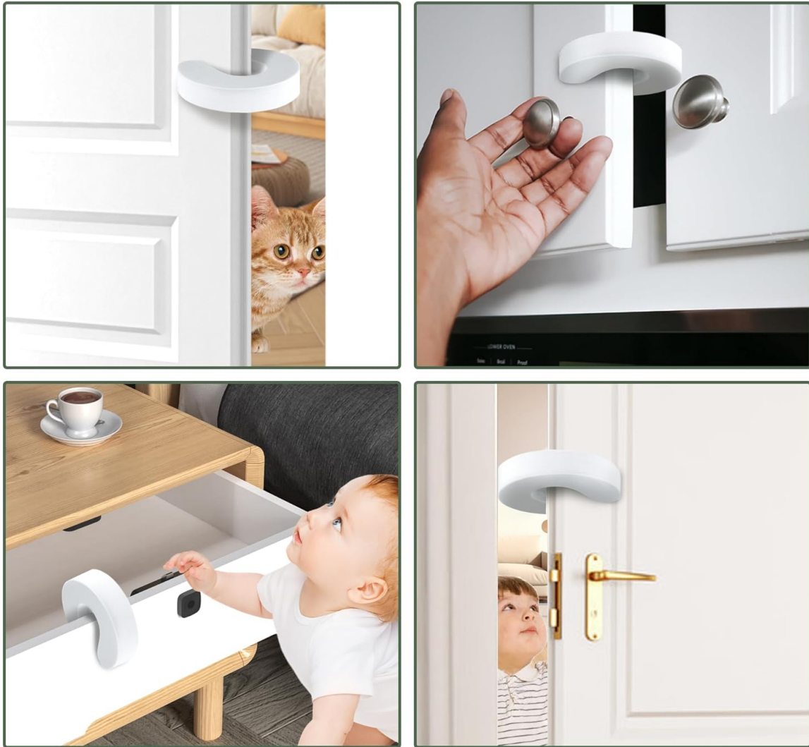
Image 5.2: The guards can be used on various doors, cabinets, and drawers for wide-ranging protection.