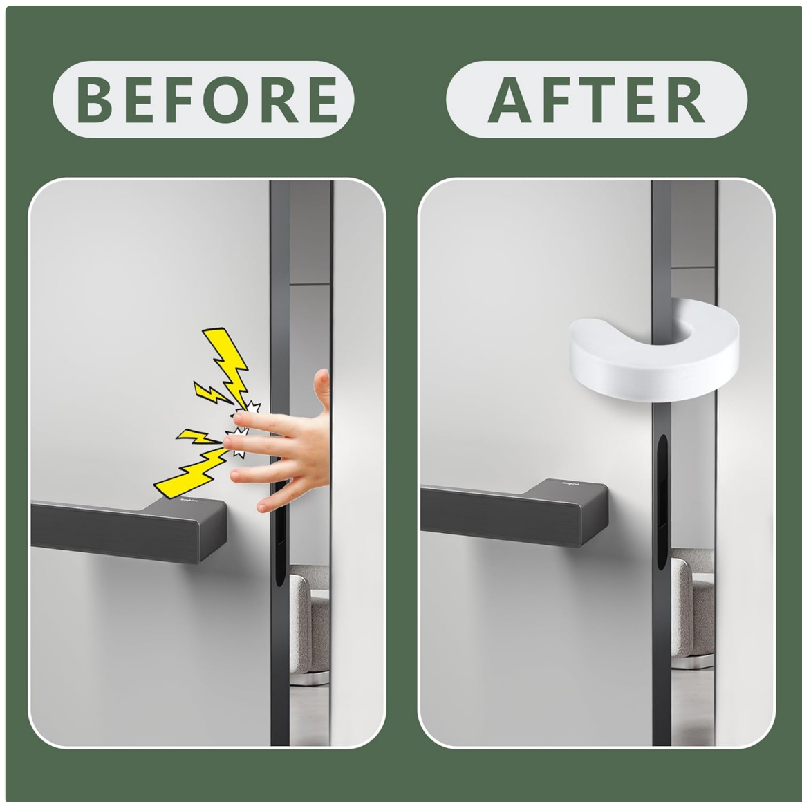
Image 4.2: Visual demonstration of the door guard preventing finger injuries.