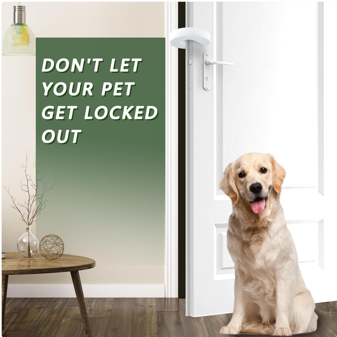
Image 5.1: The door guard helps prevent pets from being locked out or in.