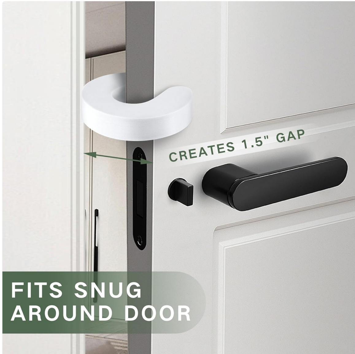
Image 4.1: Proper installation of the door guard, showing it fits snugly and creates a 1.5-inch gap.