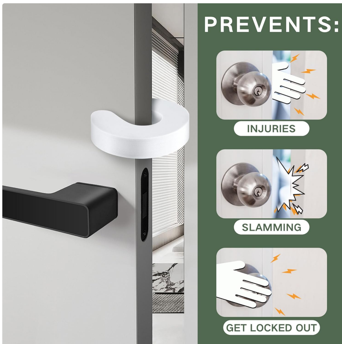
Image 2.1: The door guard effectively prevents injuries, slamming, and accidental lock-outs.