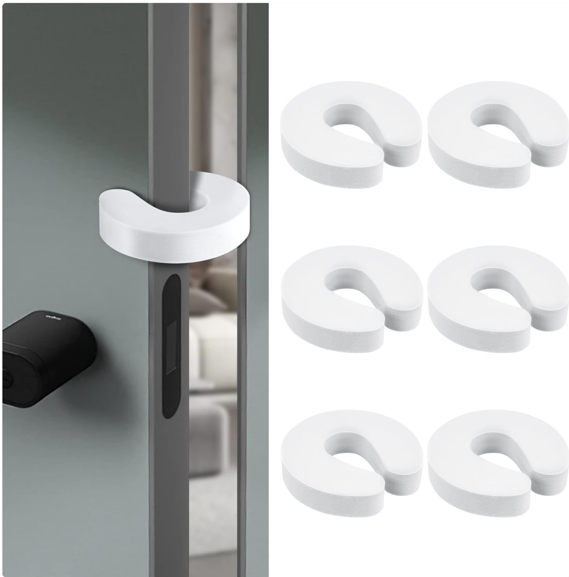
Image 1.1: YIIFELL 6-Pack EVA Foam Door Finger Pinch Guards. These guards are designed to prevent door-related accidents.