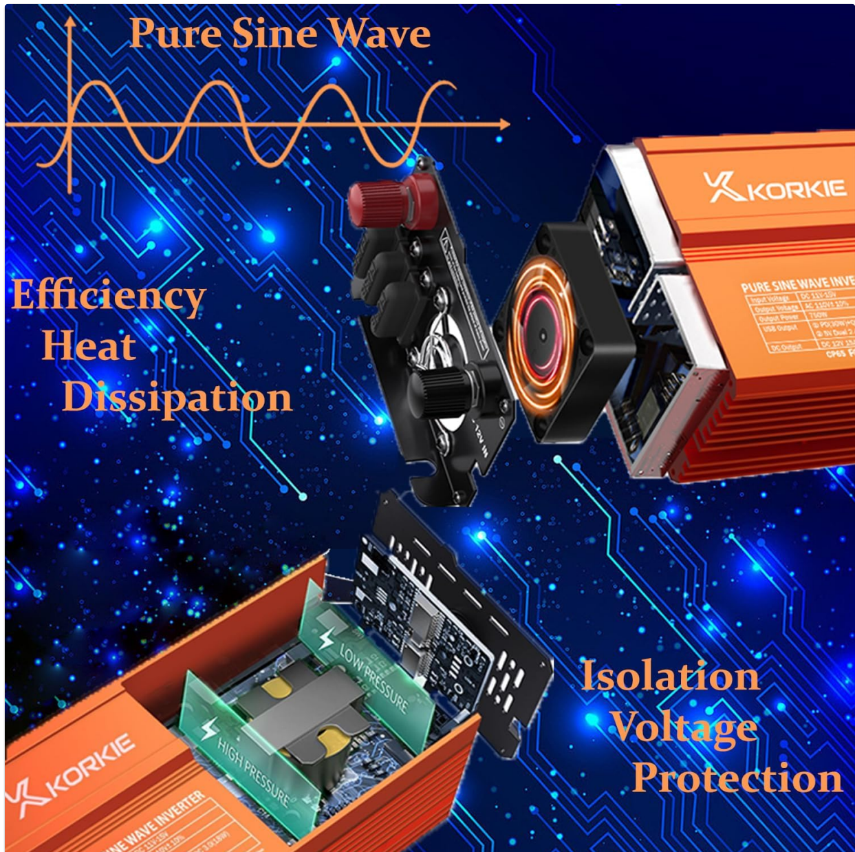
Figure 4.1: Inverter's internal structure and safety protections.