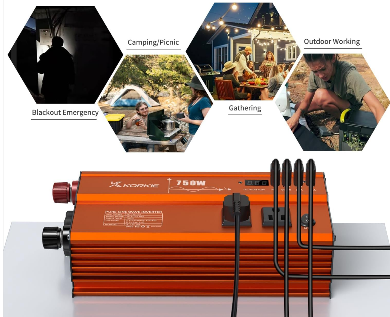
Figure 6.2: Versatile applications of the inverter.