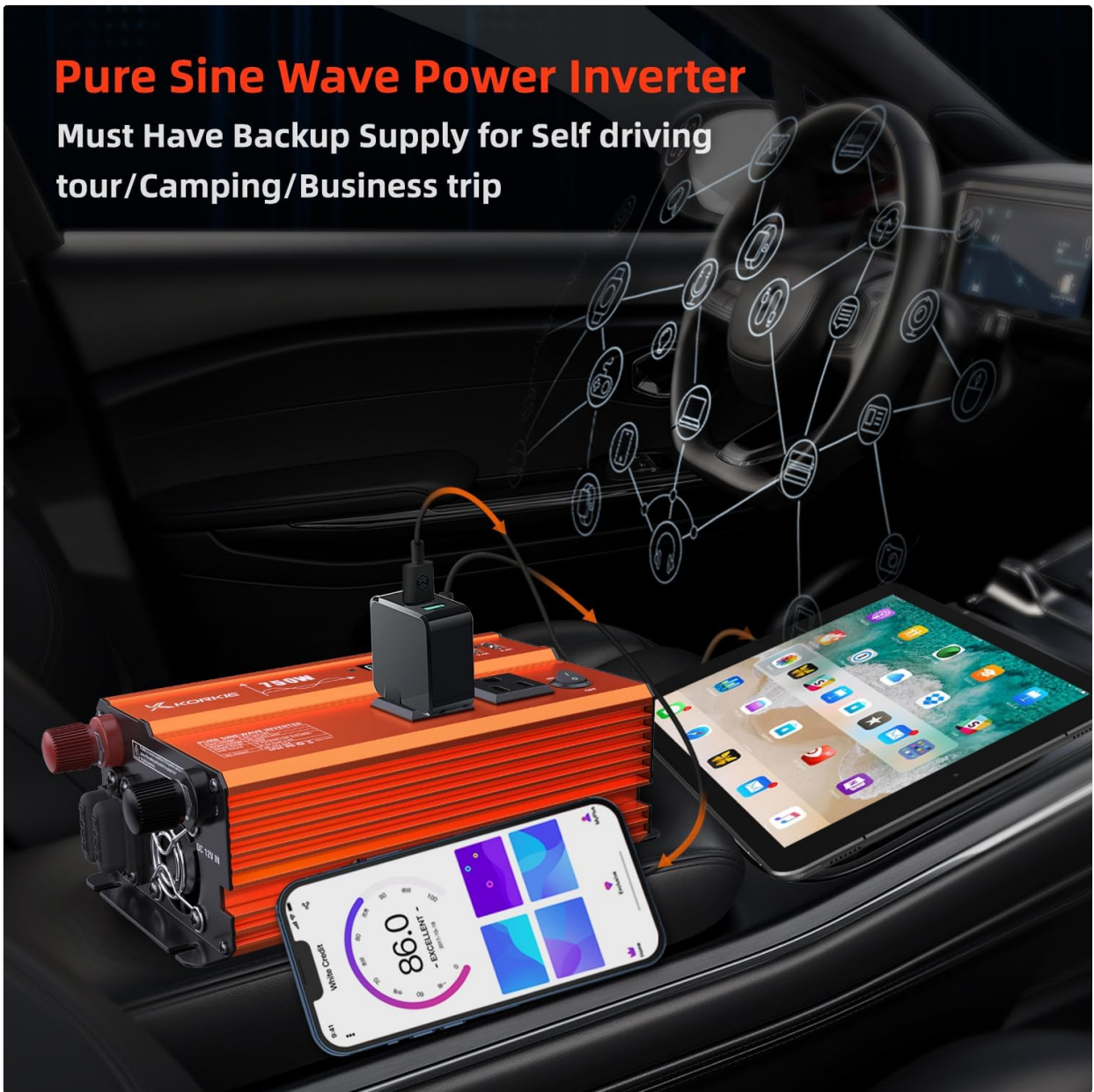
Figure 6.1: Inverter in a vehicle environment.

Must Have Backup Supply for Self driving tour/Camping/Business trip