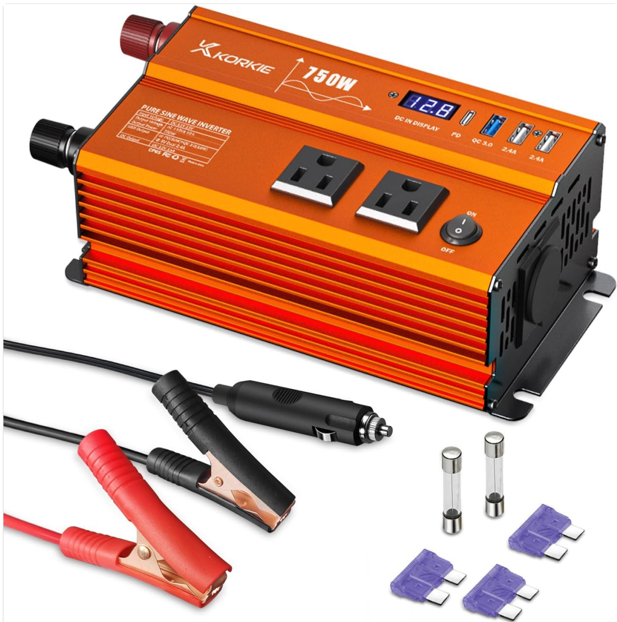
Figure 3.1: Inverter unit and included accessories.