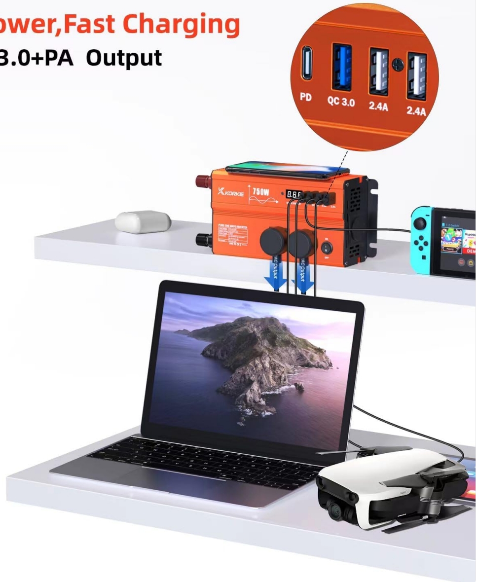
Figure 2.1: Inverter with multiple output ports for various devices.