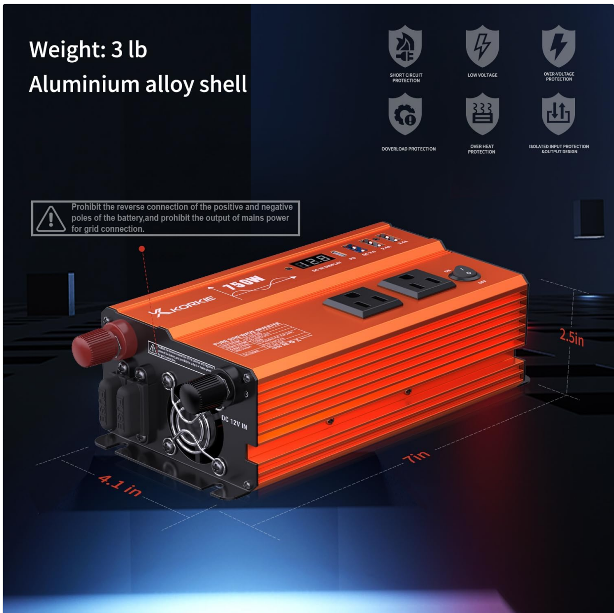
Figure 9.1: Inverter dimensions and weight.