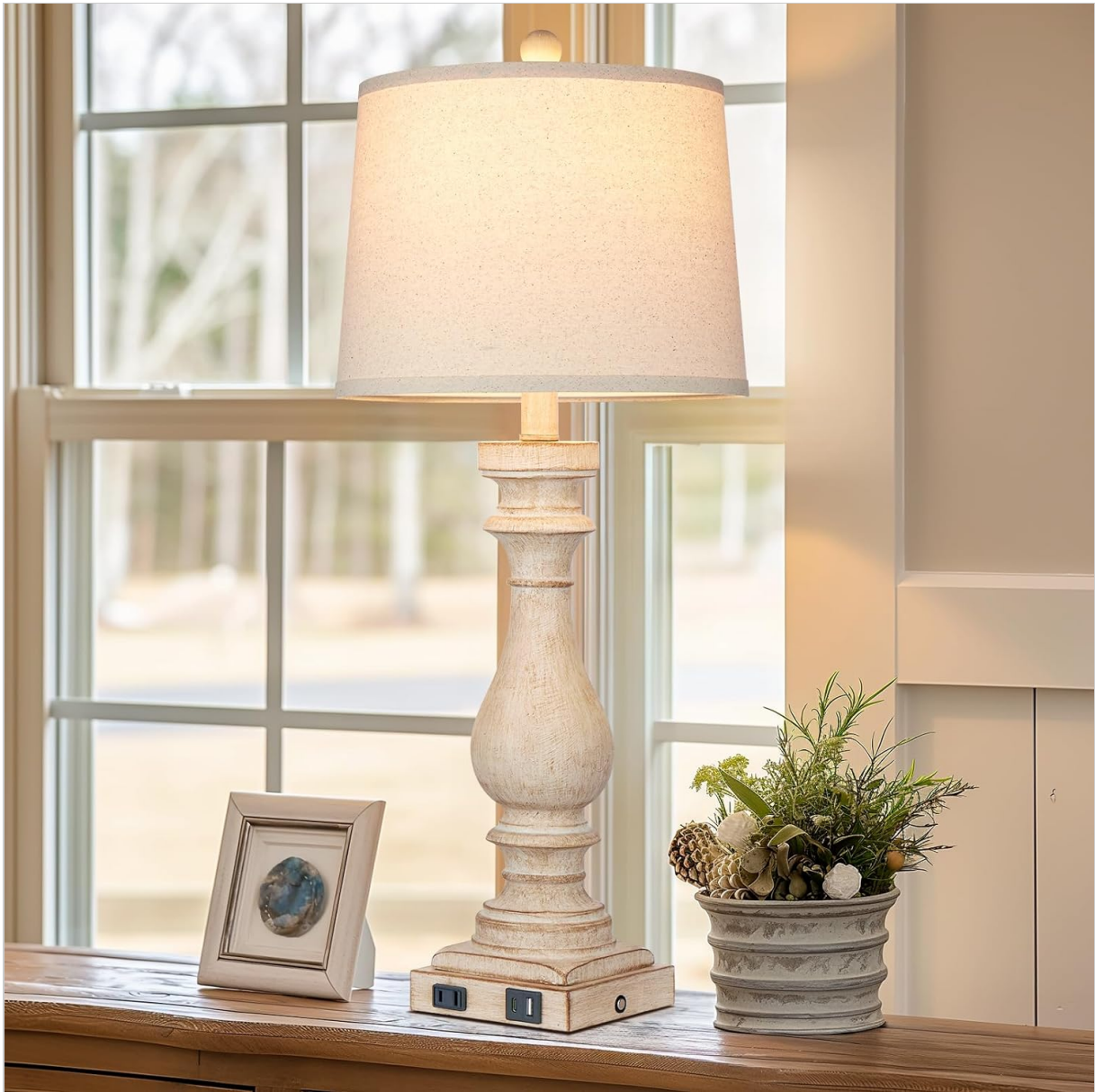
Image: The Cinkeda Farmhouse Lamp in a living room, highlighting its design and presence.