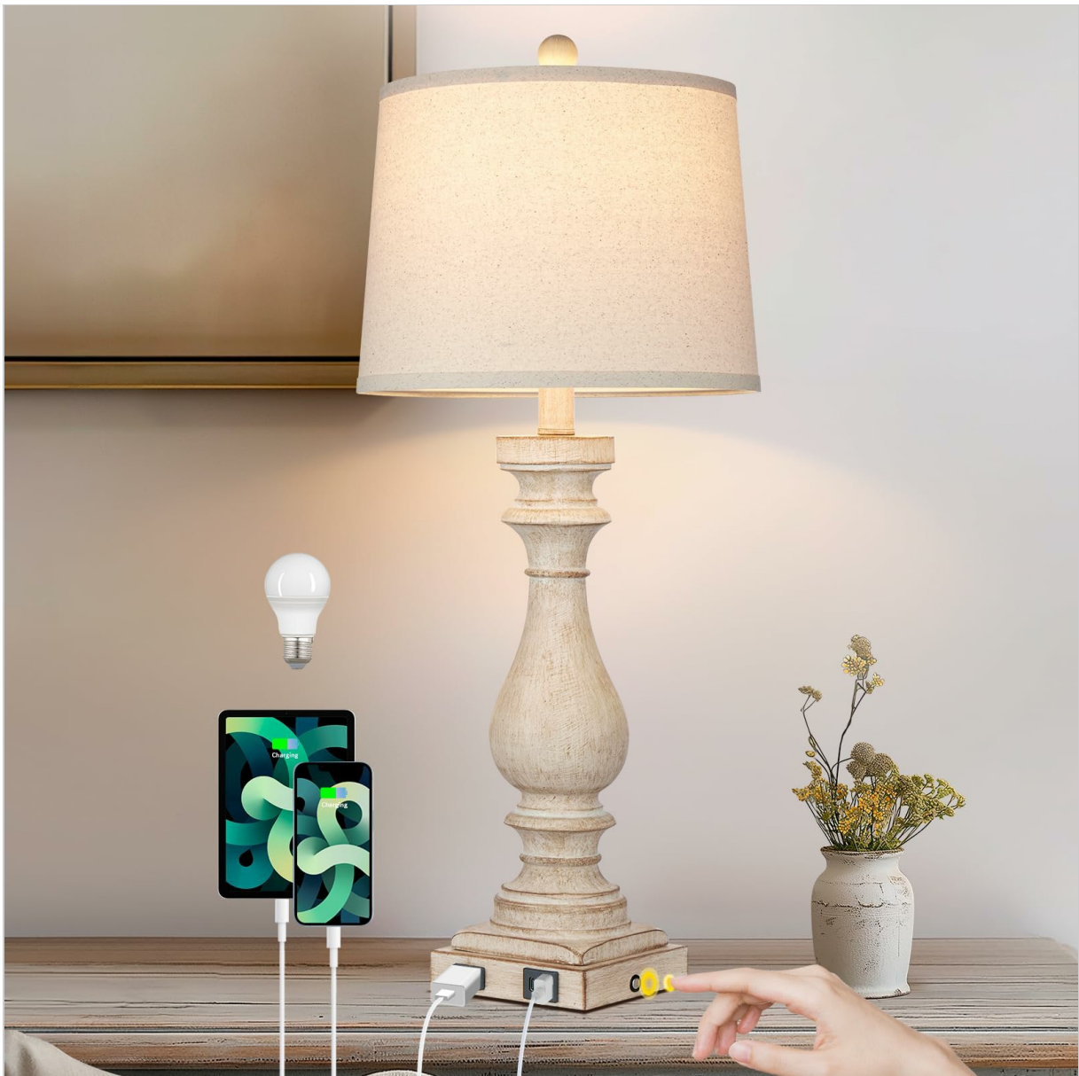
Image: The fully assembled Cinkeda Farmhouse Lamp, showcasing its design and ready for use.