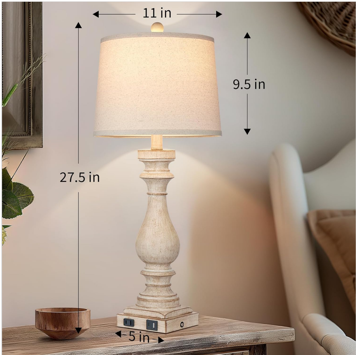
Image: Detailed dimensions of the lamp, including overall height, shade width, shade height, and base width.