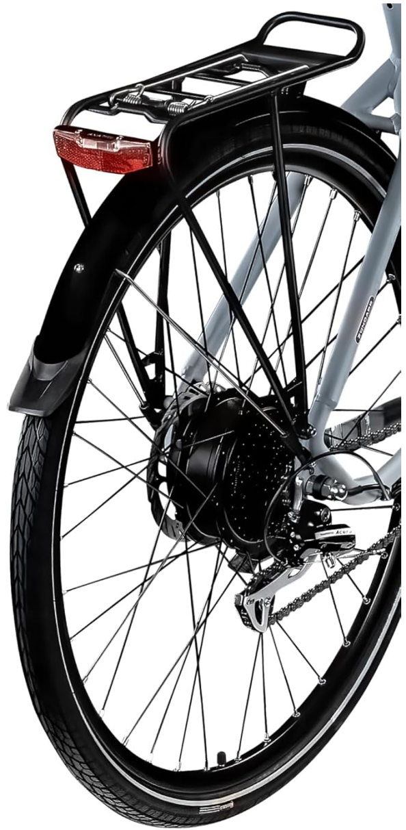
Image: A close-up of the ZÜNDAPP Ebike Z810's rear wheel, featuring the hub motor. The image describes the motor as perfect for both hilly and flat routes and emphasizes its energy-efficient design.