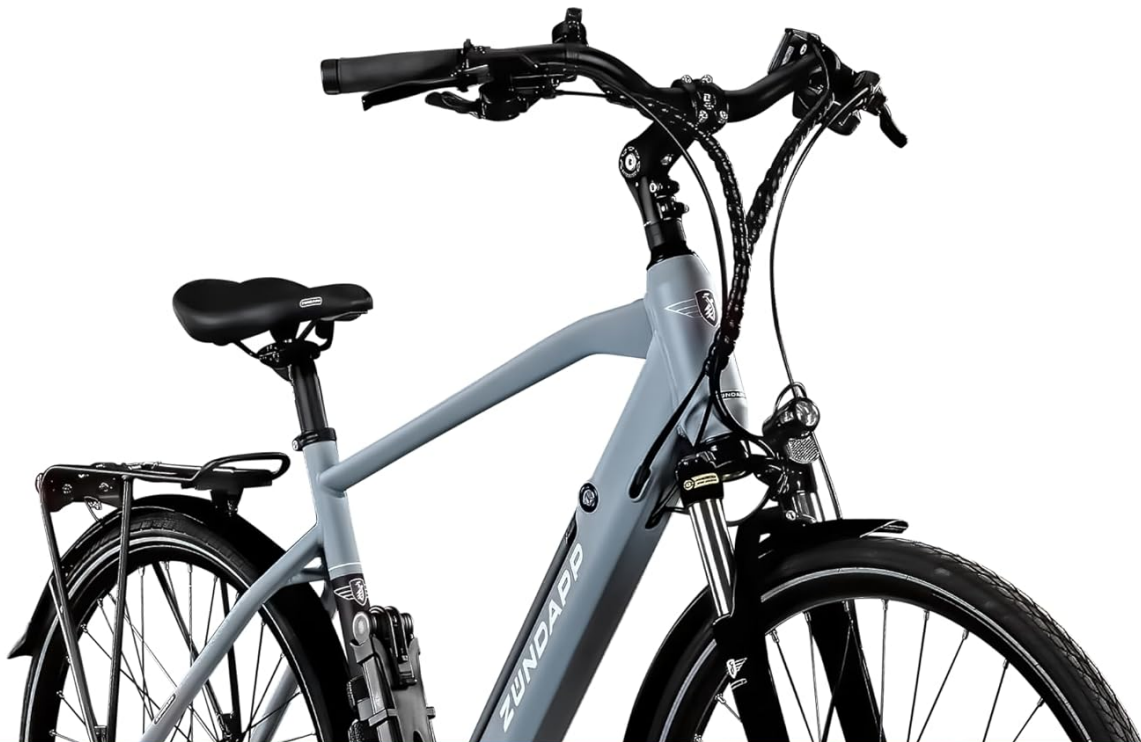
Image: A detailed view of the ZÜNDAPP Ebike Z810's front components. It highlights the hydraulic disc brake, designed for precise stopping, the luggage rack equipped with a spring flap, and the suspension fork, which provides effective shock absorption for a smoother ride.