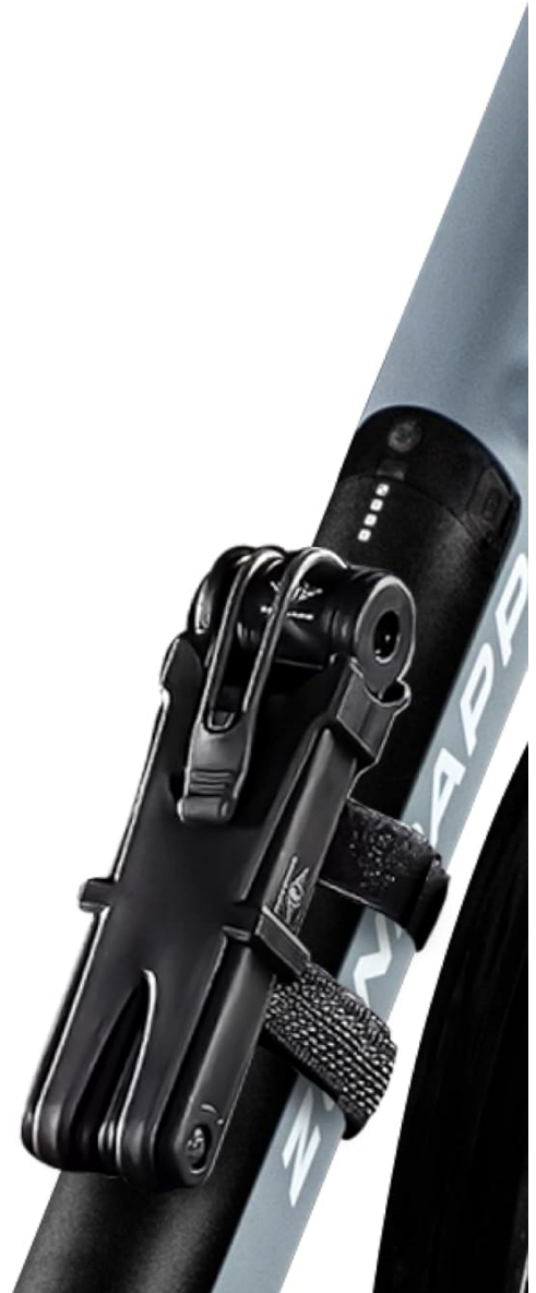
Image: A detailed view of the included folding lock for the ZÜNDAPP Ebike Z810. It highlights the lock's 85 cm length, its tool-free attachment mechanism, and its construction with 6 robust steel links, shown alongside its keys.