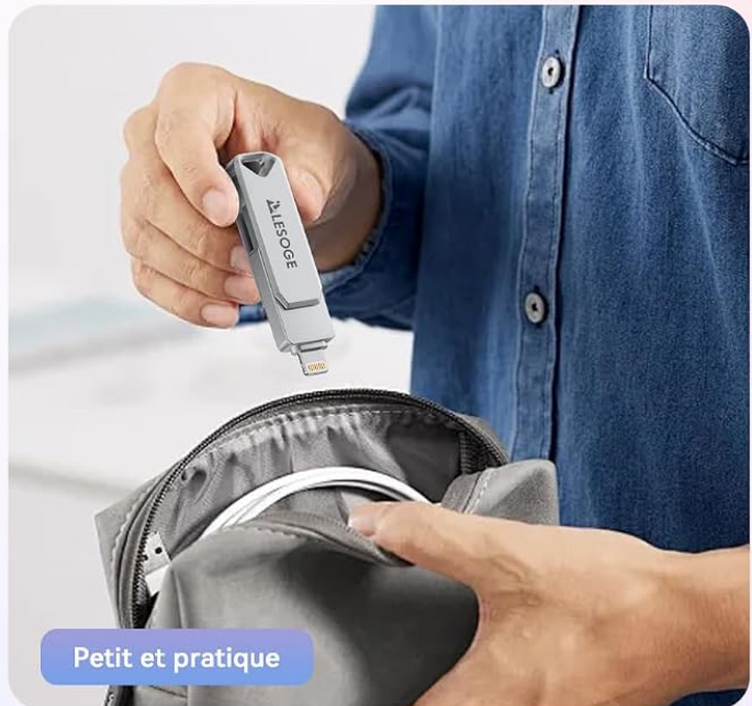
Image 7.1: Depicts various usage scenarios, including outdoor travel, office work, in-car music playback, and general portability.