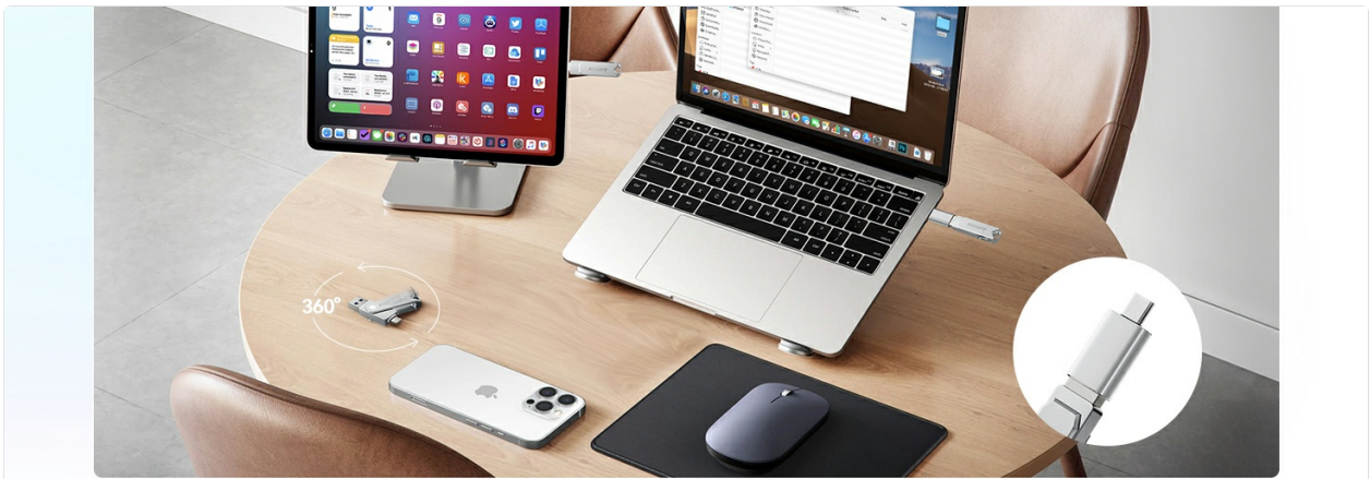
Notre clé usb iphone adopte un design de rotation à 360° , ce qui vous permet de passer facilement entre plusieurs ports et répondre à vos besoins de transfert de données entre plusieurs appareils.