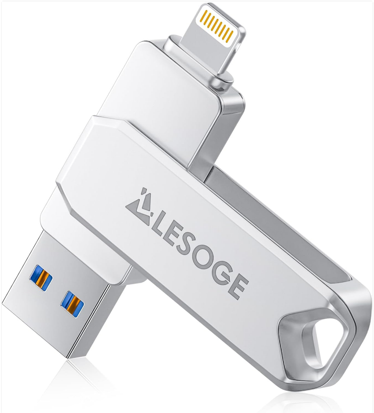
Image 1.1: The LESOGE 3-in-1 USB Flash Drive, featuring a sleek silver design with Lightning and USB-A connectors.