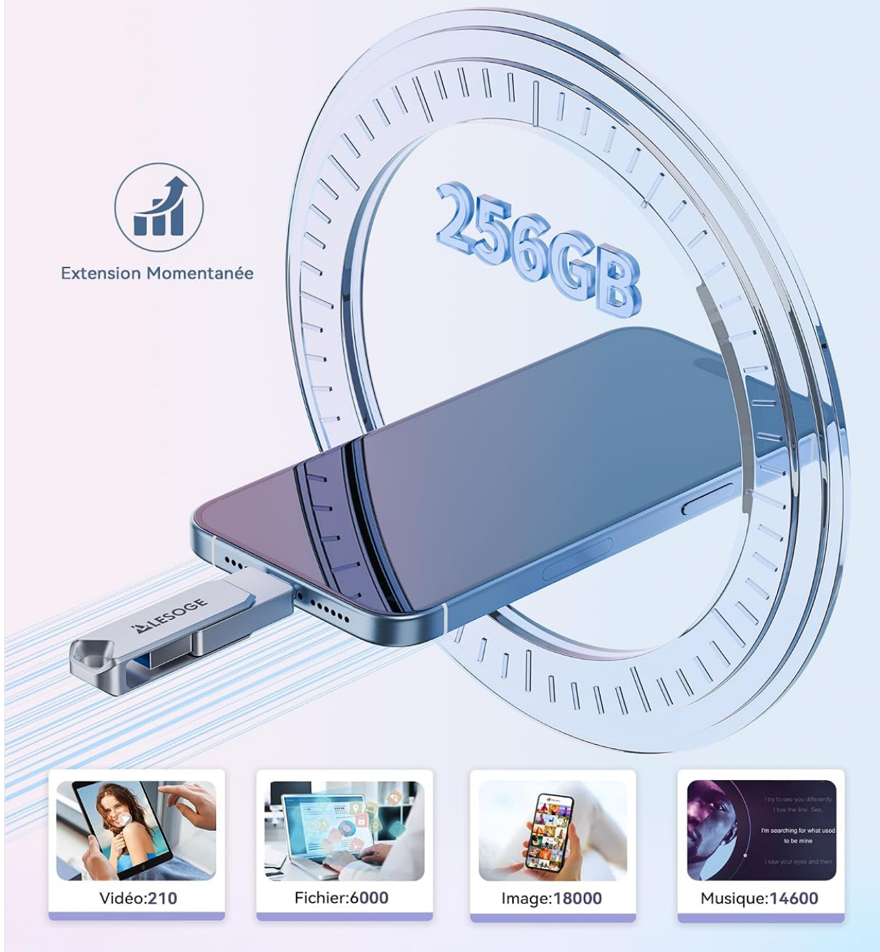
Image 2.2: A graphic illustrating the 256GB memory extension, capable of storing approximately 18,000 images, 210 videos, or 14,600 music files.

Dites adieu aux problèmes de mémoire insuffisante